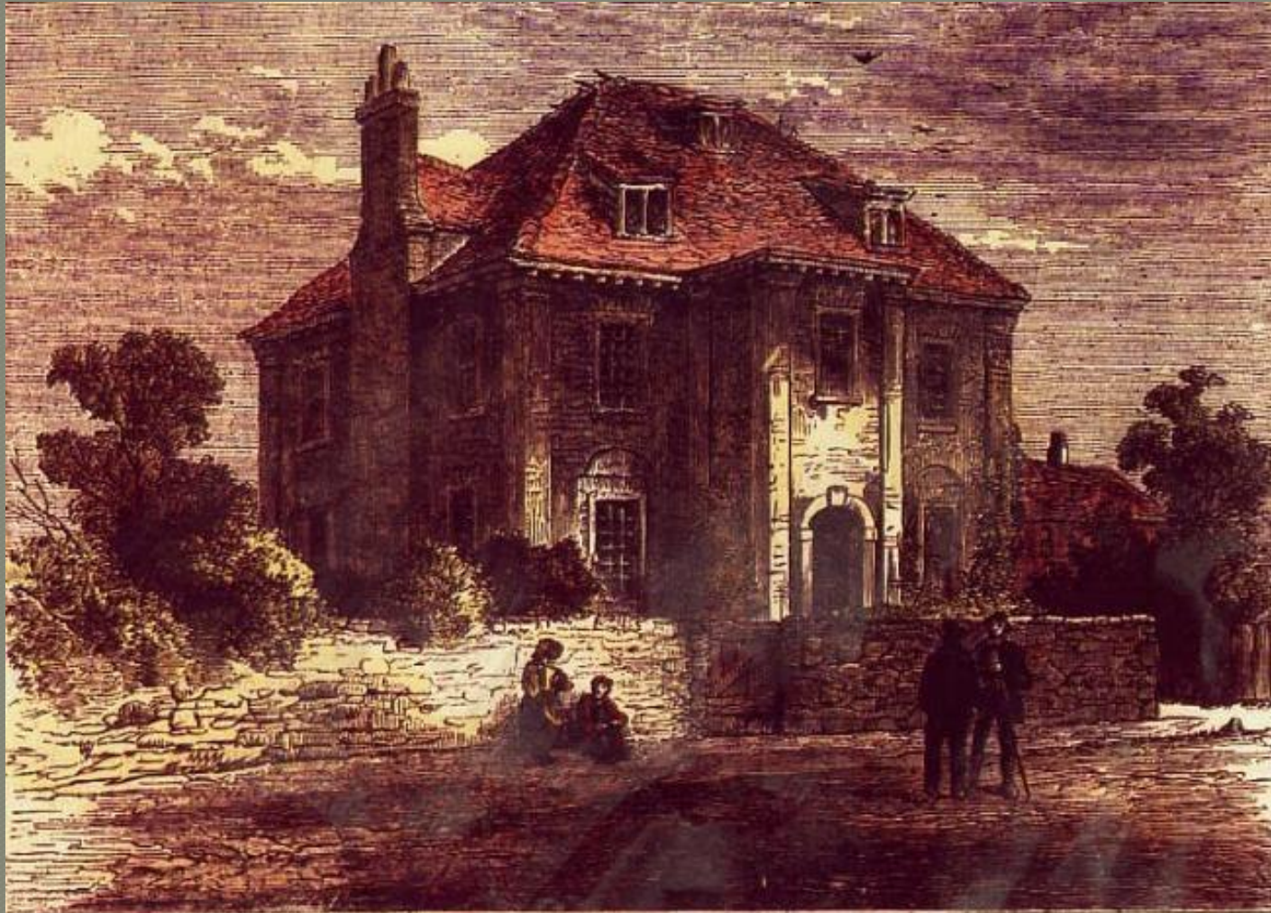
PETER THE GREAT'S HOUSE AT DEPTFORD (1850).

In England, Peter stayed for about three months, first in London and then, mainly in Deptford, where he managed to enlarge his shipbuilding education. At his request, the building selected was small and simple, with a door opening directly onto the riverbank.