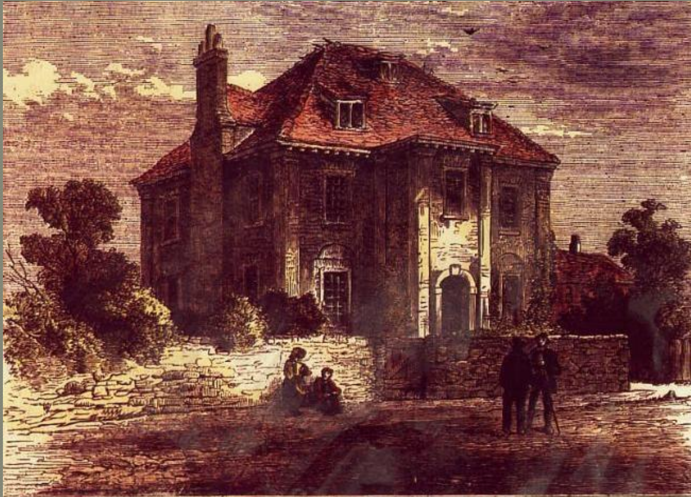
PETER THE GREAT'S HOUSE AT DEPTFORD (1850).

In England, Peter stayed for about three months, first in London and then, mainly in Deptford, where he managed to enlarge his shipbuilding education. At his request, the building selected was small and simple, with a door opening directly onto the riverbank.