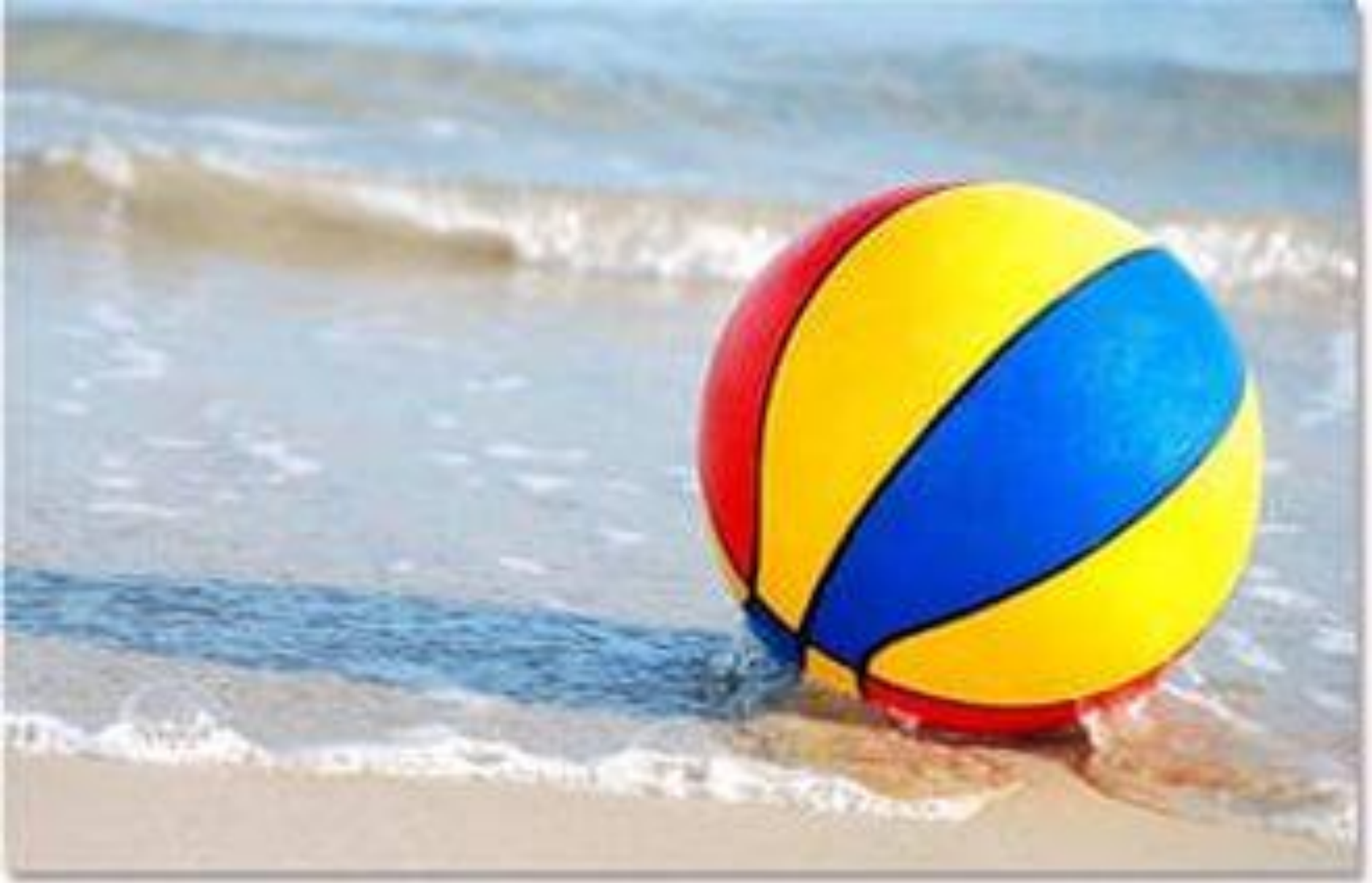
A beach ball