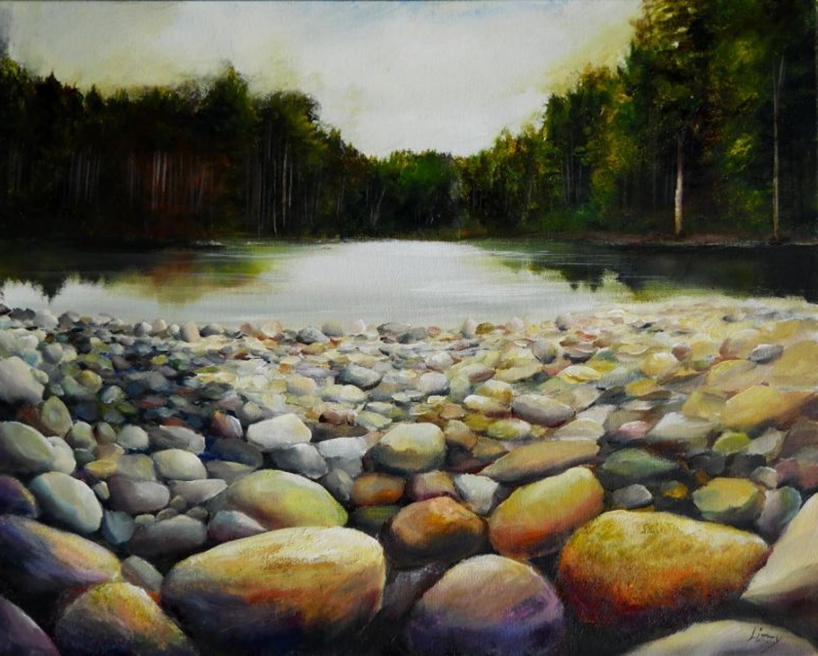
A rocky shore