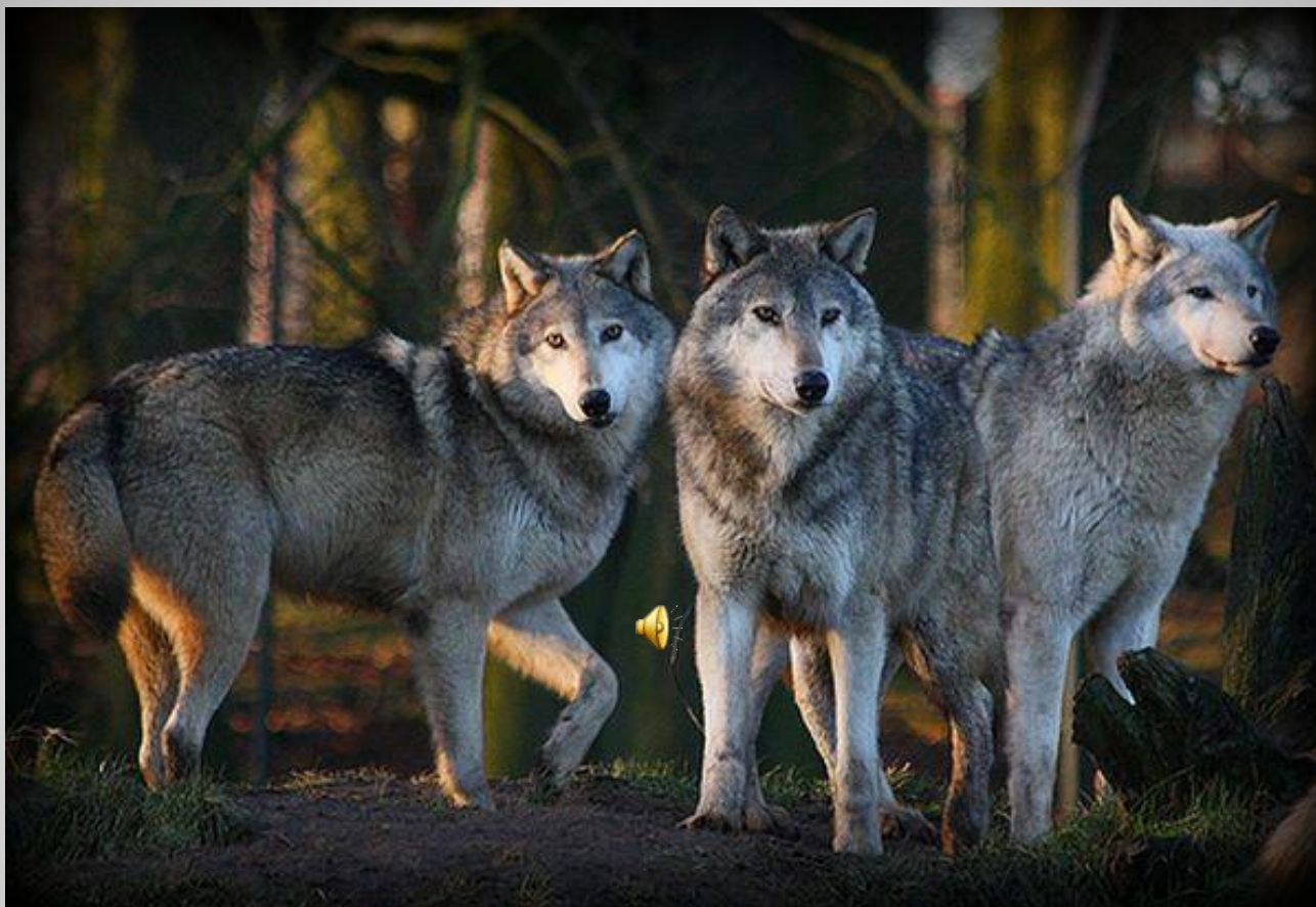
Bashkorts. A pack of wolves