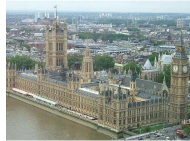
the West End