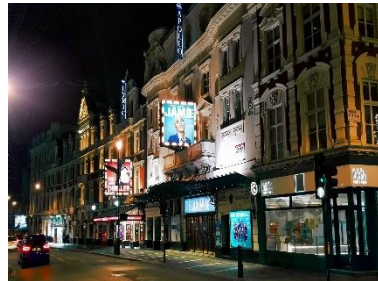
the West End