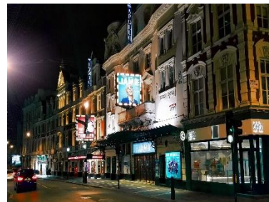
the West End