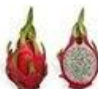
frutto del drago