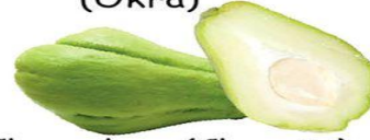
Chow chow (Chayote)