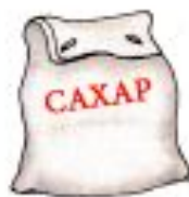
sugar ['ju:ɡə] сахар