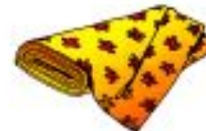
tissue ['ti:ʊ: ткань