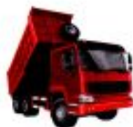
machine [mə'ʃi:n] машина