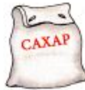
sugar ['ju:ɡə] сахар