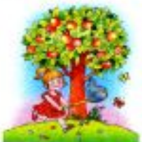
vacation [və'keɪʃn] отпуск, каникулы

Звук [ʃ] может также передаваться при помощи следующих букв и буквосочетаний: