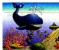
ocean [ou'ʃn] океан