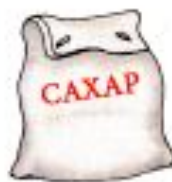
sugar ['ju:ɡə] сахар