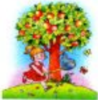
vacation [və'keɪʃn] отпуск, каникулы

Звук [ʃ] может также передаваться при помощи следующих букв и буквосочетаний: