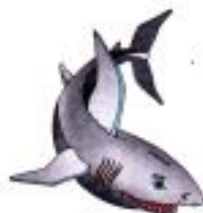
shark [ʃɑ:k] акула

Звук [ʃ] похож на мягкий глухой русский звук [ш]; в английском языке этот звук передаётся при помощи буквосочетания SH :