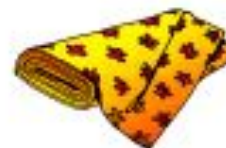
tissue ['tiʃu: ткань