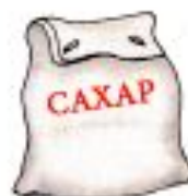
sugar ['ʃʊɡə] сахар