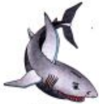
shark [ʃɑ:k] акула

Звук [ʃ] похож на мягкий глухой русский звук [ш]; в английском языке этот звук передаётся при помощи буквосочетания SH :