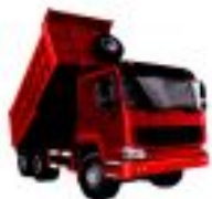
machine [mə'ʃi:n] машина