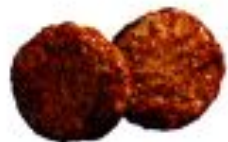
schnitzel [ˈʃnɪtsəl] шницель