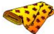
tissue ['ti:ʊ: ткань