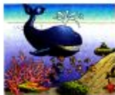
ocean [ou'ʃn] океан