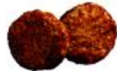
schnitzel [ˈʃnɪtʃəl] шницель