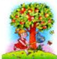
vacation [və'keɪʃn] отпуск, каникулы

Звук [ʃ] может также передаваться при помощи следующих букв и буквосочетаний: