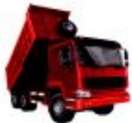
machine [mə'ʃi:n] машина