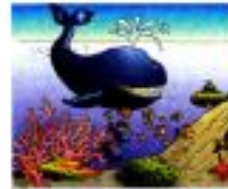
ocean [ou'ʃn] океан