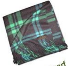
a tartan scarf