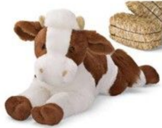
a stuffed toy