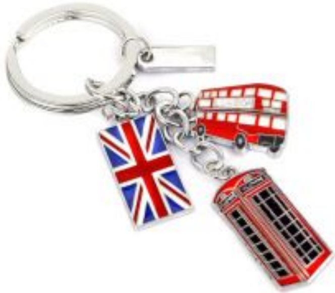
a key chain