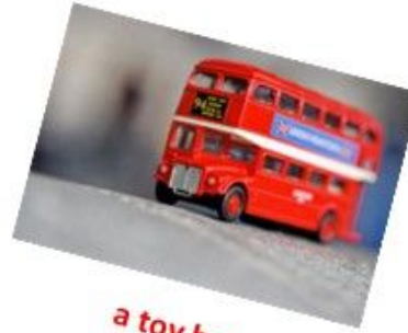
a toy bus