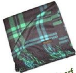
a tartan scarf