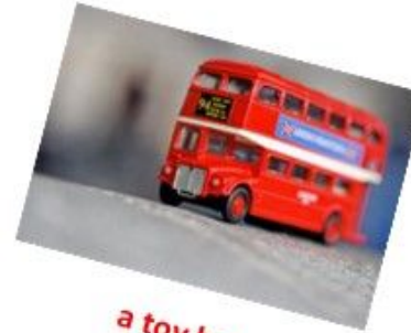
a toy bus