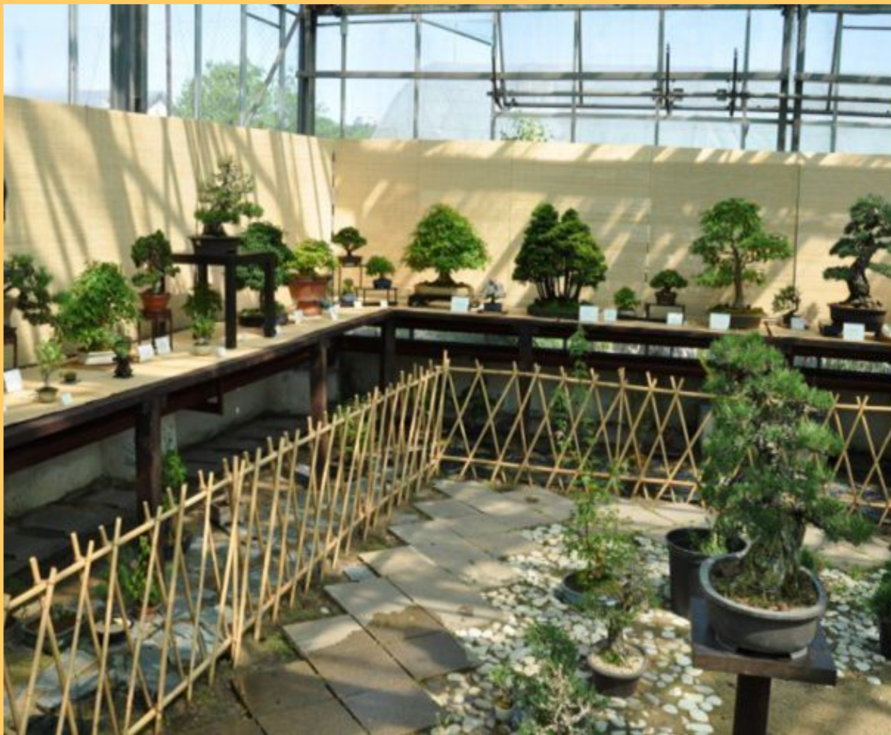
All-Russian Exhibition Centre, Pavilion № 23