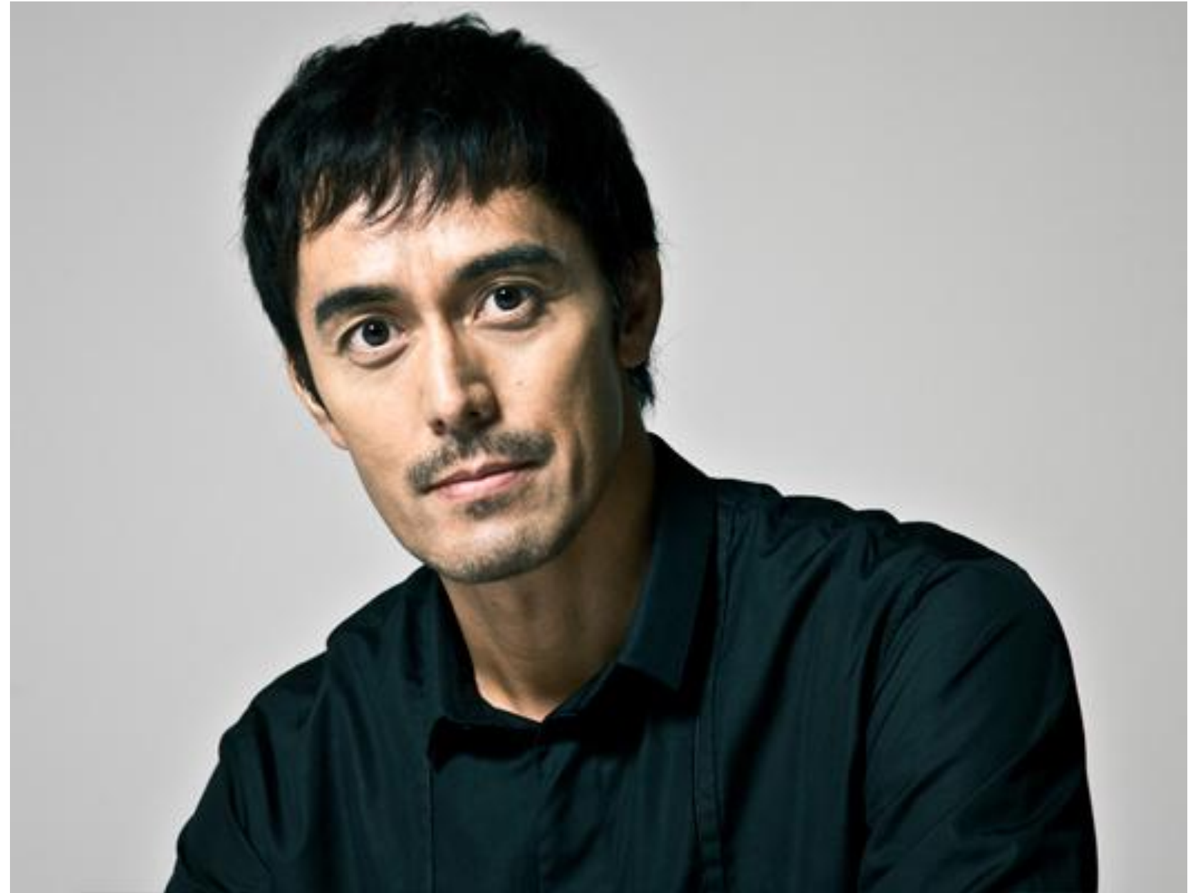
Saucegao (ソース顔/Sauce face)

Single eyelid, small and thin face, high nose