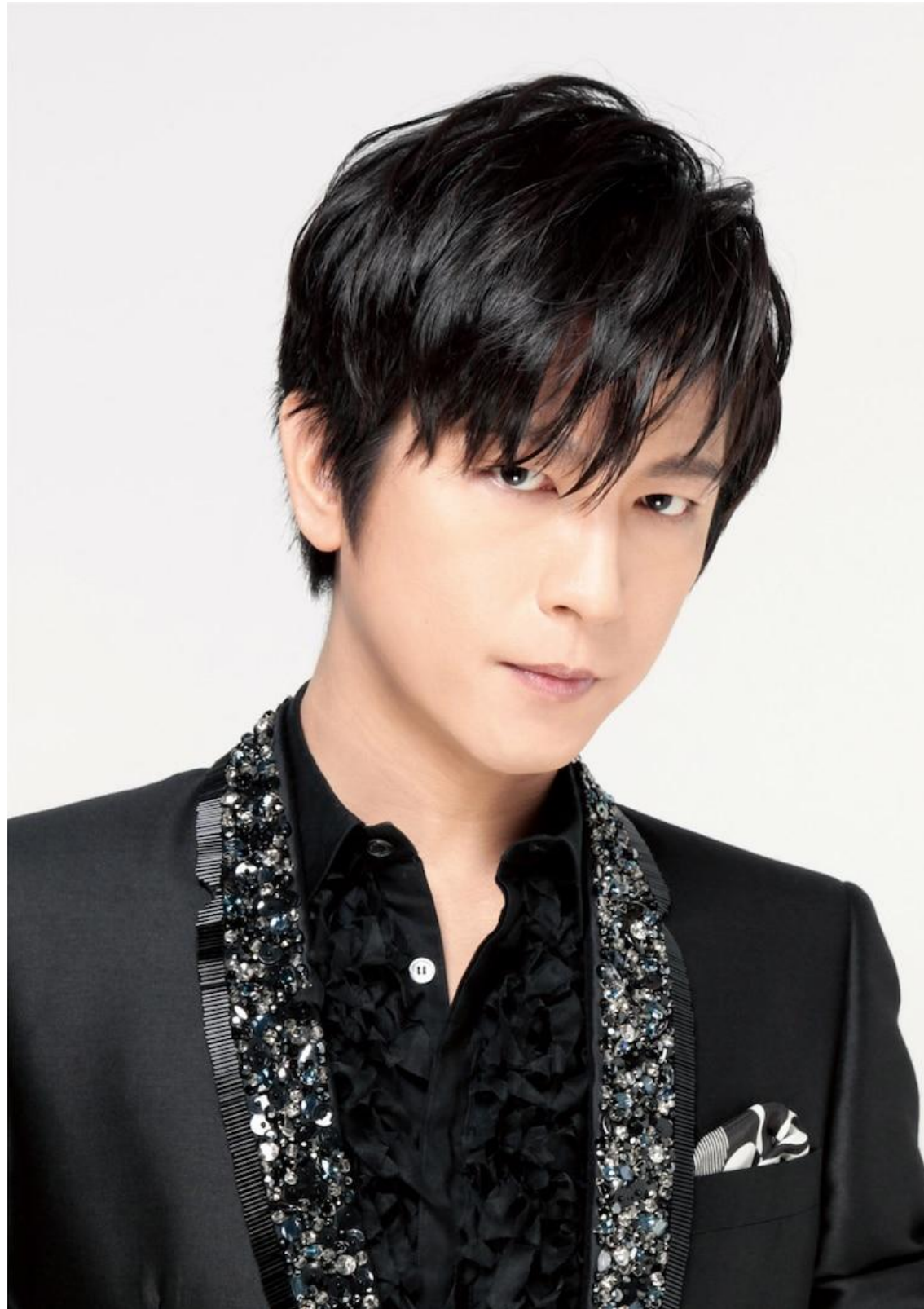
Shouyugao (しょうゆ顔/Soy-sauce face)

Single eyelid, small and thin face, high nose