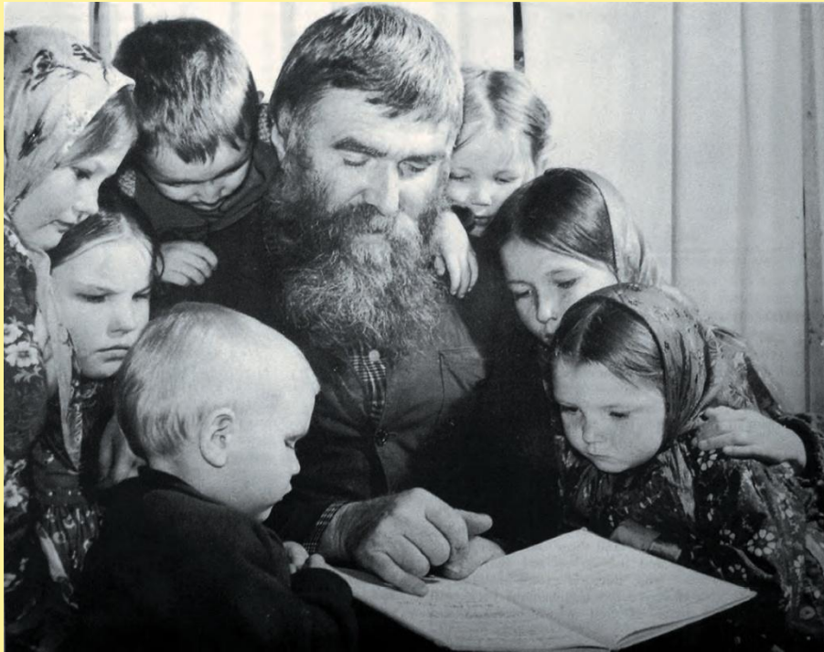
Russian orthodox “Old believers” in Brazil, 1967