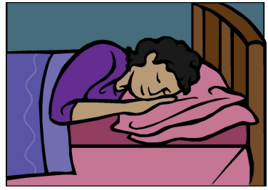
go to sleep?