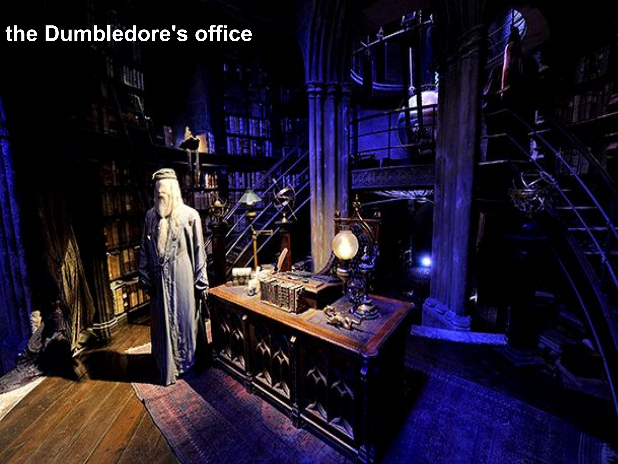
the Dumbledore's office