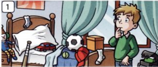
Lewis hasn't put his toys away.

not put make return print not turn on finish