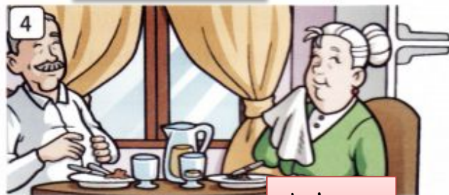
Grandma and Grandpa 's have finished dinner.