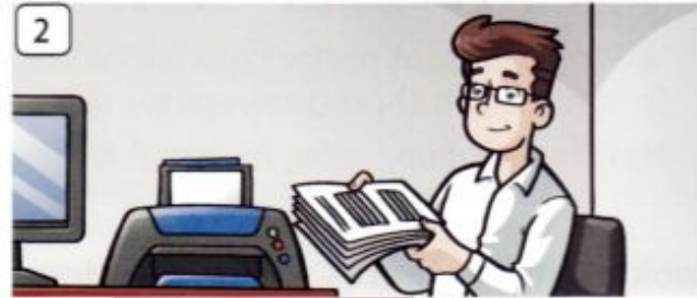
Dad 's printed a long document.