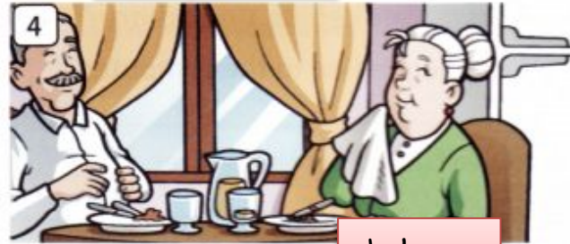
Grandma and Grandpa 's have finished dinner.