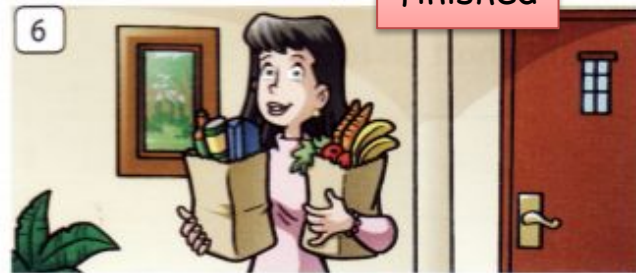
Mum 's returned from the shops.