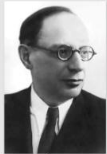
Ильиш Борис Александрович