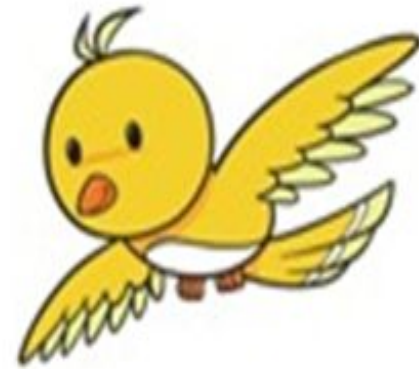
Fly - Flew - Flown