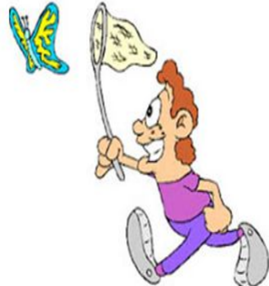
Catch - Caught - Caught