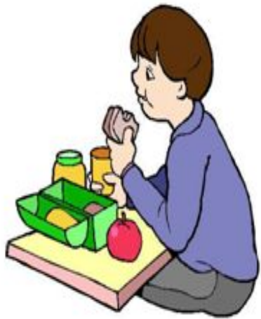
Eat - Ate - Eaten