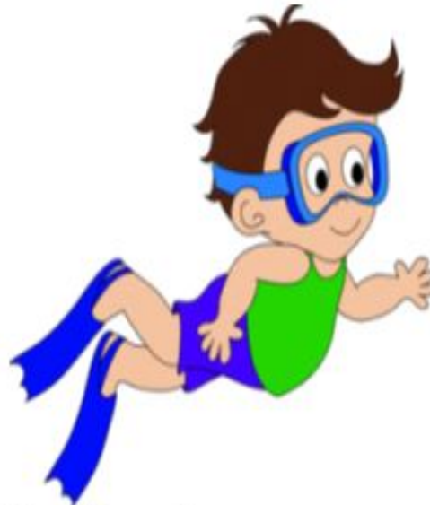
Swim - Swam - Swum