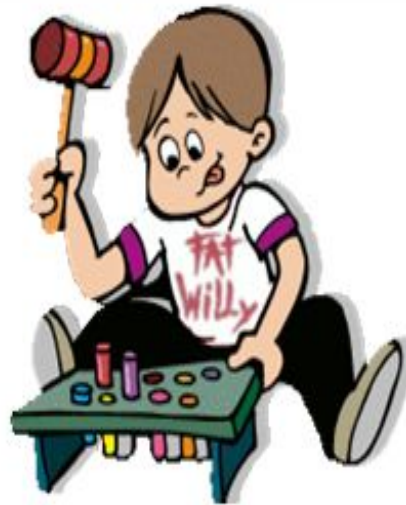
Build - Built - Built