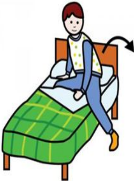
Wake - Woke - Woken