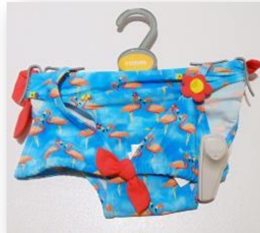
TRIANGLE BIKINI TOP SETS ARE TAGGED ON THE LEFT AT THE BOTTOM OF THE TRIANGLE, THROUGH TO THE BIKINI BOTTOM SEAM.