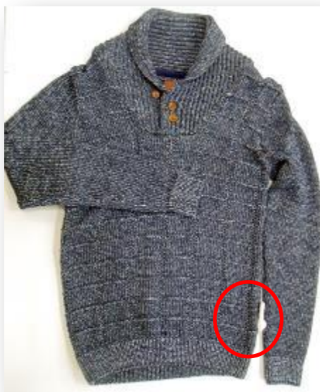
SHAWL COLLAR SWEATER