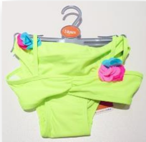
STANDARDS BIKINI TOP SETS ARE TAGGED ON THE BACK WAIST OF THE BOTTOMS TO THE LEFT OF THE WOVEN LABEL, THROUGH TO THE BACK STRAP SEAM.

BIKINI SETS ARE TAGGED ACCORDING TO THE BEST LOCATION IN ORDER TO SHOW THE PRODUCT TO THE CUSTOMER. HOLIDAY SHOP ACCESSORIES ARE STAGGED AS PER STANDARDS ACCESSORIES TAGGING. SUNGLASSES ARE TAGGED USING LANYARD TAG.