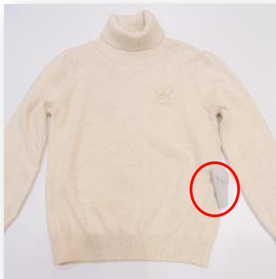
TURTLE NECK SWEATER

ALL KNITWEAR WITH A COLLAR INCLUDING TURTLE NECKS / SHAWL COLLARS ARE TAGGED ABOVE THE INSIDE SIDE SEAM GARMENT LABEL. BELTS ARE NOT TAGGED ON CARDIGANS. YOU MUST USE NORMAL PIN.