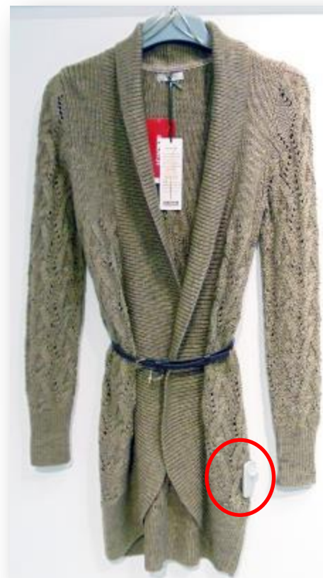
BELTED SHAWL COLLAR CARDIGAN