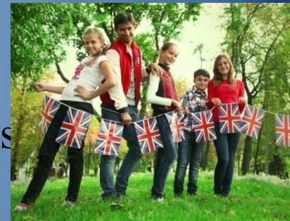
Spring and Late Summer Bank Holidays

Scottish people consider the New Year's Day to be also a public holiday.