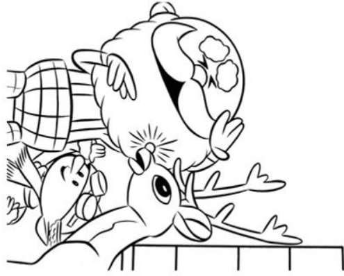
Rudolph visits Santa and the Elf.

"Rudolph," he _____ (shout), "I want YOU with your shiny nose to light the way for my sleigh tonight!" The other reindeers (make) space for Rudolph. Now they _____ (love) him and (say) how special he is.