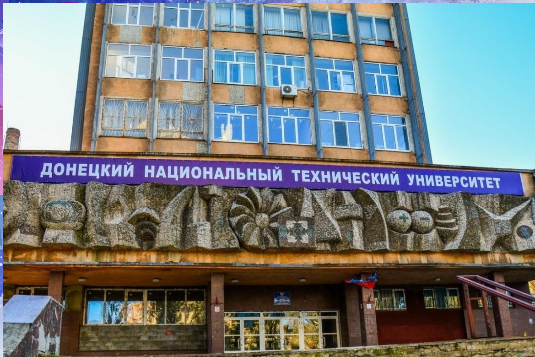
National Technical University