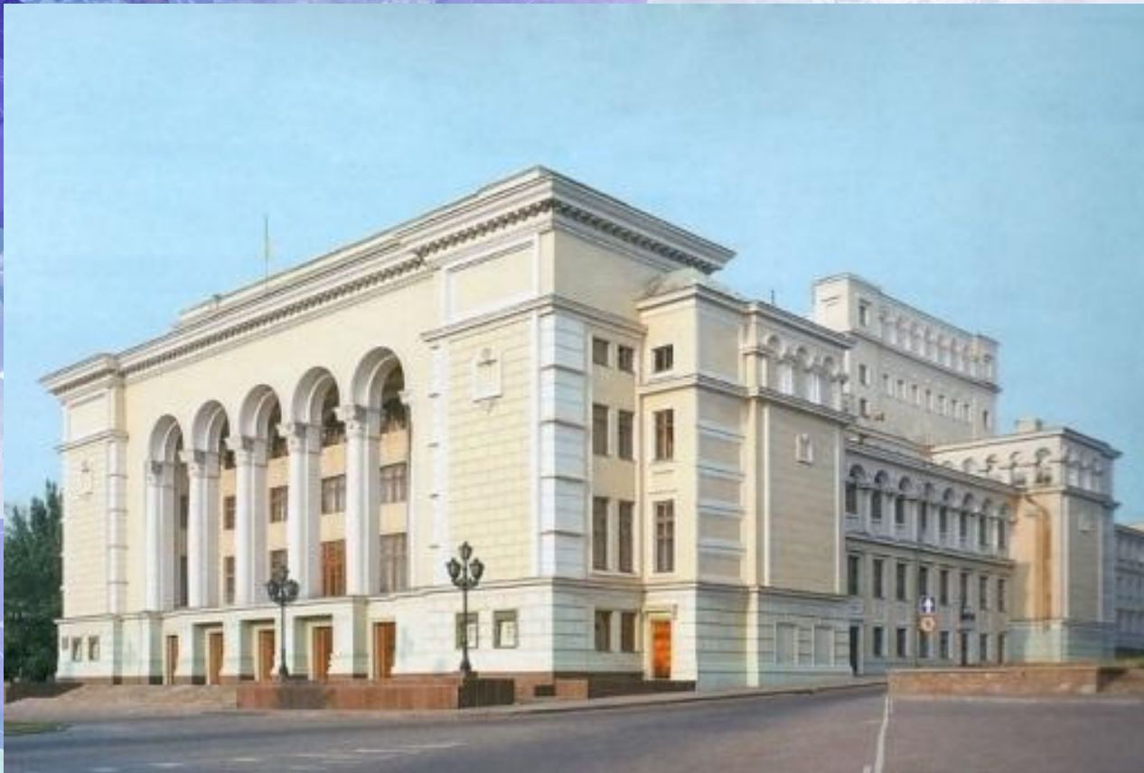
Donetsk Opera and Ballet House

There are 3 theatres and two museums in the city: Donetsk Opera and Ballet House, Donetsk Museum of Fine Arts are among them.