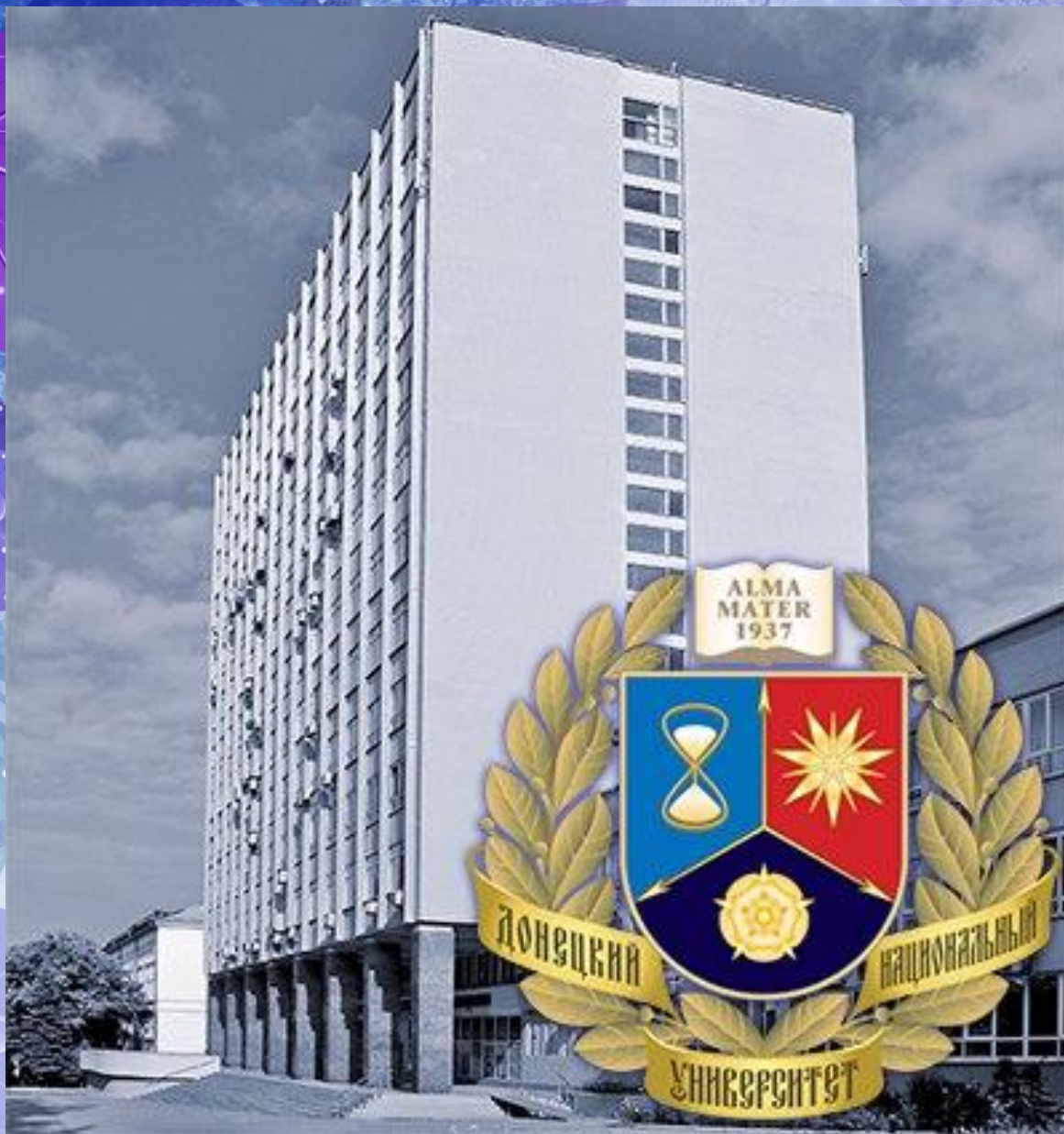
Donetsk National University