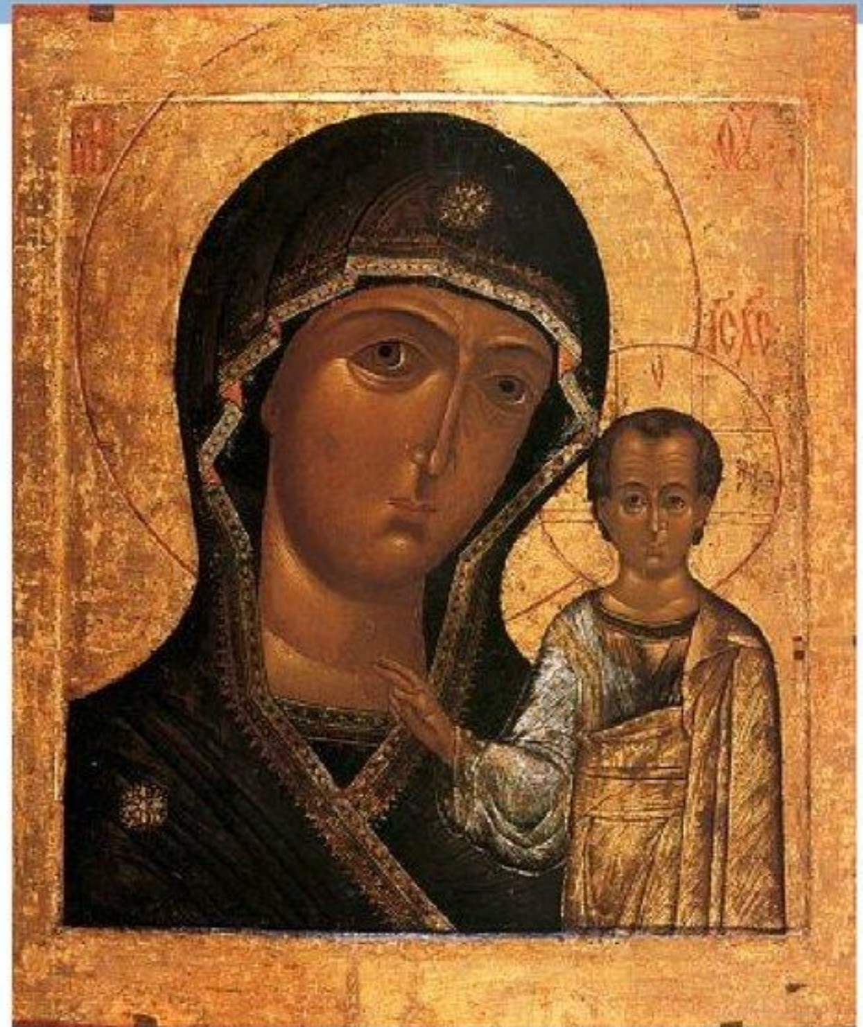
The Kazan icon of the Mother of God