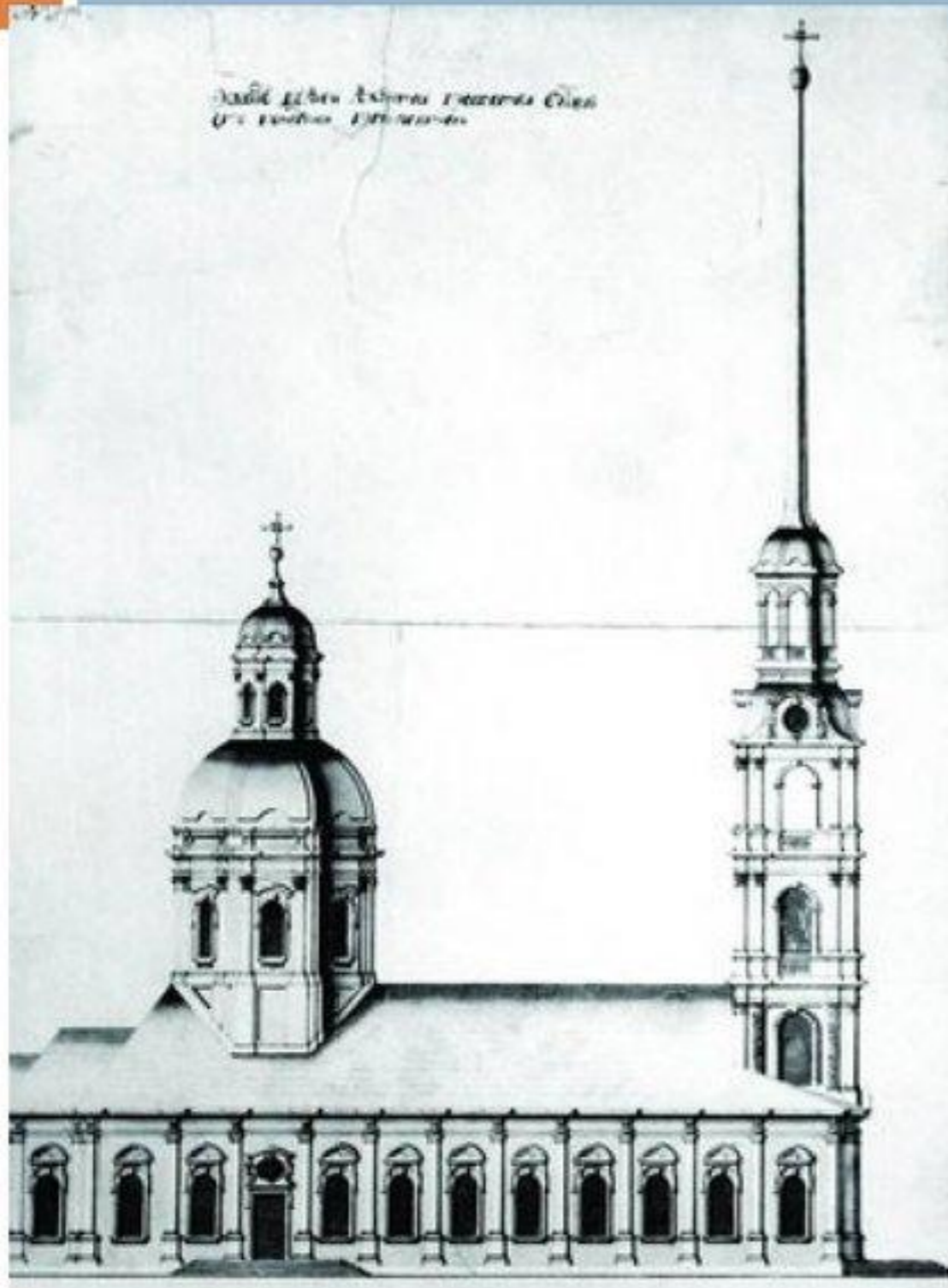
The Church Of Nativity

Previously on the site of the Cathedral was a small stone Church of the Nativity of the blessed virgin, where in 1737 was moved venerated image of our lady of Kazan. It was the first Orthodox Church on the Nevsky Prospekt.