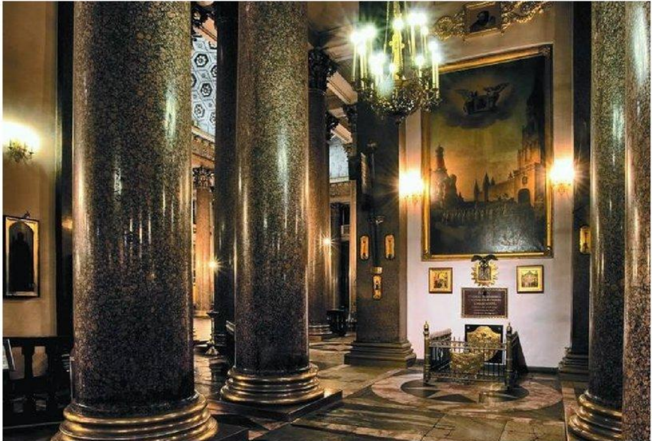
The tomb of field Marshal M. I. Kutuzov

In 1813, the Cathedral was buried field Marshal Mikhail Kutuzov.