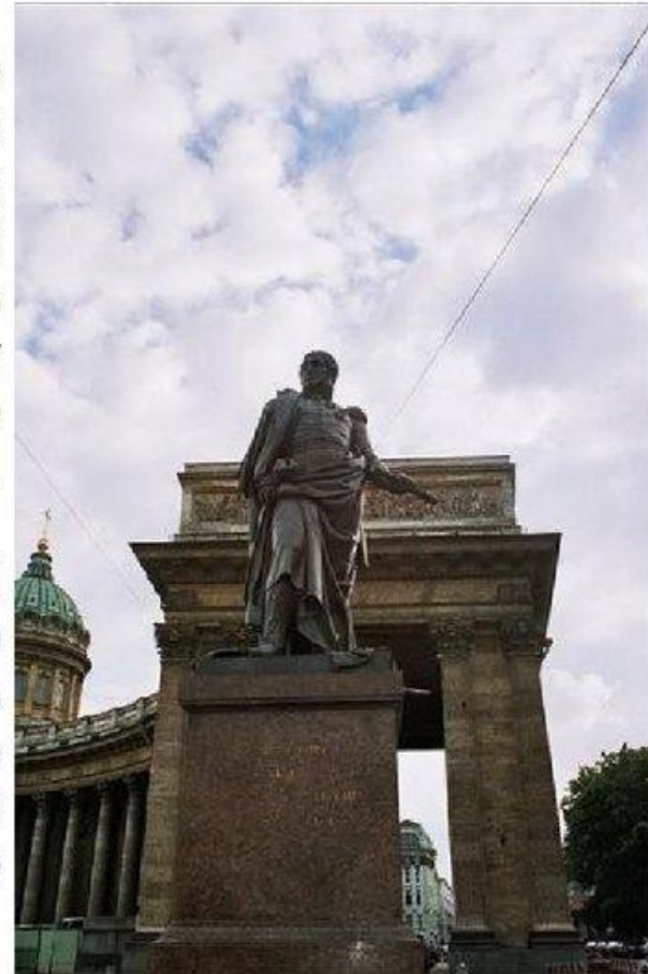
General Barclay De Tolly