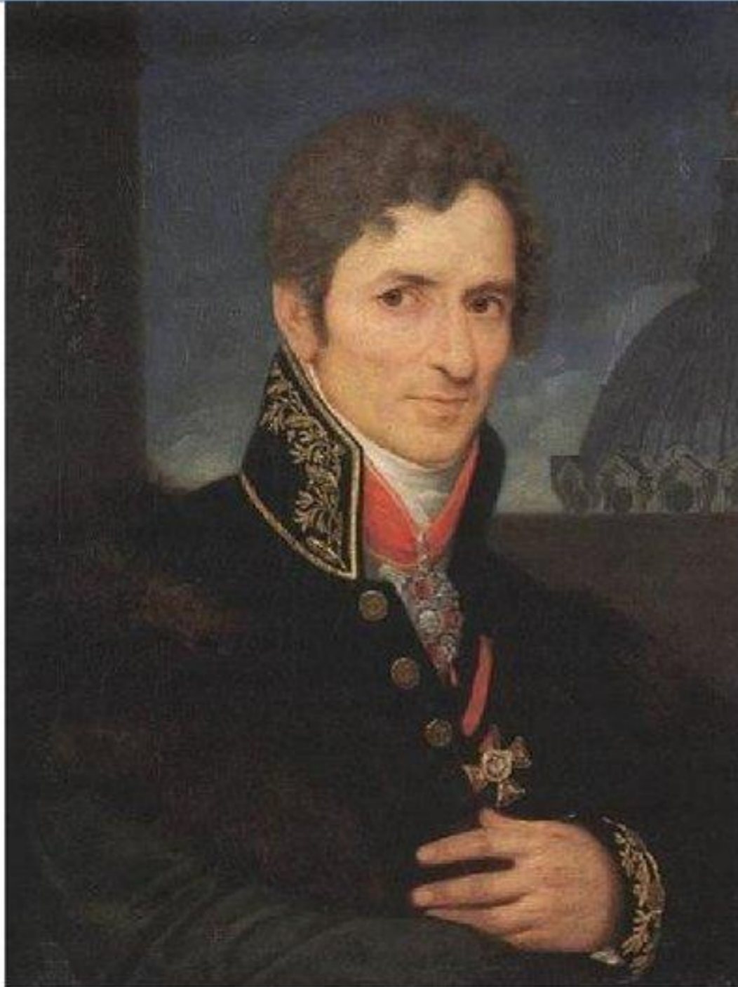
Andrey Nikiforovich Voronikhin, architect

By the late 18th century, the Church building became dilapidated and no longer fit established by the time of the appearance of the main Nevsky Prospekt. And in November, 1800, by results of competition of projects of a new Cathedral, a project was approved, executed by the architect A. N. Voronikhin.