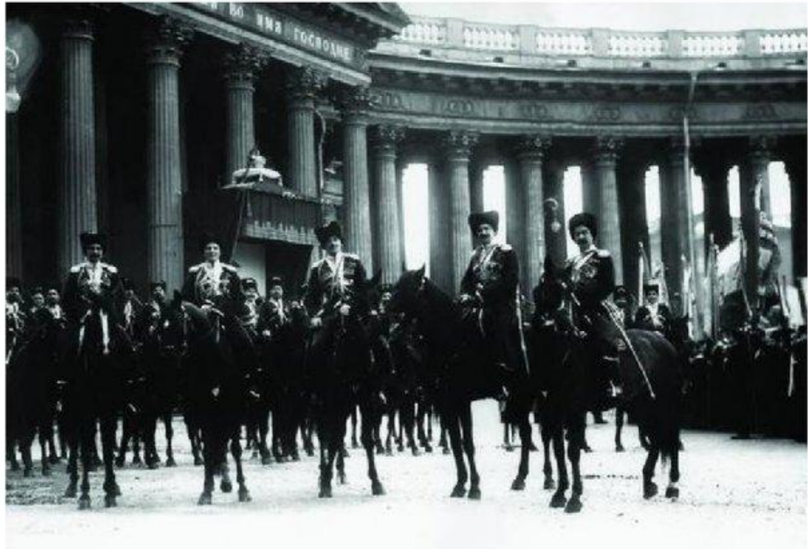
The officers of the life guards regiment of His Majesty