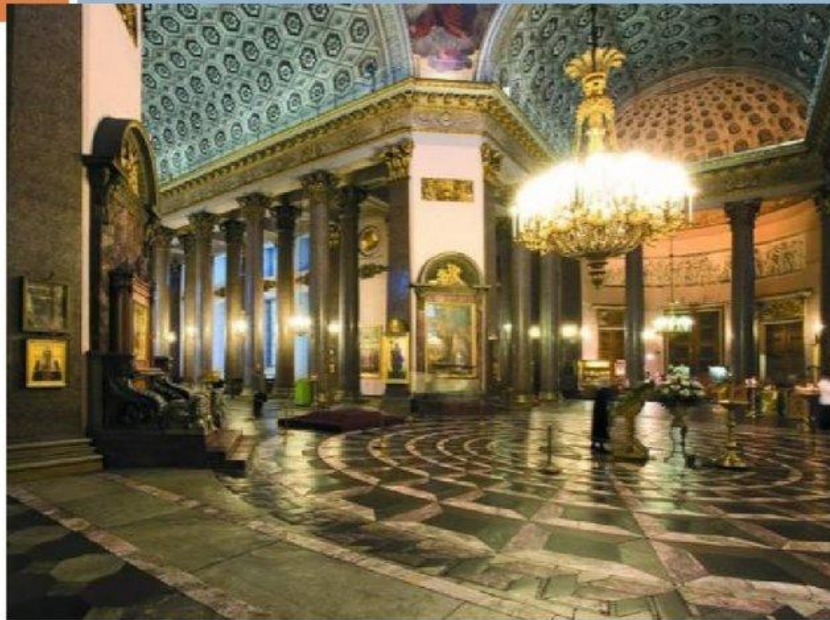
Interior of the Kazan Cathedral. The Central part.

The construction of the Cathedral lasted 10 years, the decoration of the temple was used mainly domestic materials: marble Olonetsky, Vyborg and Serdobol granite, Riga and Pudozh limestone. For the first time in the global construction practice, Voronikhin was applied to the metal structure of the dome.