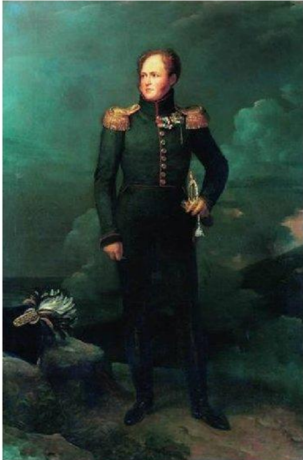
The Emperor Alexander I

September 8, 1801, took place the solemn ceremony of the Kazan Cathedral, which was attended by Emperor Alexander I.