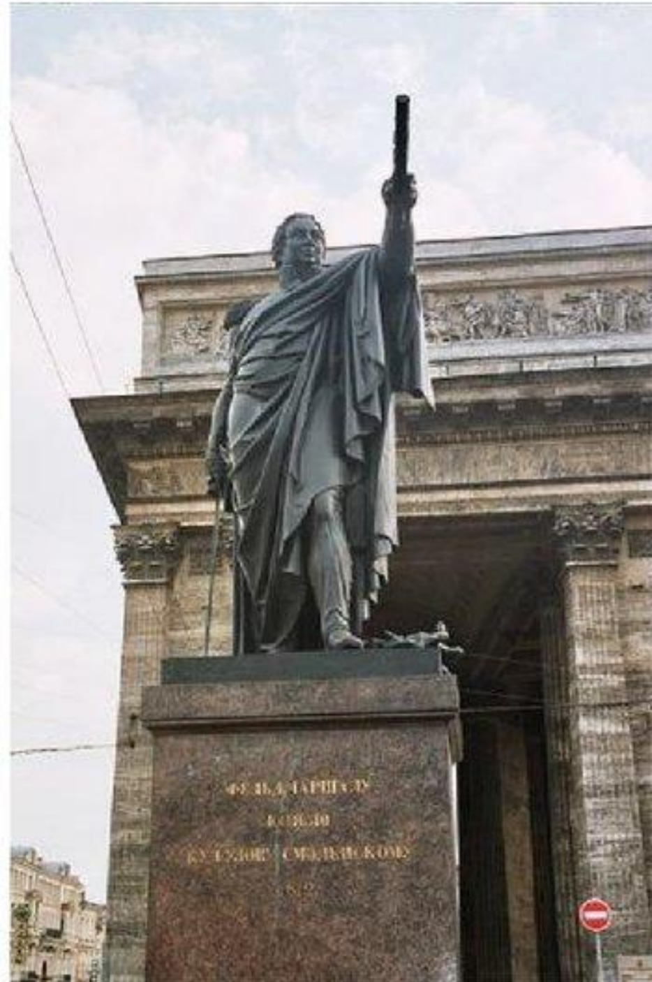
Field Marshal M. I. Kutuzov

Monuments memorial stressed the importance of the Kazan Cathedral as a kind of monument to the immortal feats performed by Russian soldiers in the name of the Fatherland.