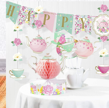
Tea Party Theme $90