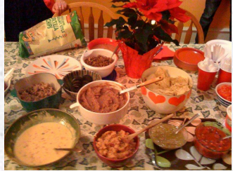
Taco Bar $225