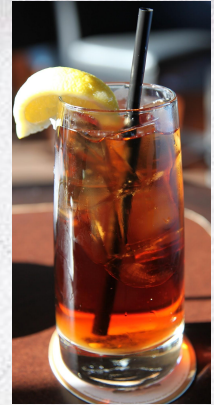
Sweet/Unsweet Tea $15