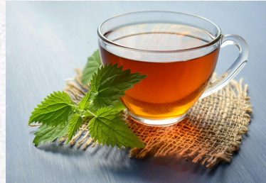
Hot Tea $5