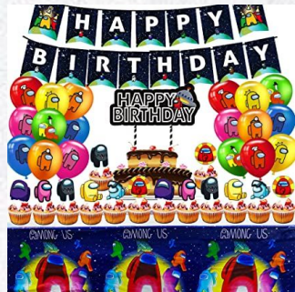
Among Us Theme $70