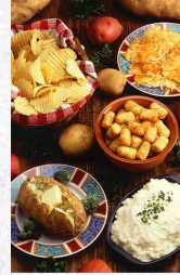
Baked Potato Bar $250