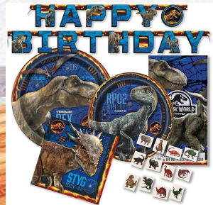
Jurassic World Theme $60