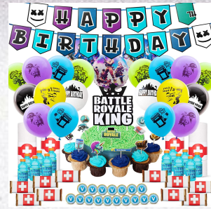
Fortnite Theme $80