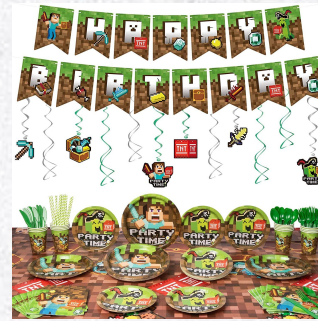
Minecraft Theme $80