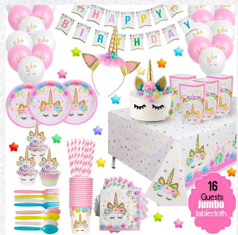
Unicorn Theme $40