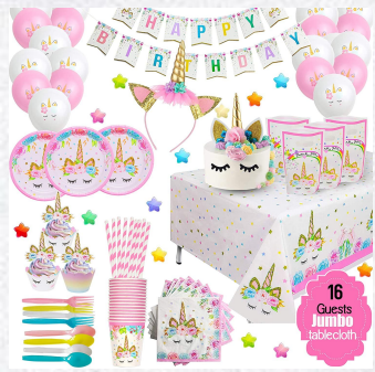
Unicorn Theme $40