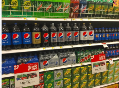
Soda Pop $30