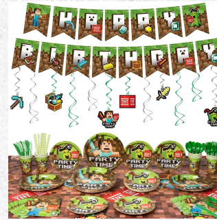
Minecraft Theme $80