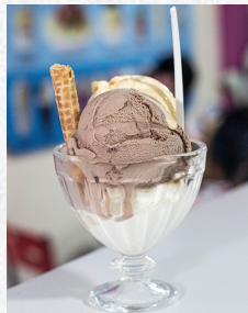
Ice Cream $20