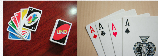
Card Games $25