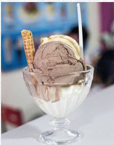
Ice Cream $20