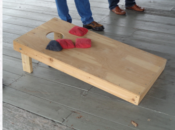
Corn Hole $30