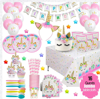
Unicorn Theme $40