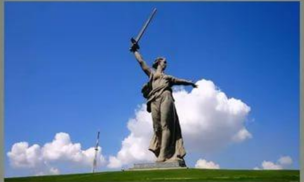
Mamaev Kurgan - the heart of Volgograd

In Volgograd there are many monuments raised in the memory of the Great Victory in the Great Patriotic War.