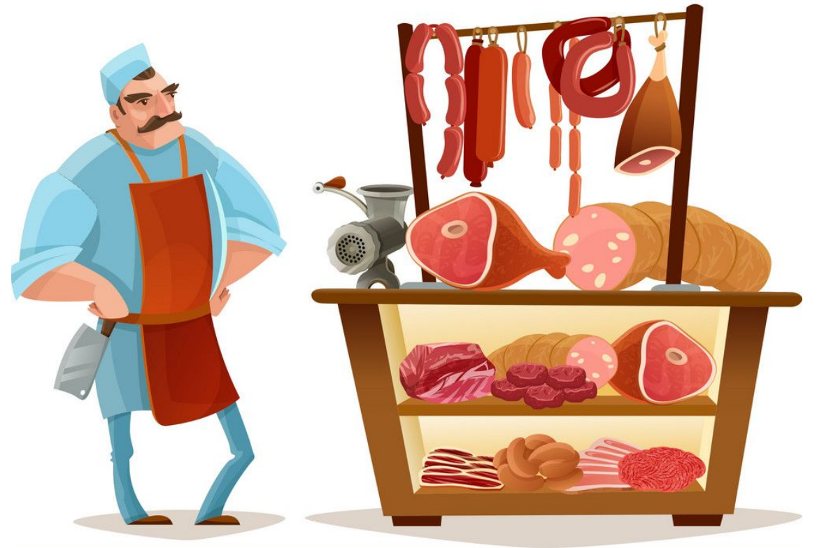
He is a butcher