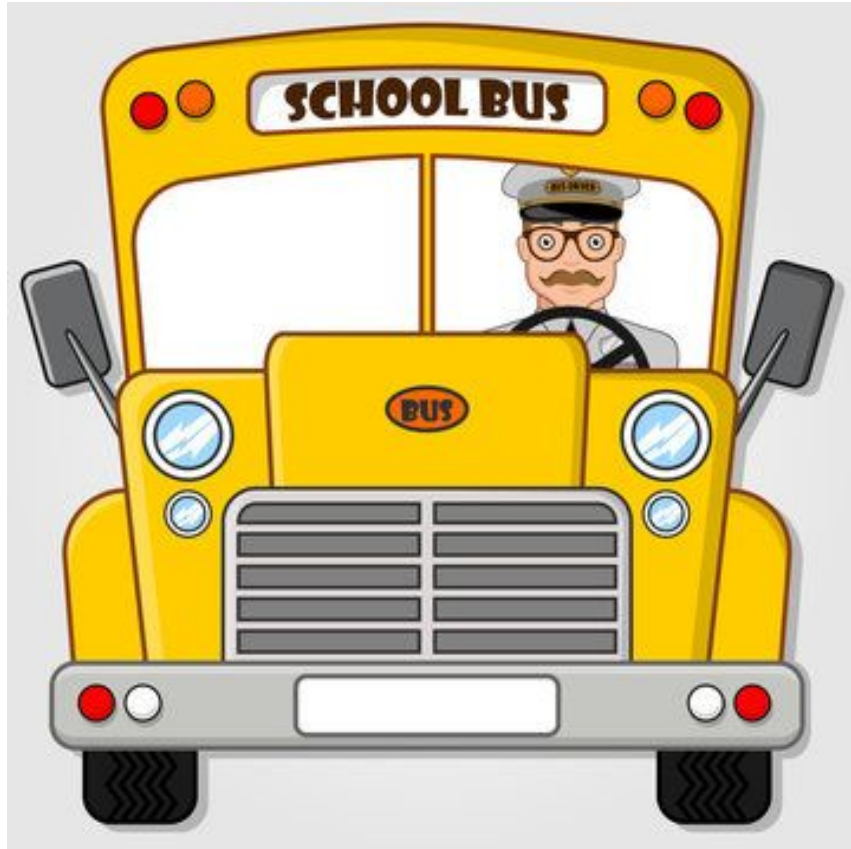
He is a bus driver