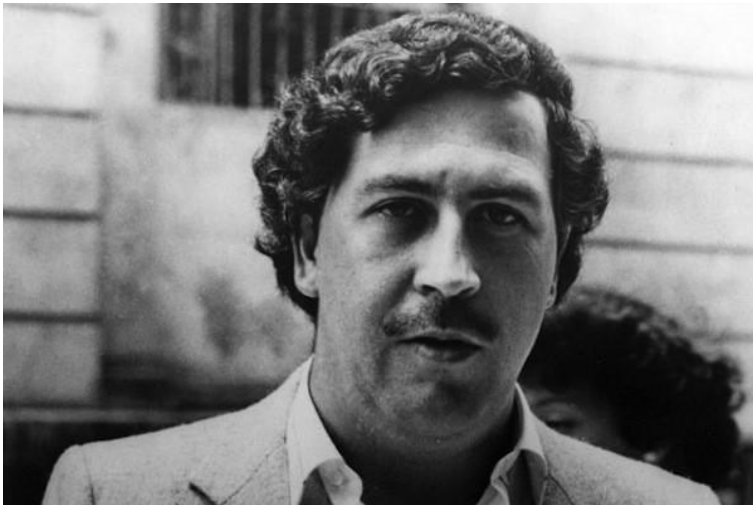
● Пабло Эскобар