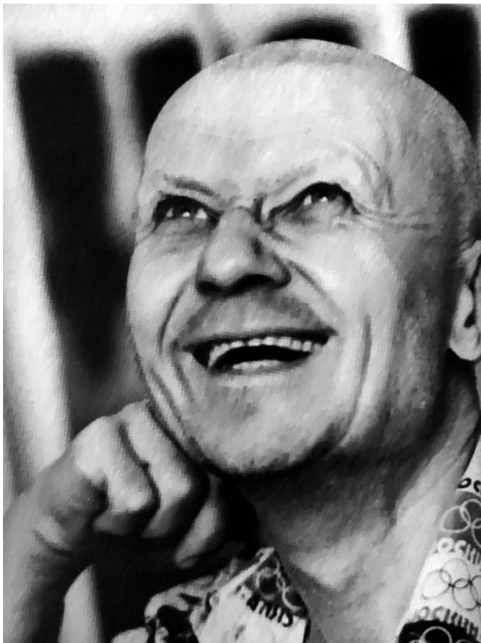
● Андрей Чикатило