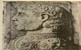
1. Césaire de Honenr.