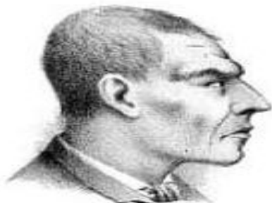
Fig. 5. — G., ladro napoletano.