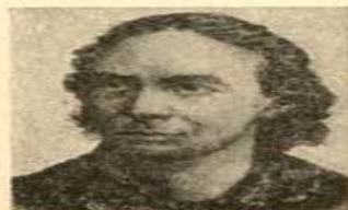
6. Louis Michel.