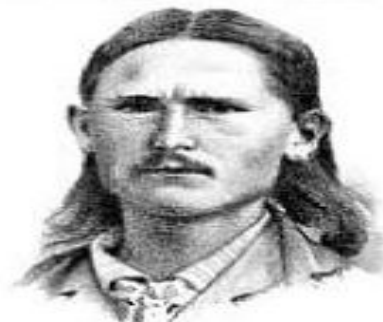
Fig. 6. — GARDONE, capo brigante.