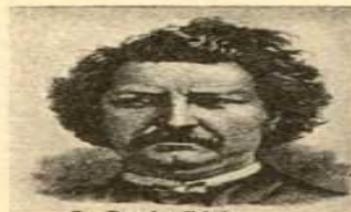
3. Louis Riel.