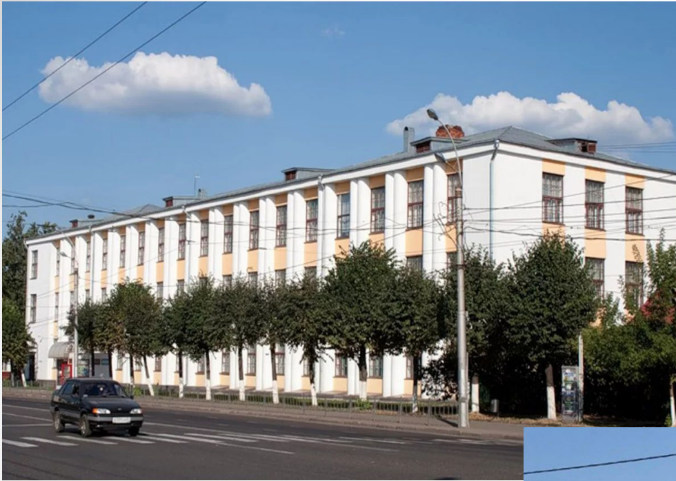
Classroom Building «A»