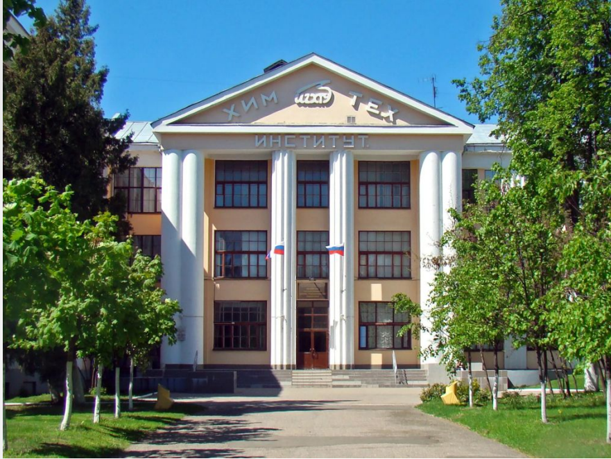
Main building «G»