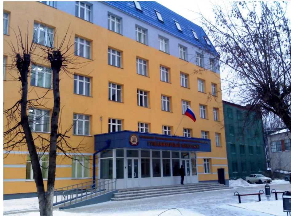
Humanities building «K»