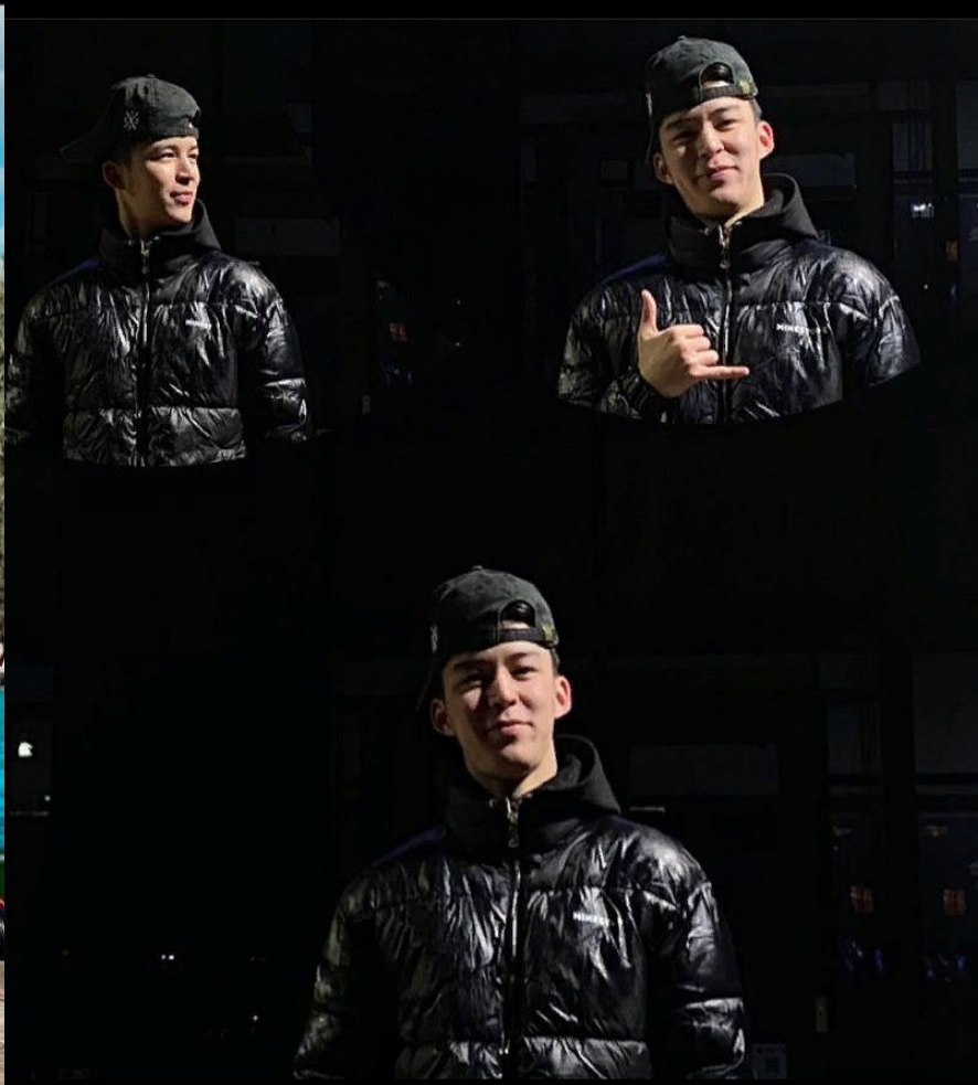
Нравится madinka_namaz и ещё 5 wine_tasting__ DJ TOPER 🔥 @svmvtoff 2 часов назад · Показать перевод