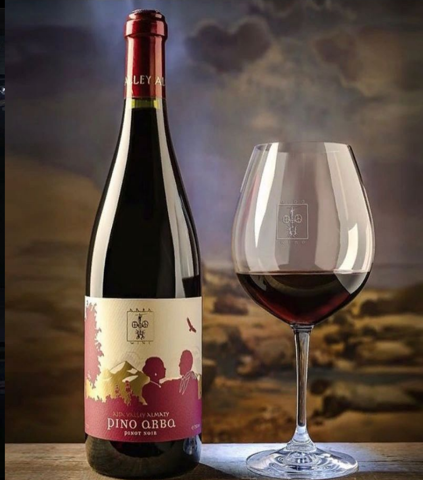
Нравится madinka_namaz и ещё 5 wine_tasting__ ARBA WINE 🍷 2 часов назад