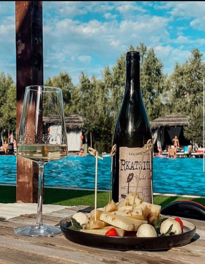
Нравится madinka_namaz и ещё 5 wine_tasting__ 🍷 2 часов назад