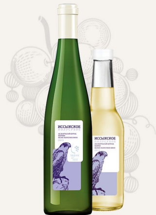
Issyk semi - dry