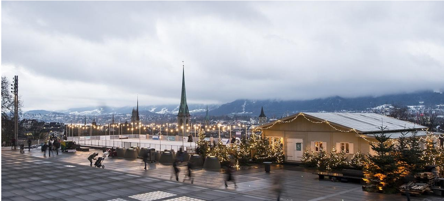
The observation deck of the University