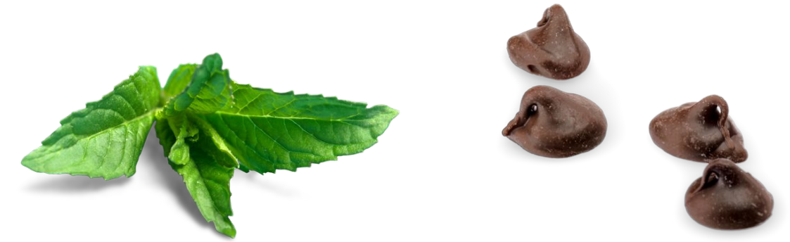
mint + chocolate chip