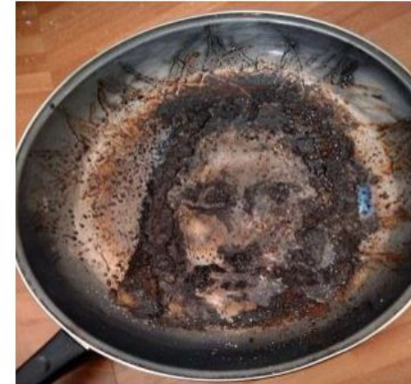
He washes his face in a frying-pan.