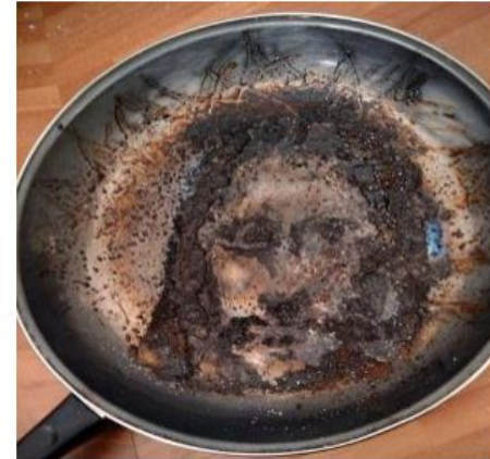
He washes his face in a frying-pan.