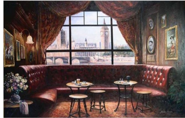
He works in a cafe in London.