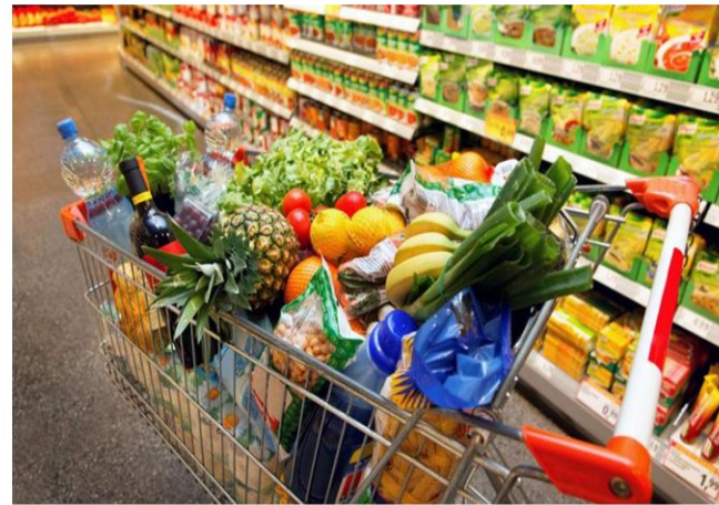
He goes to the market.