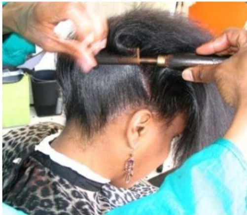
He combs his hair with the leg of a chair: