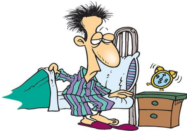
He gets up at six o'clock every morning.