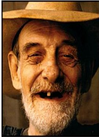
Desperate Dan's a funny old man.