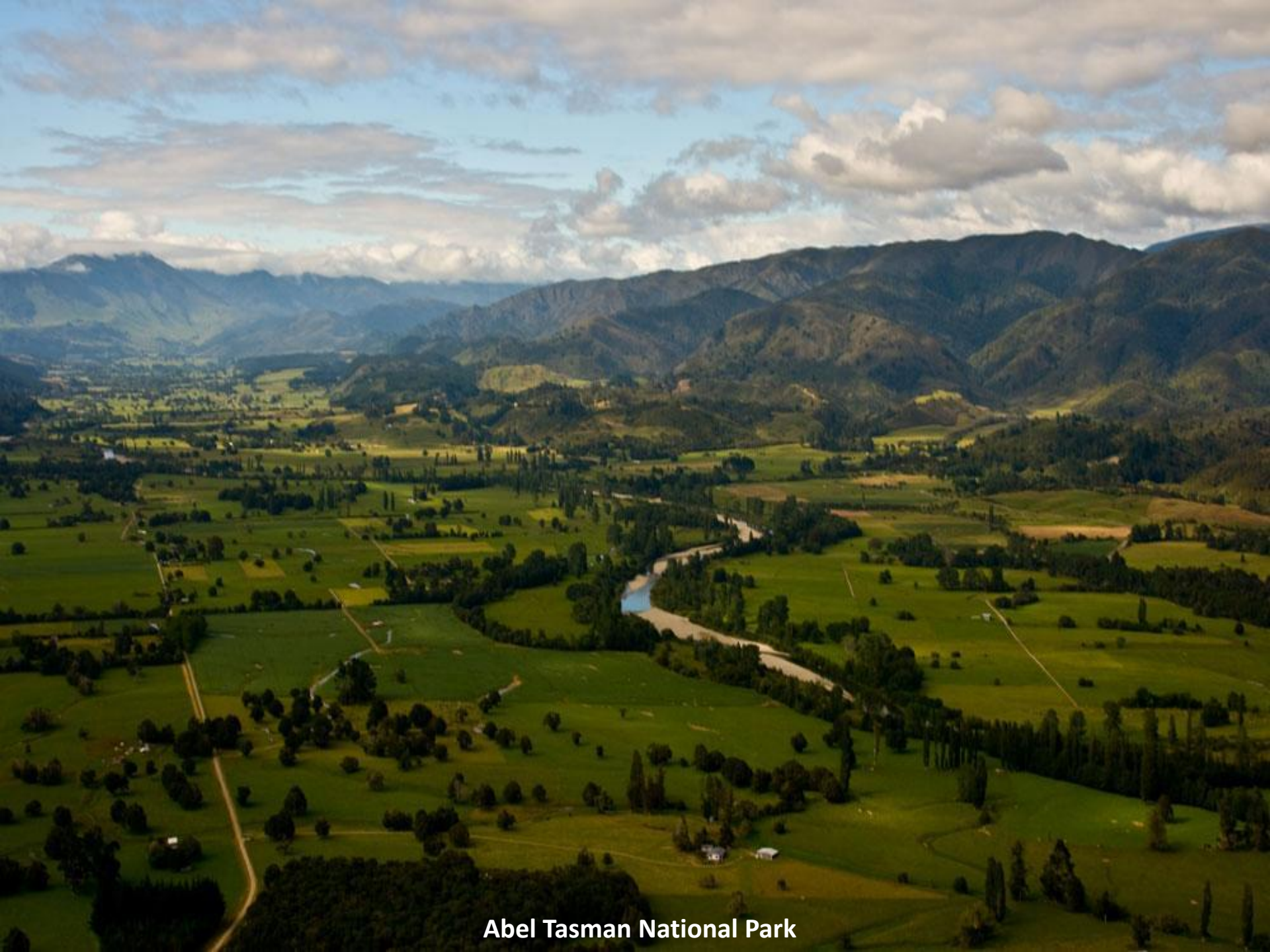
Abel Tasman National Park