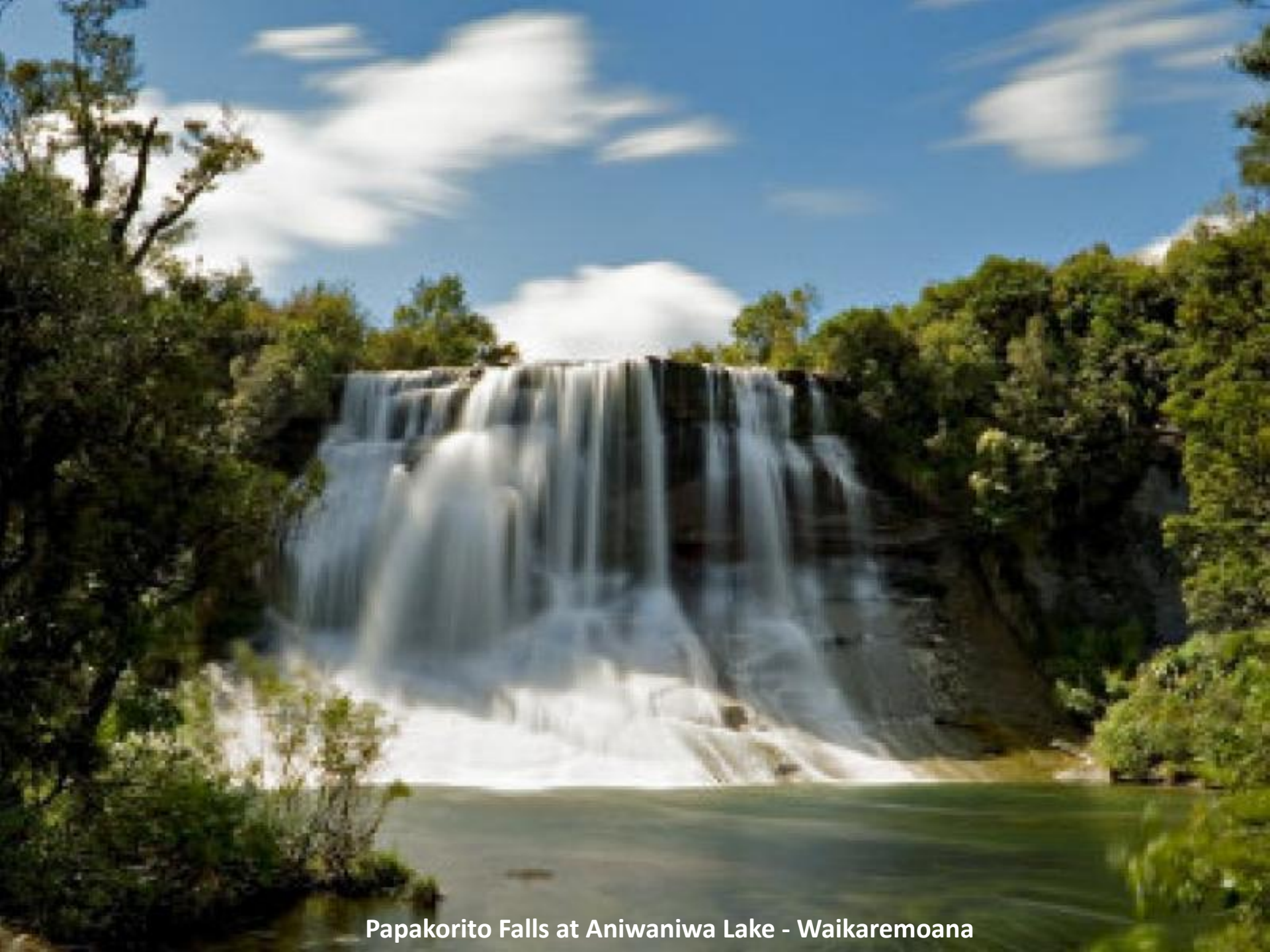
Papakorito Falls at Aniwaniwa Lake - Waikaremoana