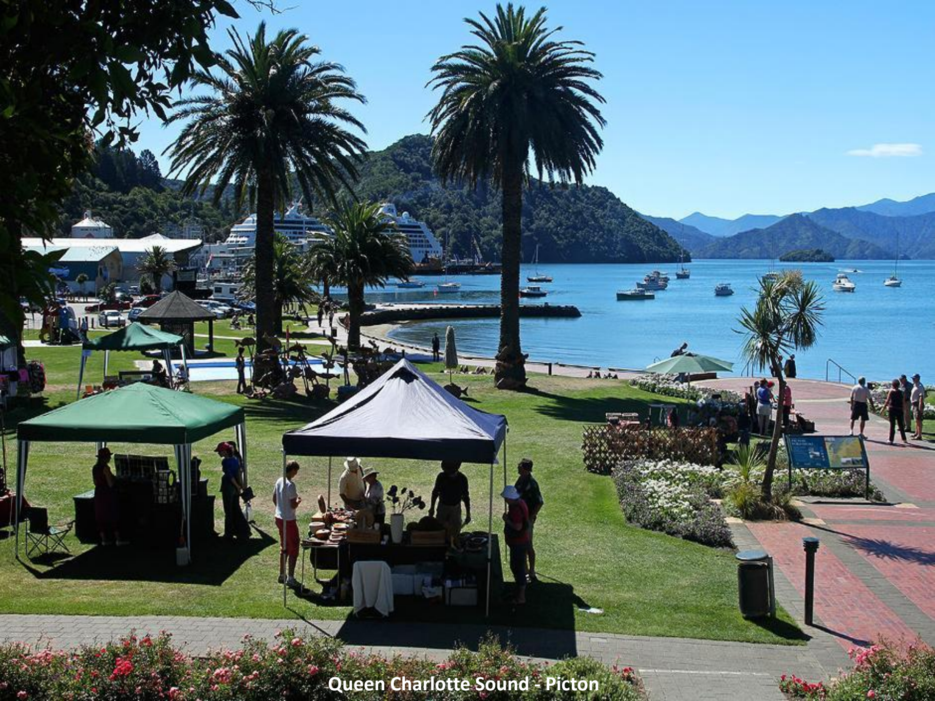
Queen Charlotte Sound - Picton