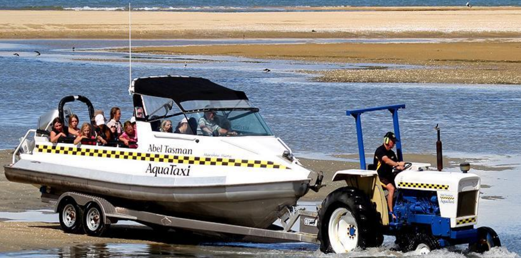
Marahau - Aqua Taxi