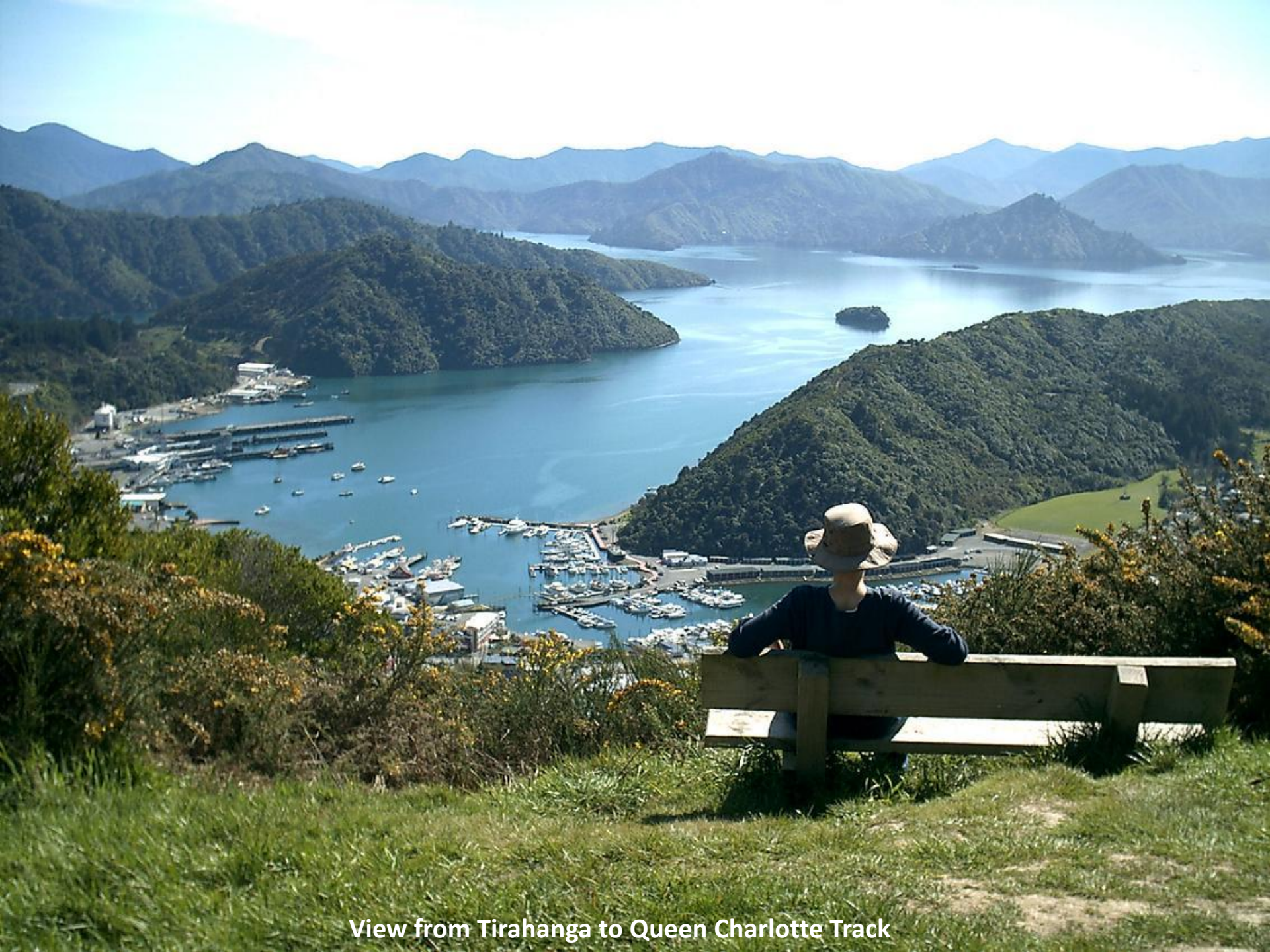
View from Tirahanga to Queen Charlotte Track