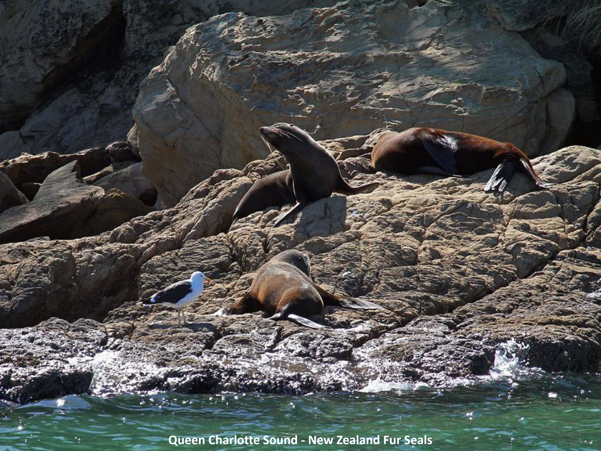
Queen Charlotte Sound - New Zealand Fur Seals