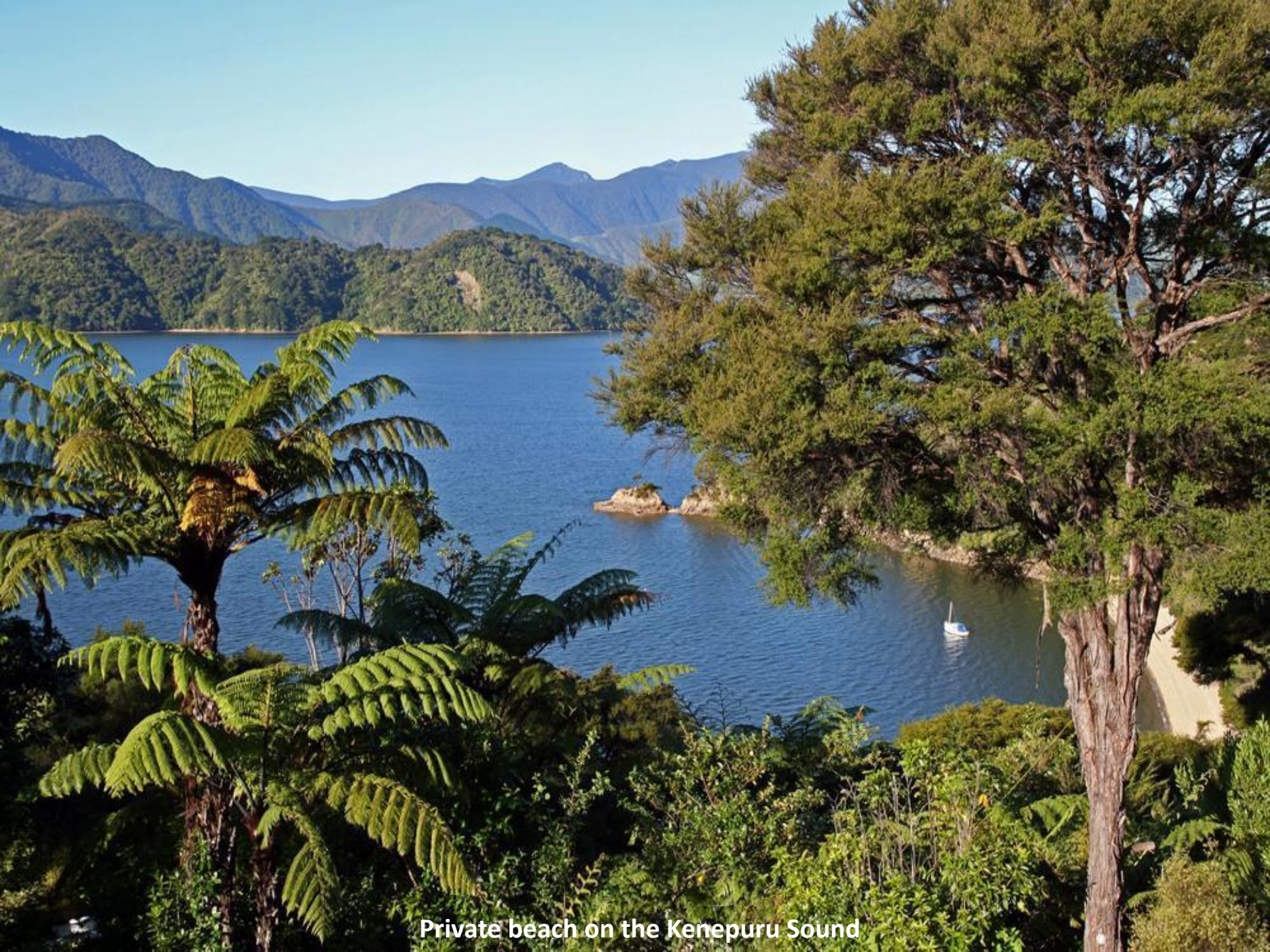
Private beach on the Kenepuru Sound