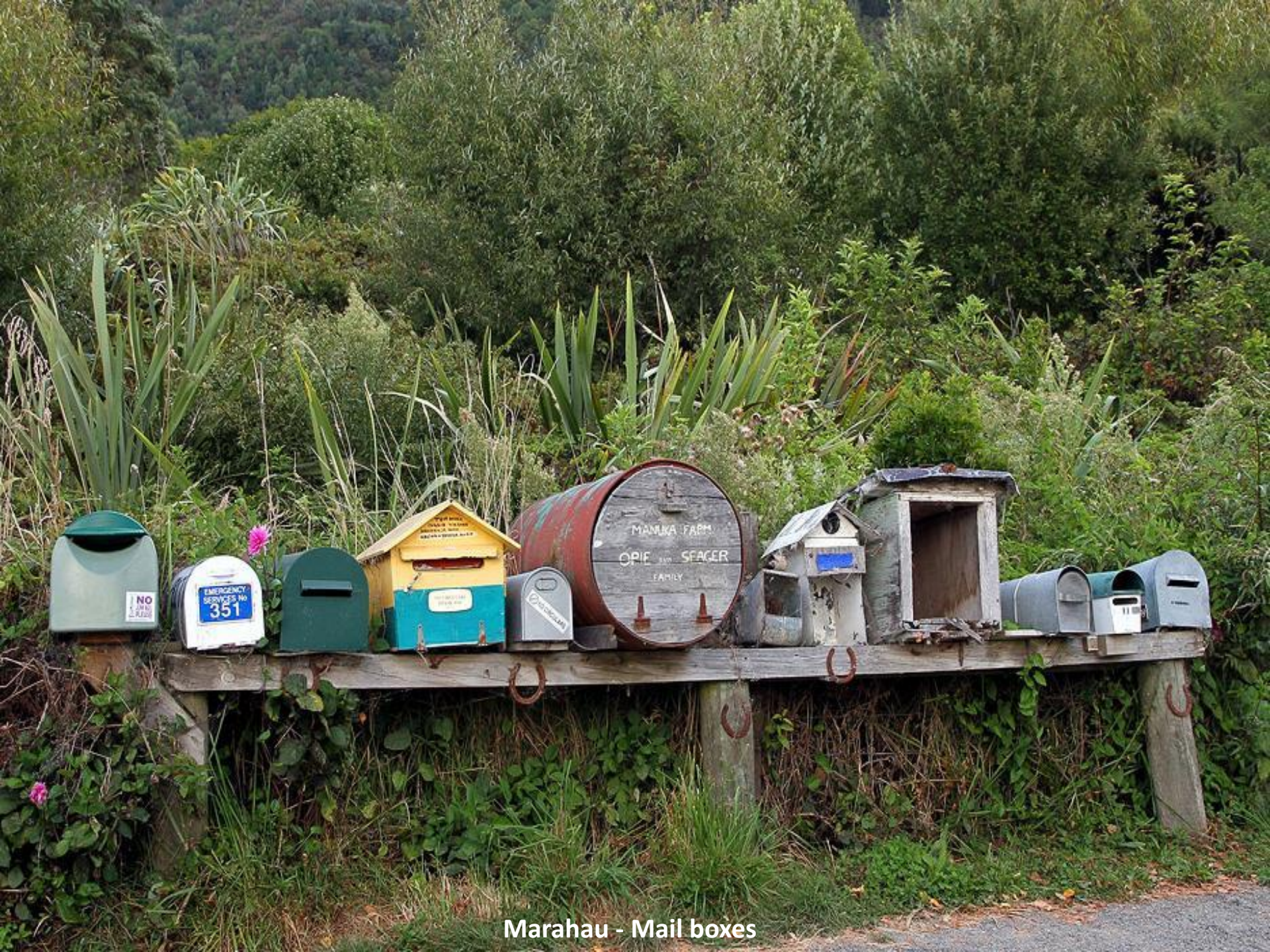
Marahau - Mail boxes