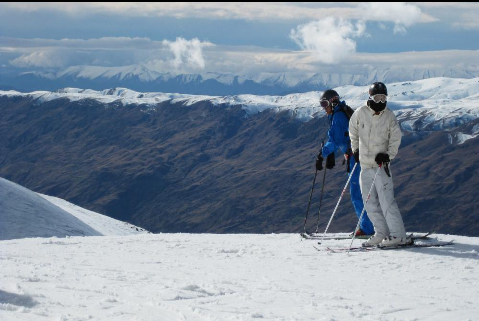
Cardrona is the name of a locality, skifield and beer in New Zealand.