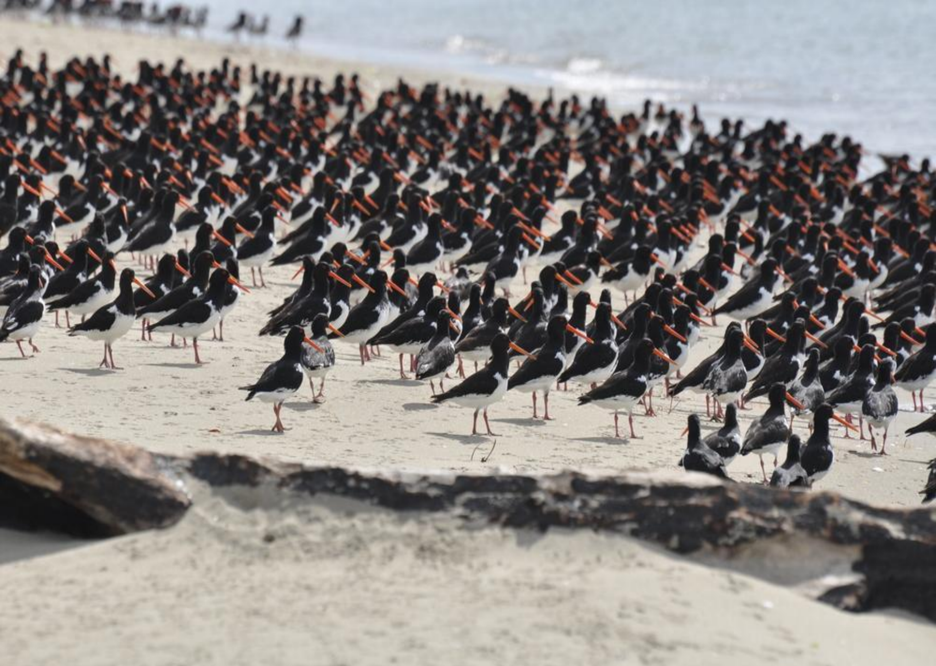
Golden Bay - Wharariki Beach