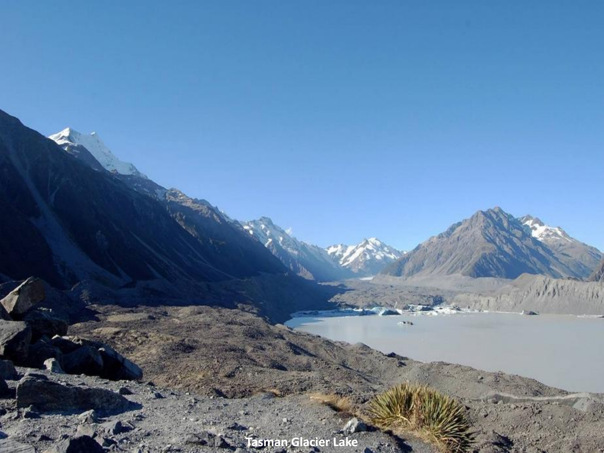
Tasman Glacier Lake