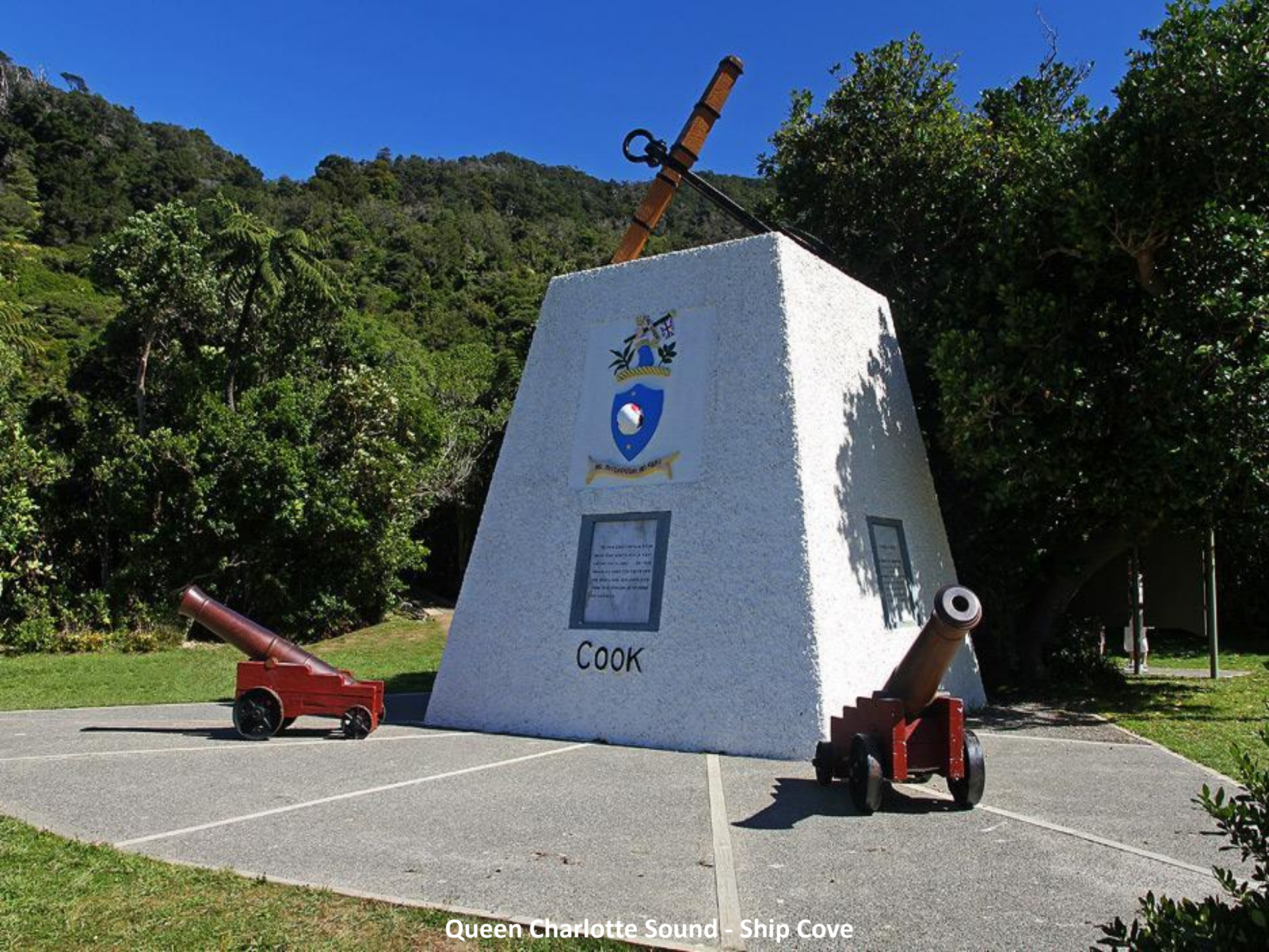
Queen Charlotte Sound - Ship Cove