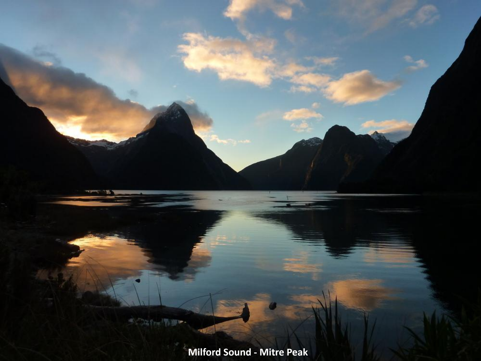
Milford Sound - Mitre Peak