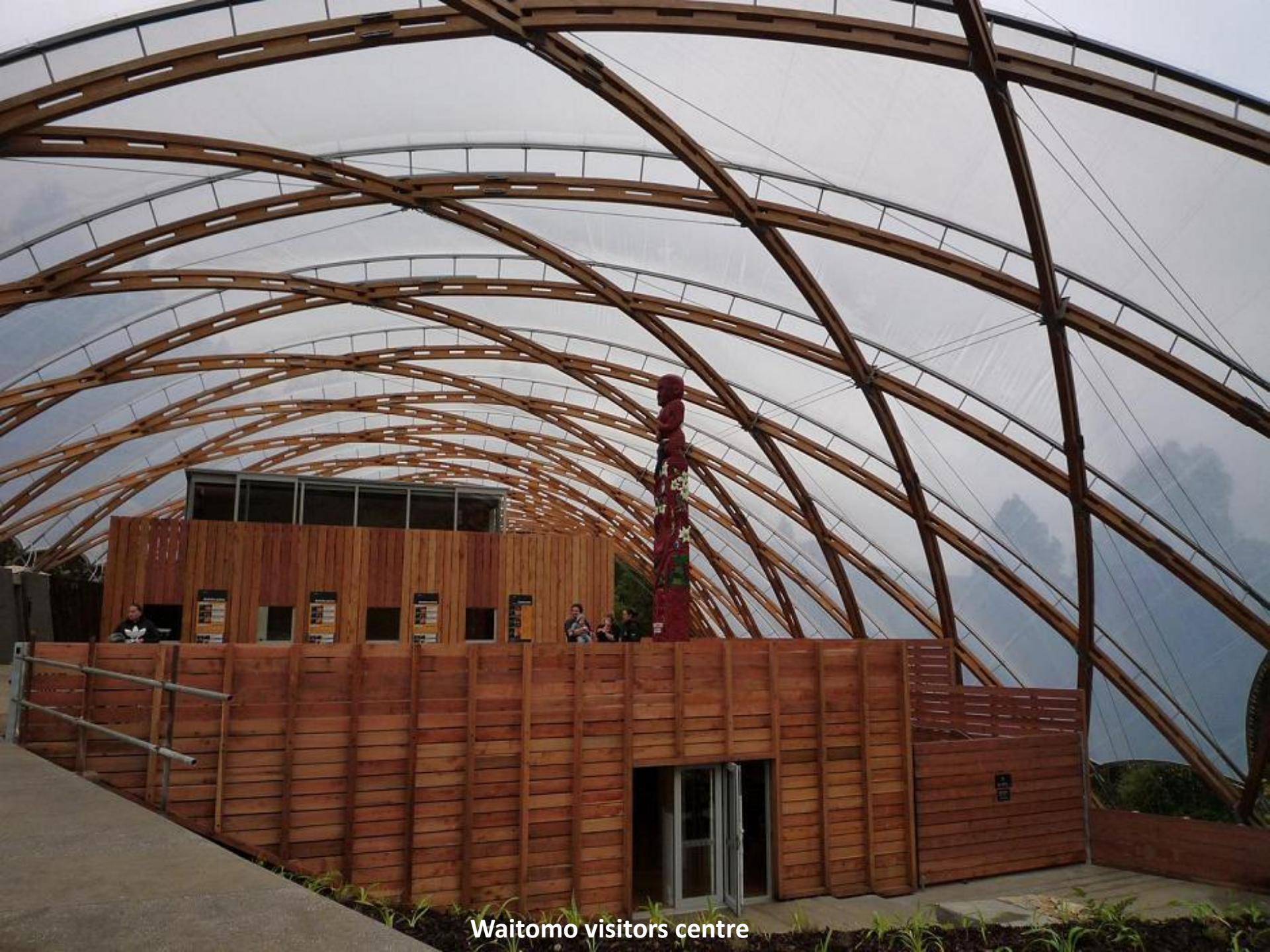
Waitomo visitors centre