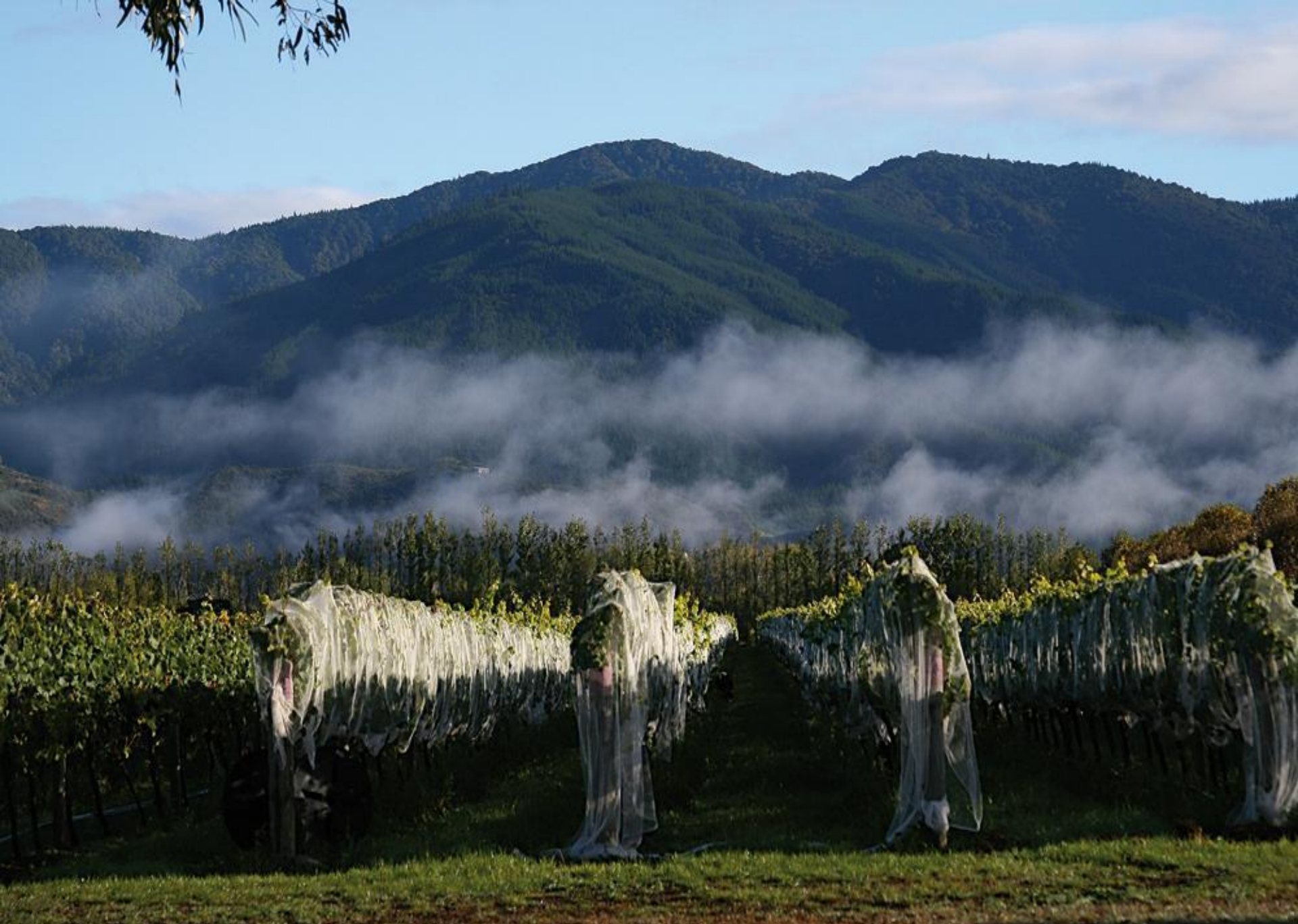
Wairau River wines