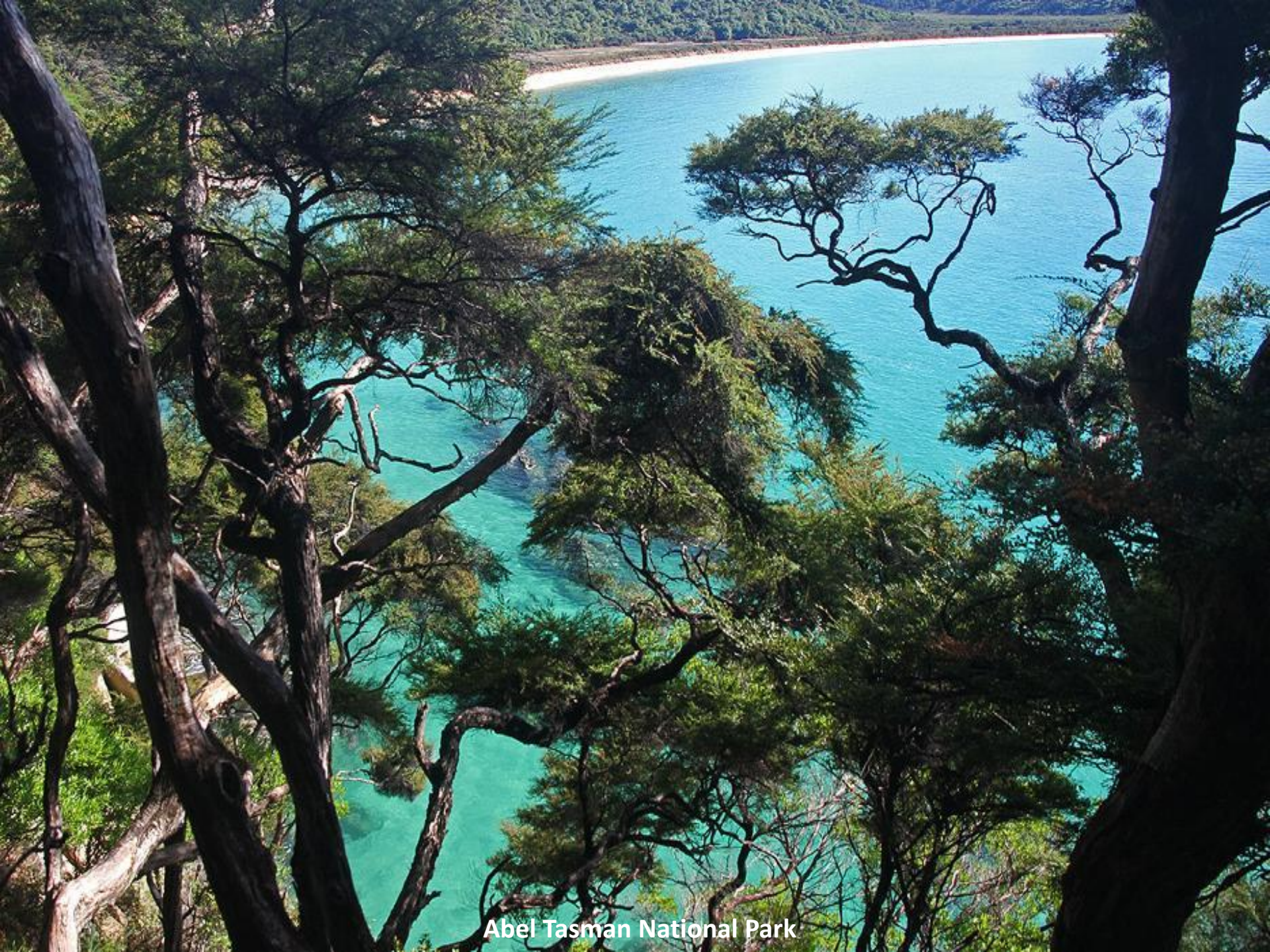
Abel Tasman National Park