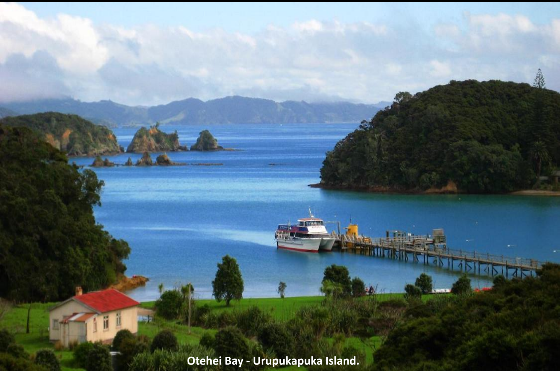
Otehei Bay - Urupukapuka Island.