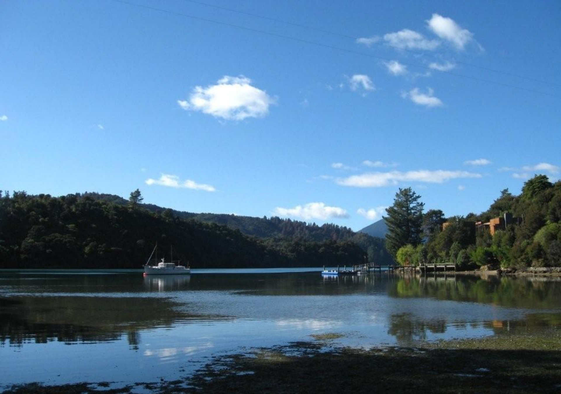
Queen Charlotte Track