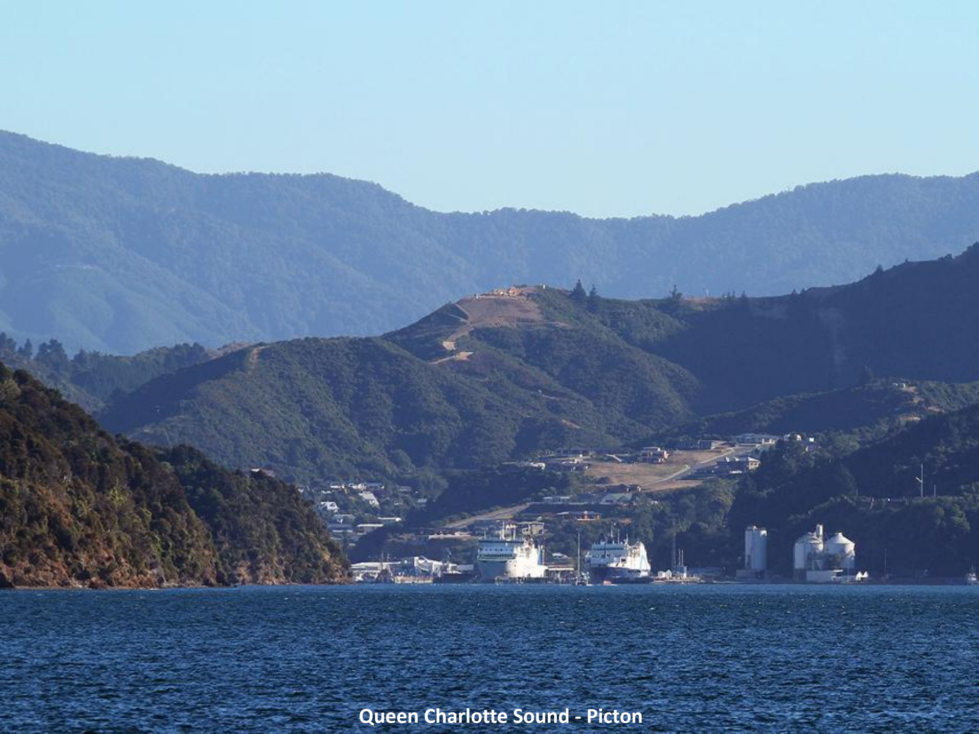
Queen Charlotte Sound - Picton