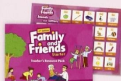
Teacher's Resource Pack with Phonics Poster, Phonics Cards and Flashcards