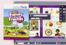
Oxford iTools Digital Classroom Resources