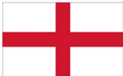
St. George's Cross (England)