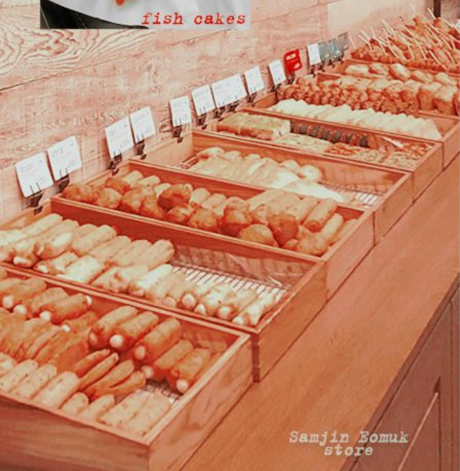
Samjin Eomuk store