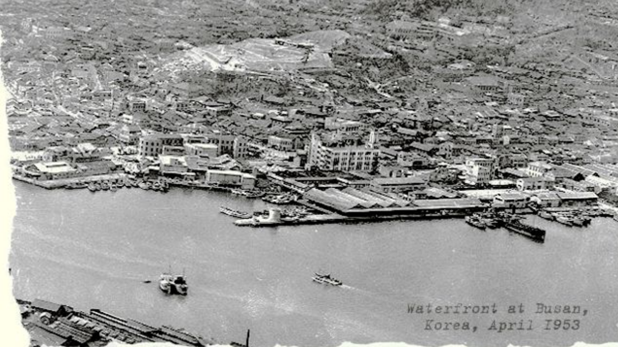
Waterfront at Busan, Korea, April 1953