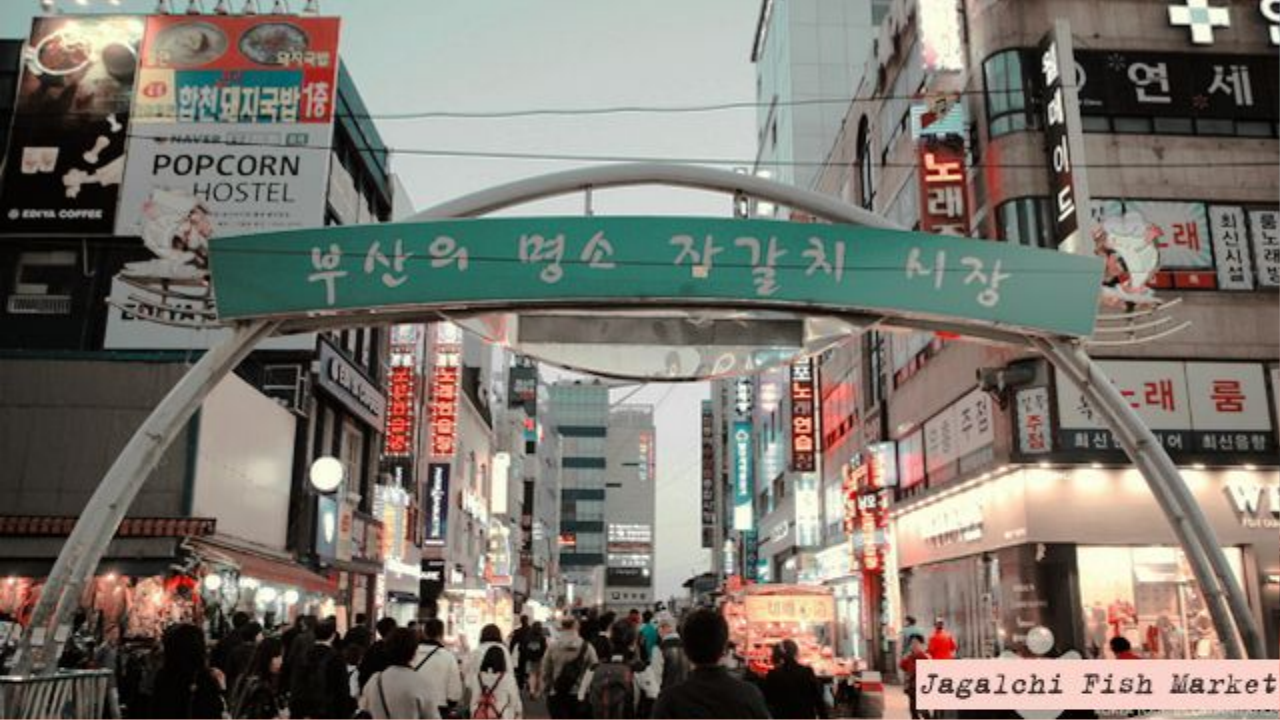
Jagalchi Fish Market