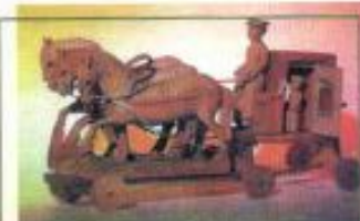
A beautiful wooden troika