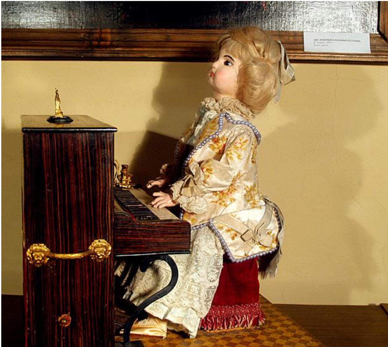
THE BEBE DOLL & PIANO BY LUTHER 1850-1860 L. 1000