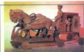
A beautiful wooden troika