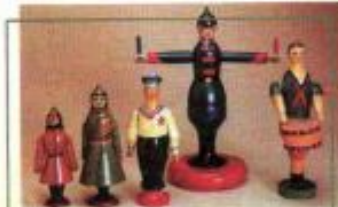
Painted Red Army soldiers

Sergiev Posad near Moscow is famous for its wooden toys. They still make toys there today, and they've got a great Toy Museum.