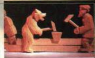
An original 'Trinity' toy