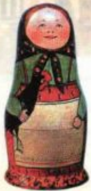
This is the very first Russian matryoshka, painted by Sergei Maliutin in 1898.