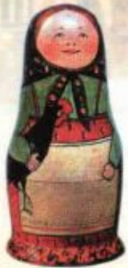
This is the very first Russian matryoshka, painted by Sergei Maliutin in 1898.