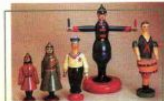
Painted Red Army soldiers

Sergiev Posad near Moscow is famous for its wooden toys. They still make toys there today, and they've got a great Toy Museum.