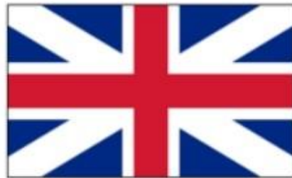
Original Union Flag (1606)