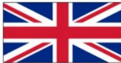
Current Union Flag (1801)