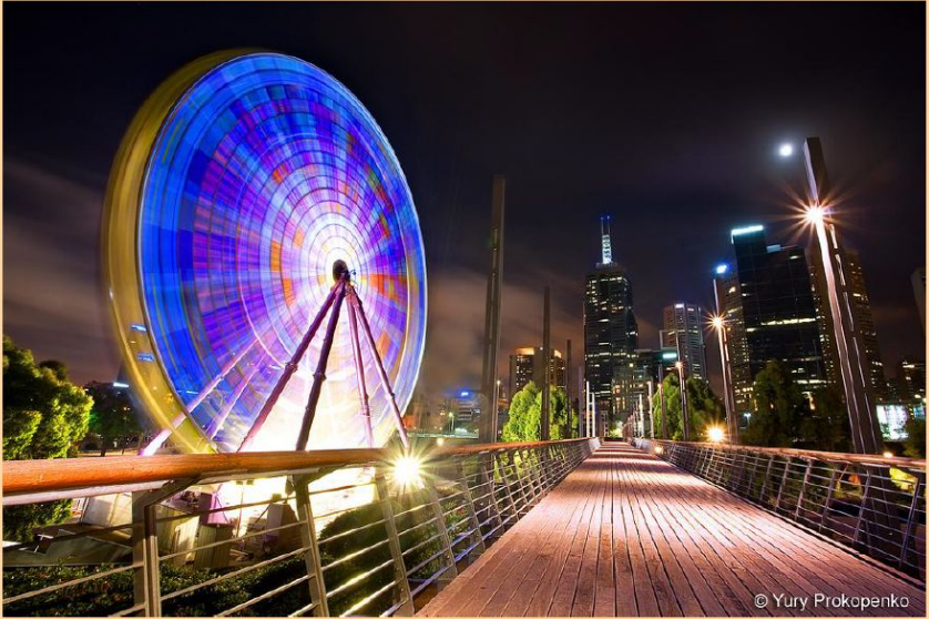
Giant Sky Wheel