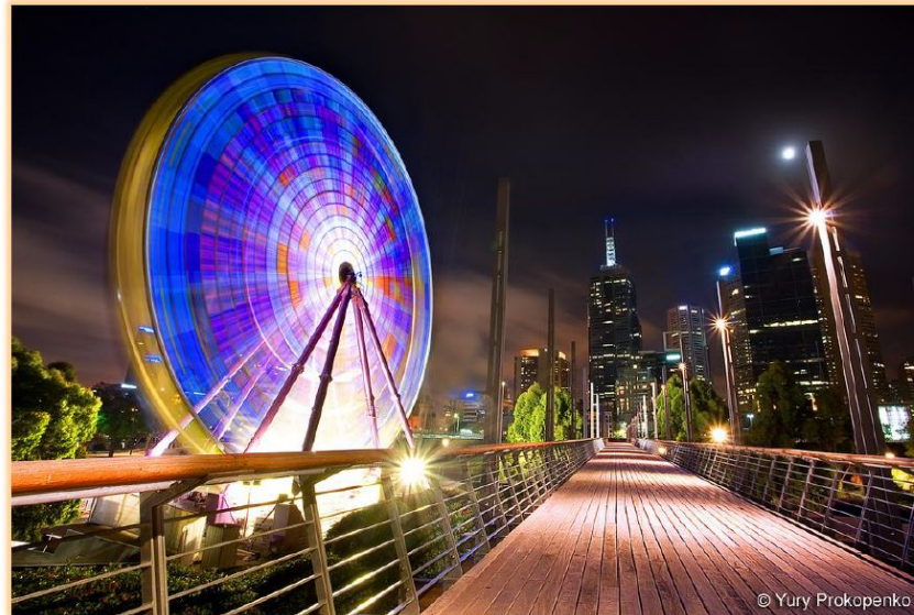
Giant Sky Wheel