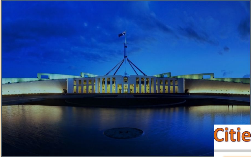
Parliament House Canberra