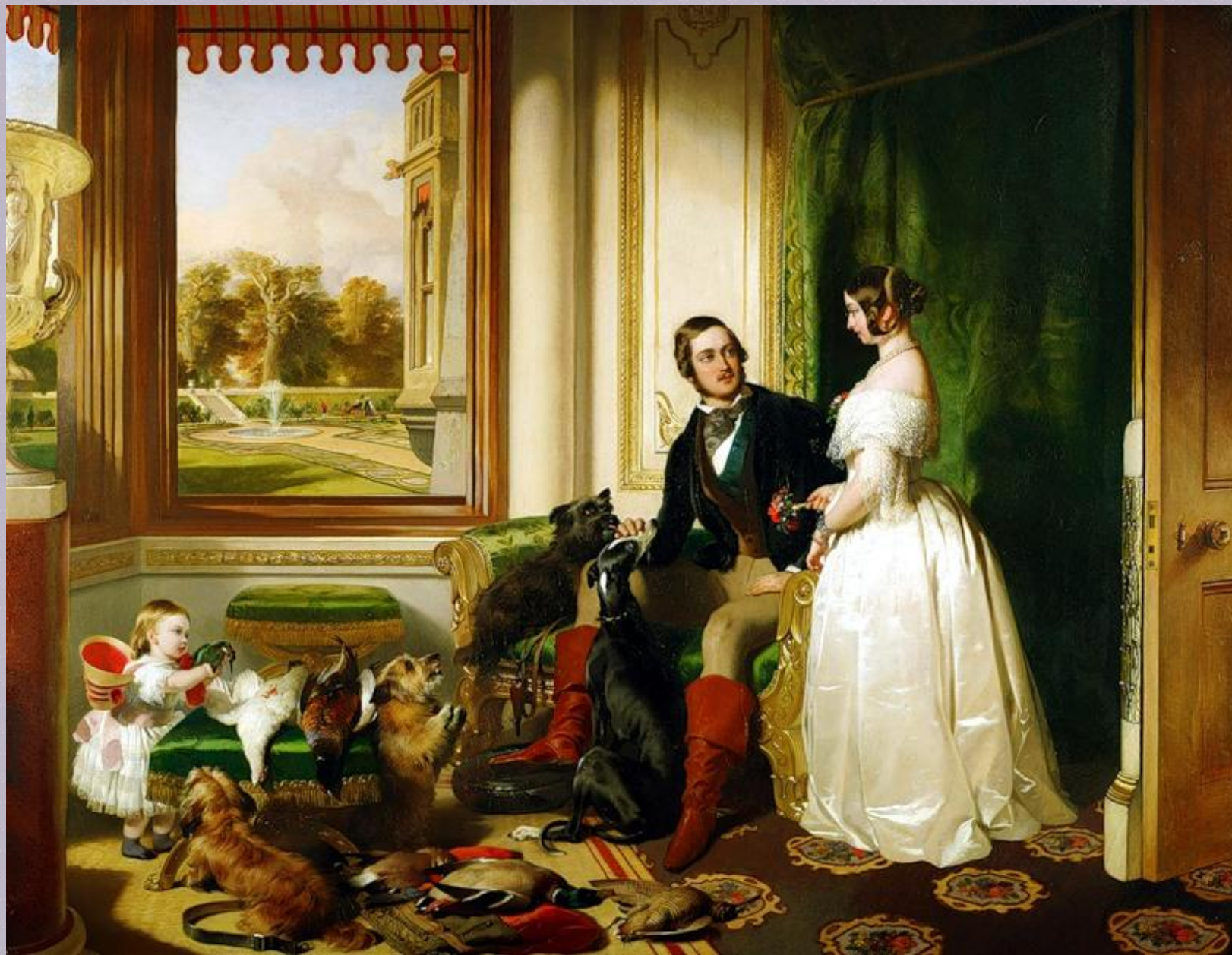
Edwin Landseer. Принц Альберт и королева Виктория, 1841-42