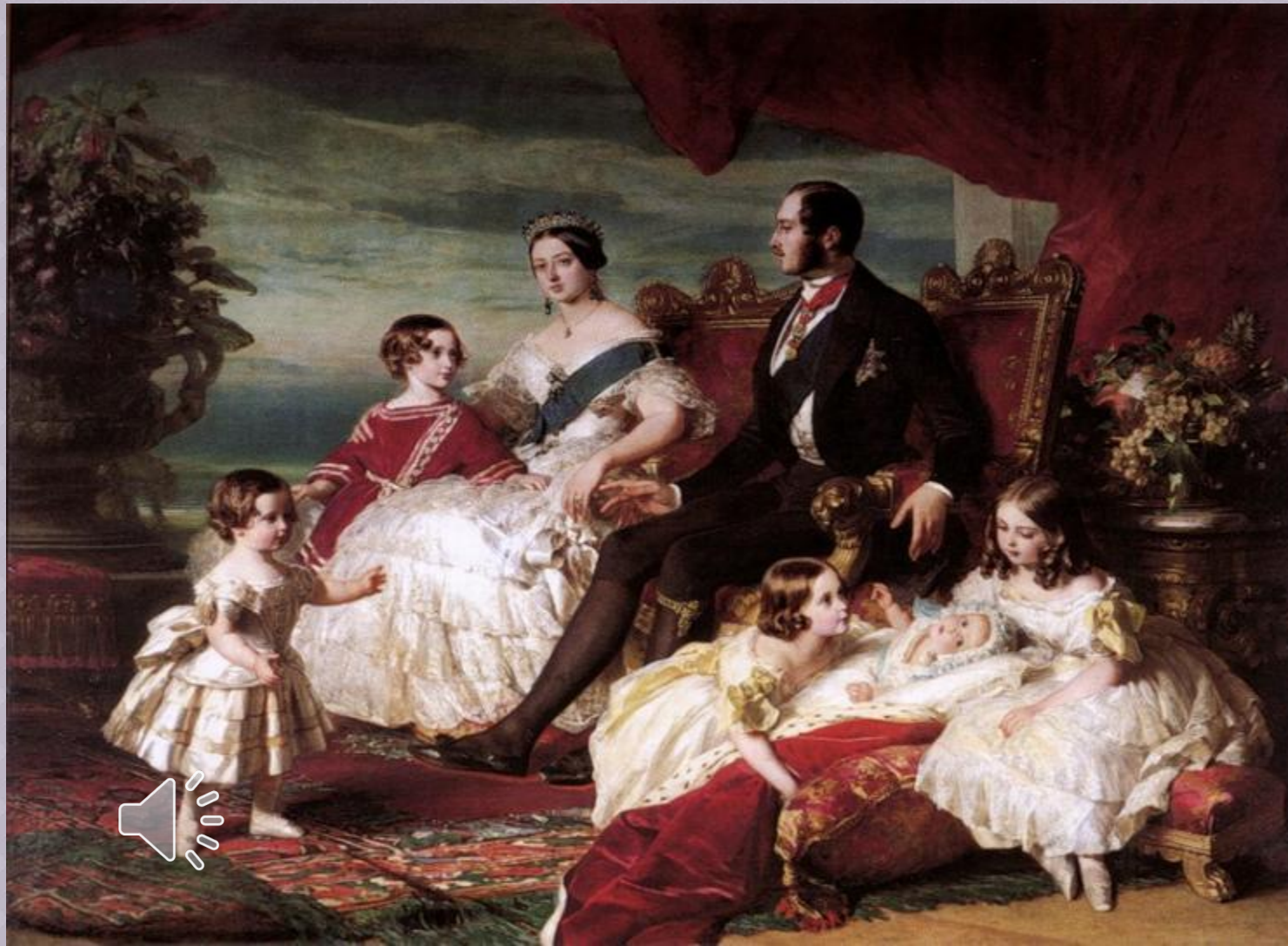
Франц Винтельхальтер. Королева Виктория, принц Альберт и их дети

Queen Victoria had nine children, 40 grand-children and 37 great-grandchildren. Most of her children married into other royal families of Europe and she became known as the 'Grandmother of Europe'.