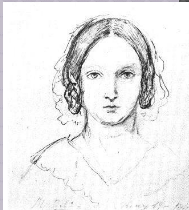
Автопортрет королевы Виктории, 1844