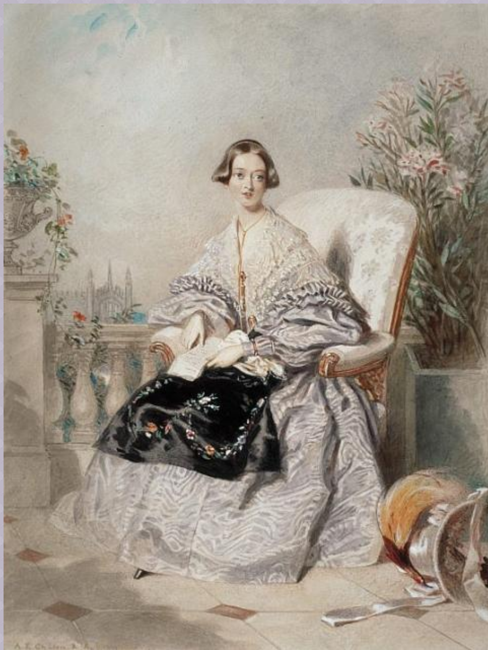
Alfred Edward Chalon. Портрет королевы Виктории, 1837-38