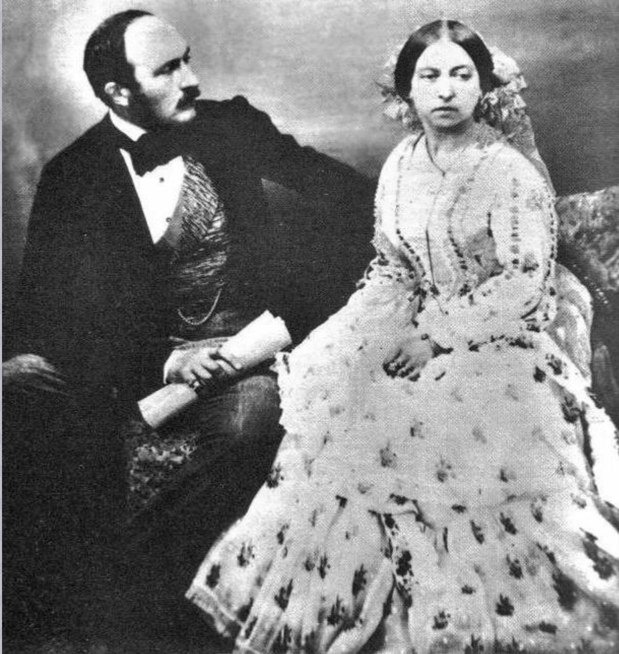
Принц Альберт и королева Виктория. Фотография