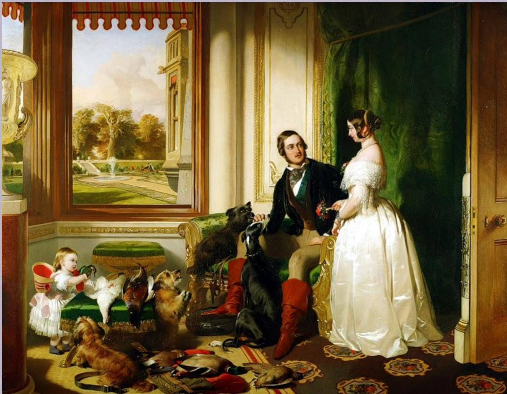
Edwin Landseer. Принц Альберт и королева Виктория, 1841-42