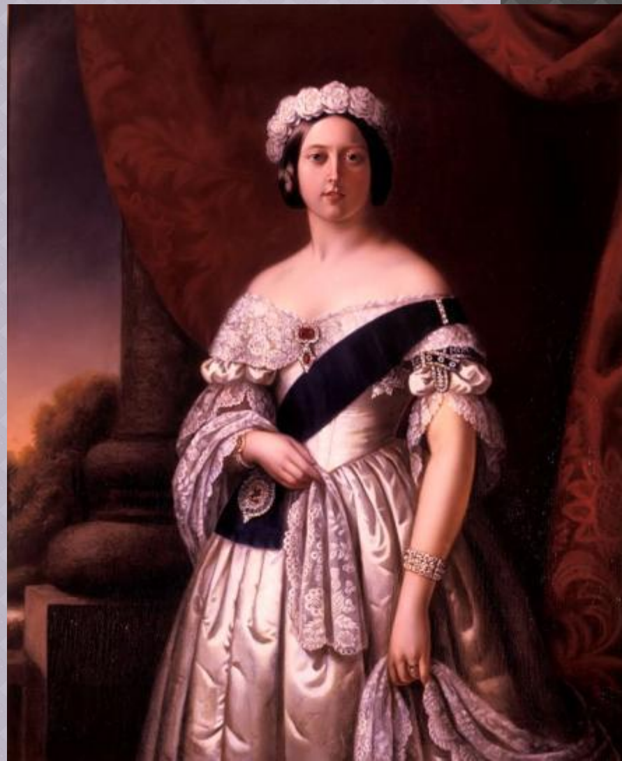
Alexander Melville. Портрет королевы Виктории, 1845