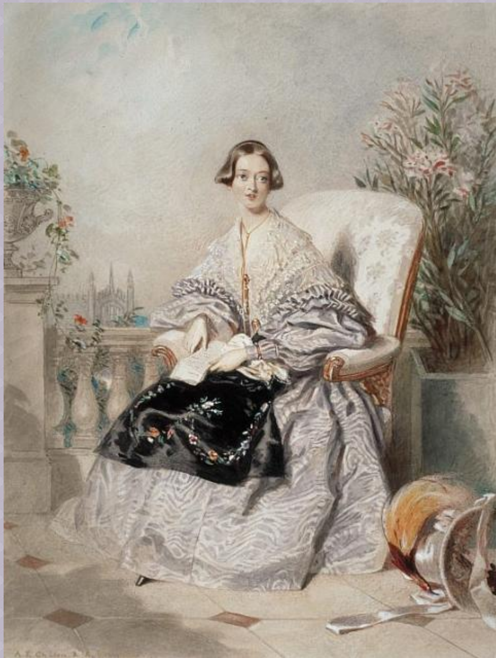
Alfred Edward Chalon. Портрет королевы Виктории, 1837-38