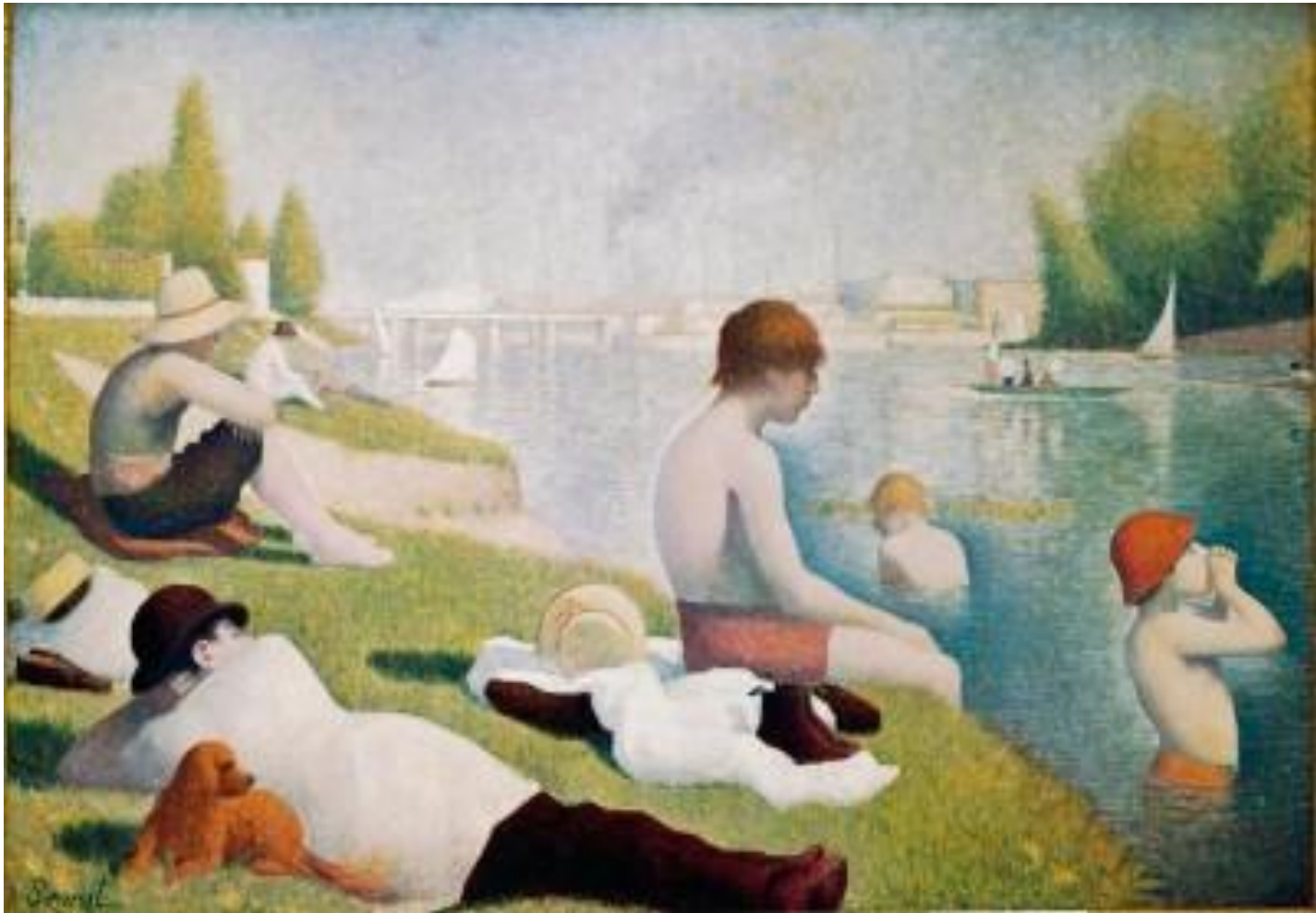
Bathers at Asnières Georges Seurat 1884