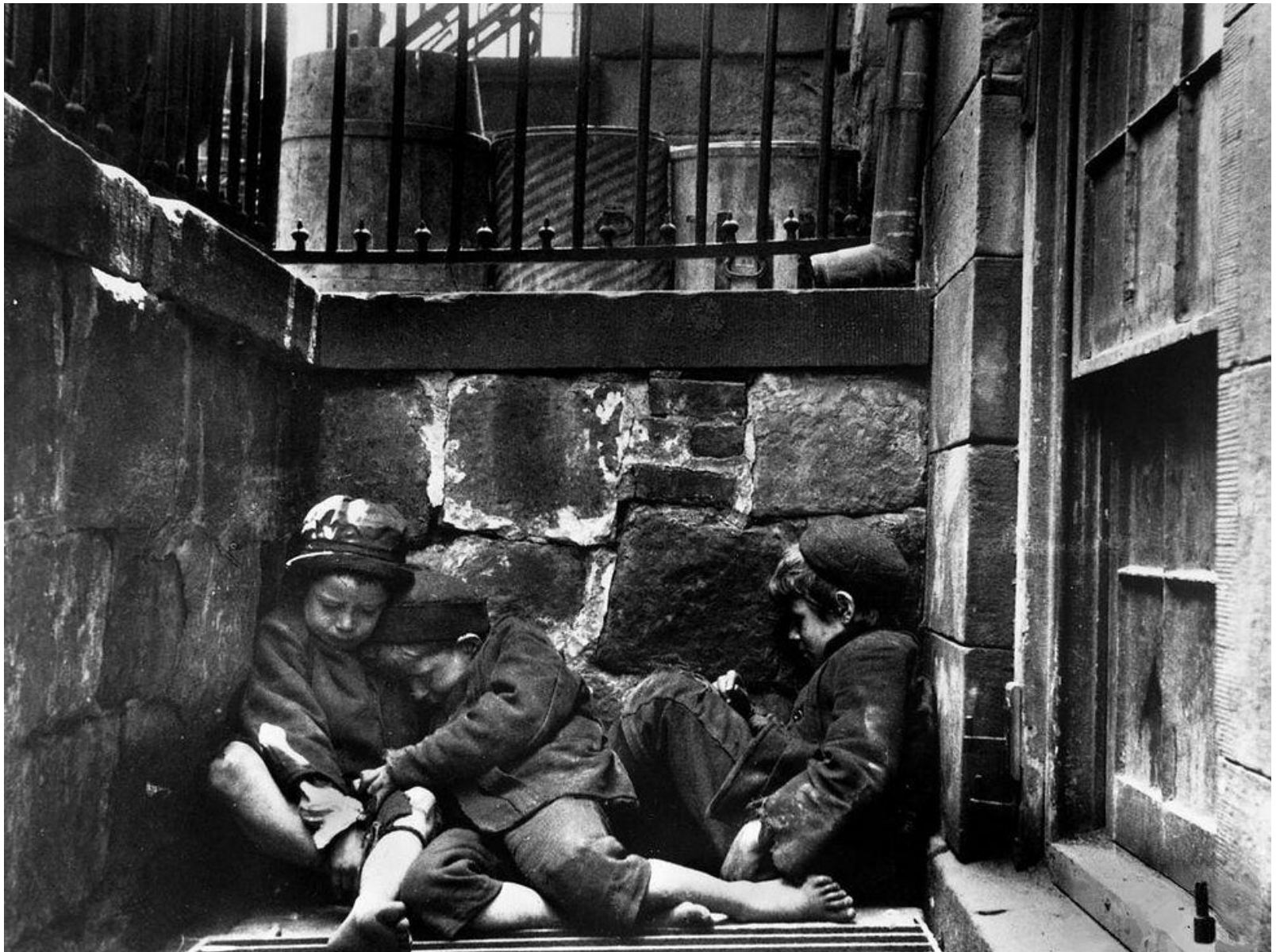
Children sleeping in mulberry street