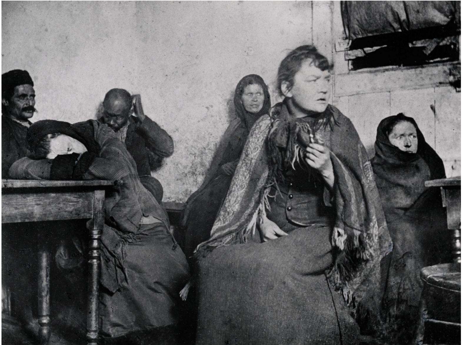
Hell on Earth