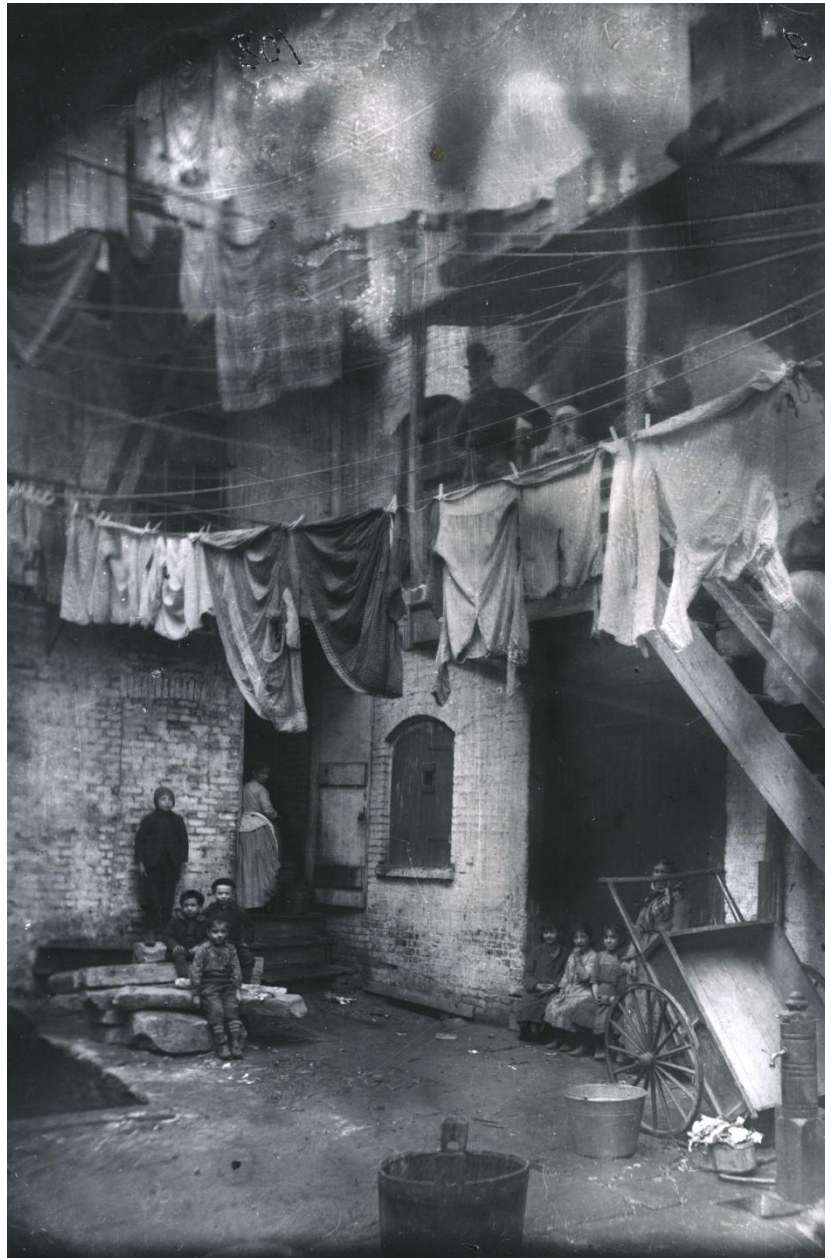
Tenement Yard, How the Other Half Lives