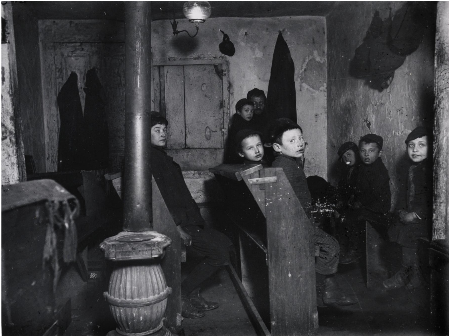
Talmud School in Hester Street.