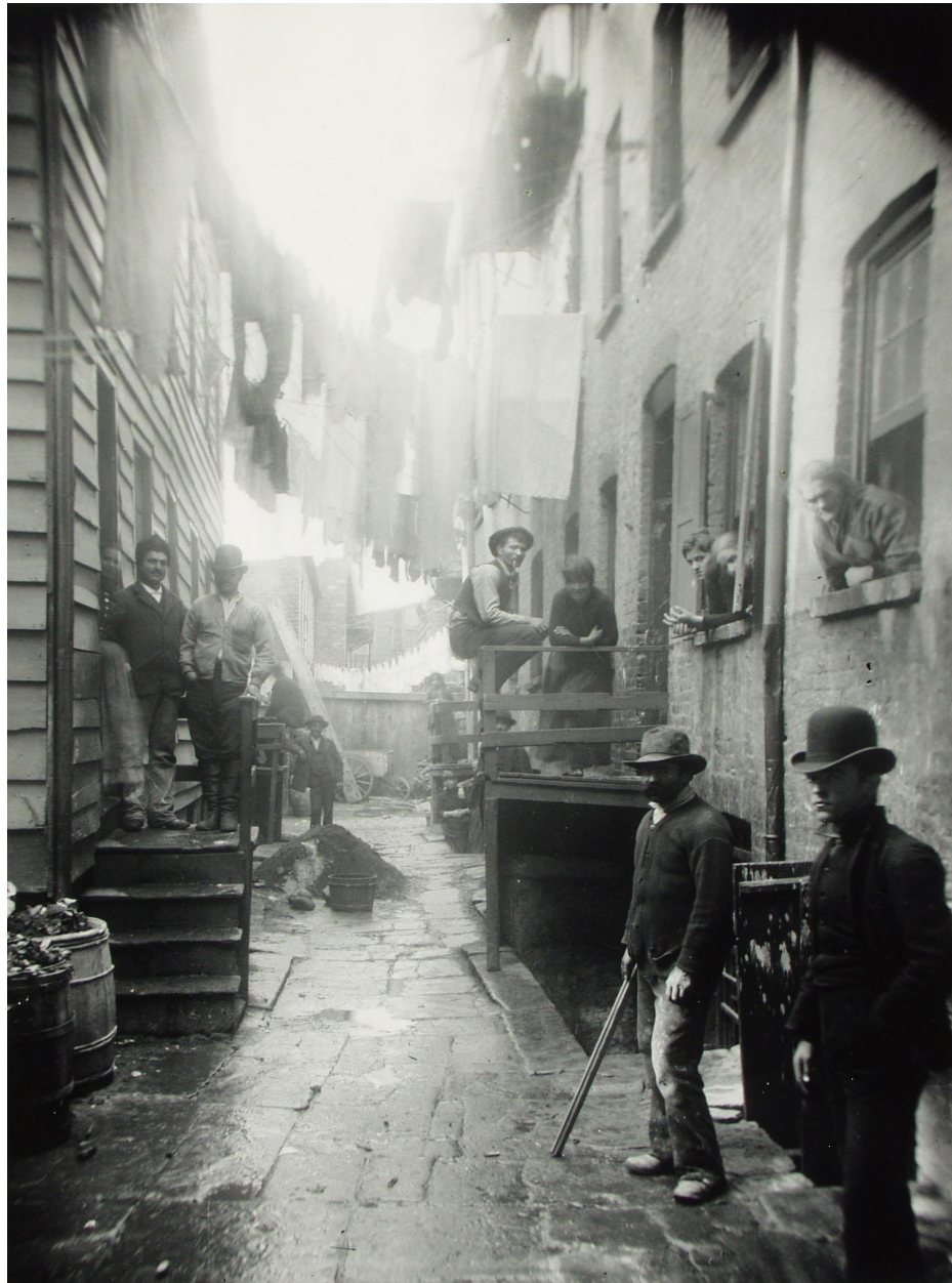
Bandit`s Roost, 59 1-2 Mullbery Street