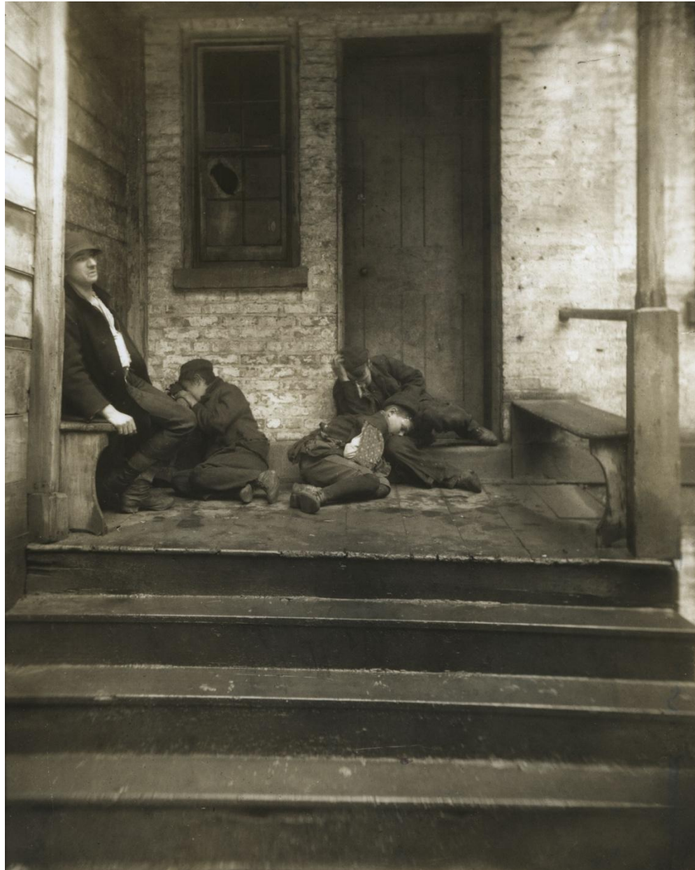
How the Other Half Lives