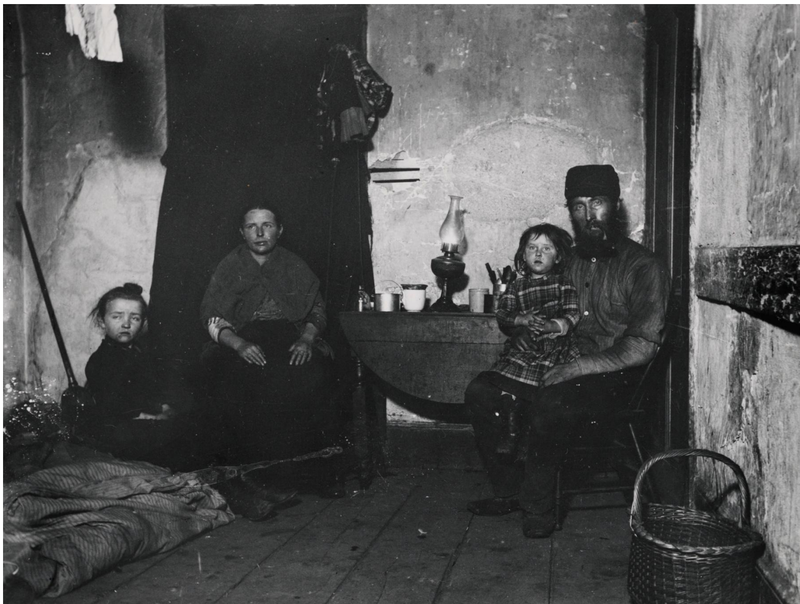
In Poverty Gap, an English Coal-Heaver's Home.