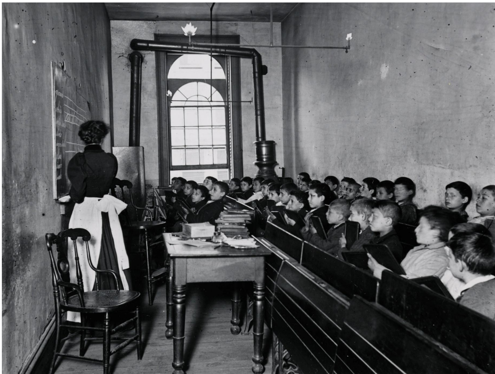
A Class in the Condemned Essex Market School, With the Gas Burning by Day