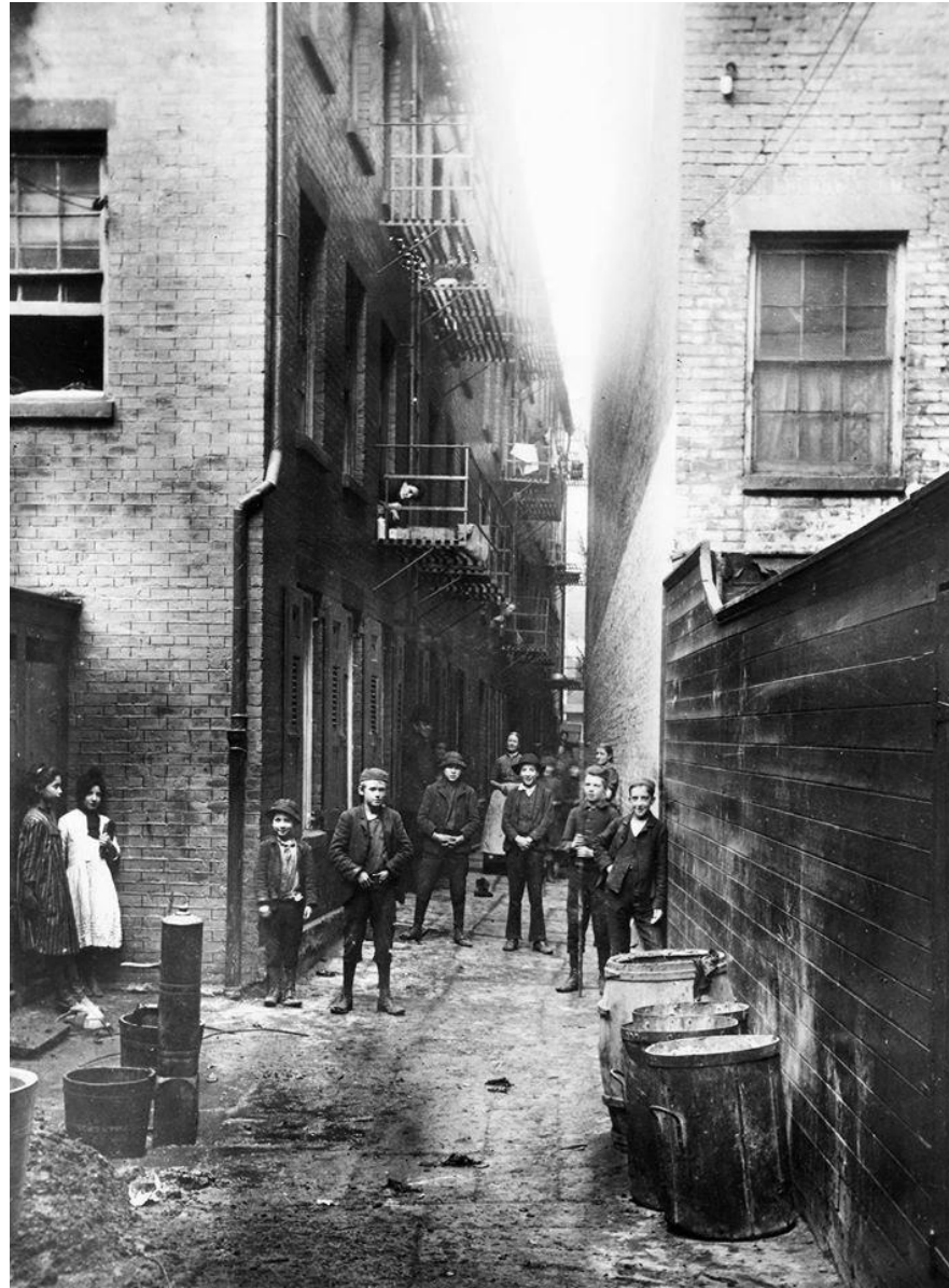
Mullen's Alley, Cherry Hill.