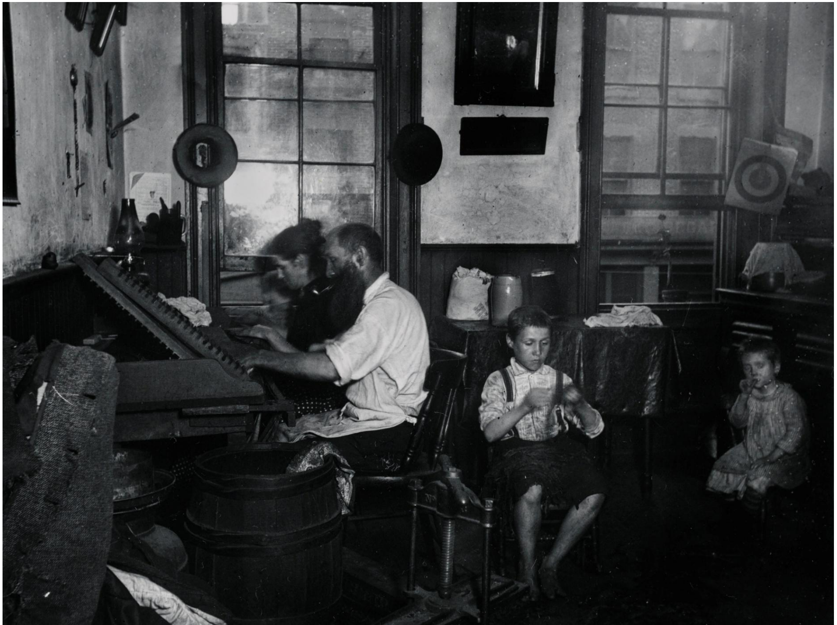
Bohemian Cigarmakers at work in their Tenement.