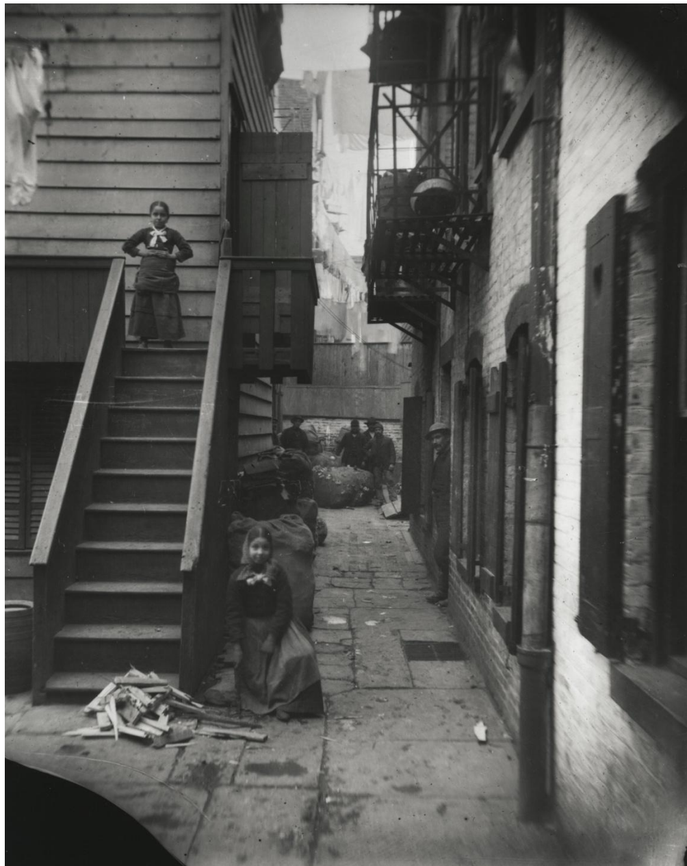
Baxter Street in Mulberry Bend.