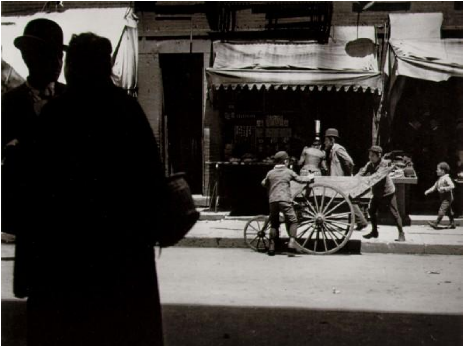
What the Boys Learn on Their Street Playground.