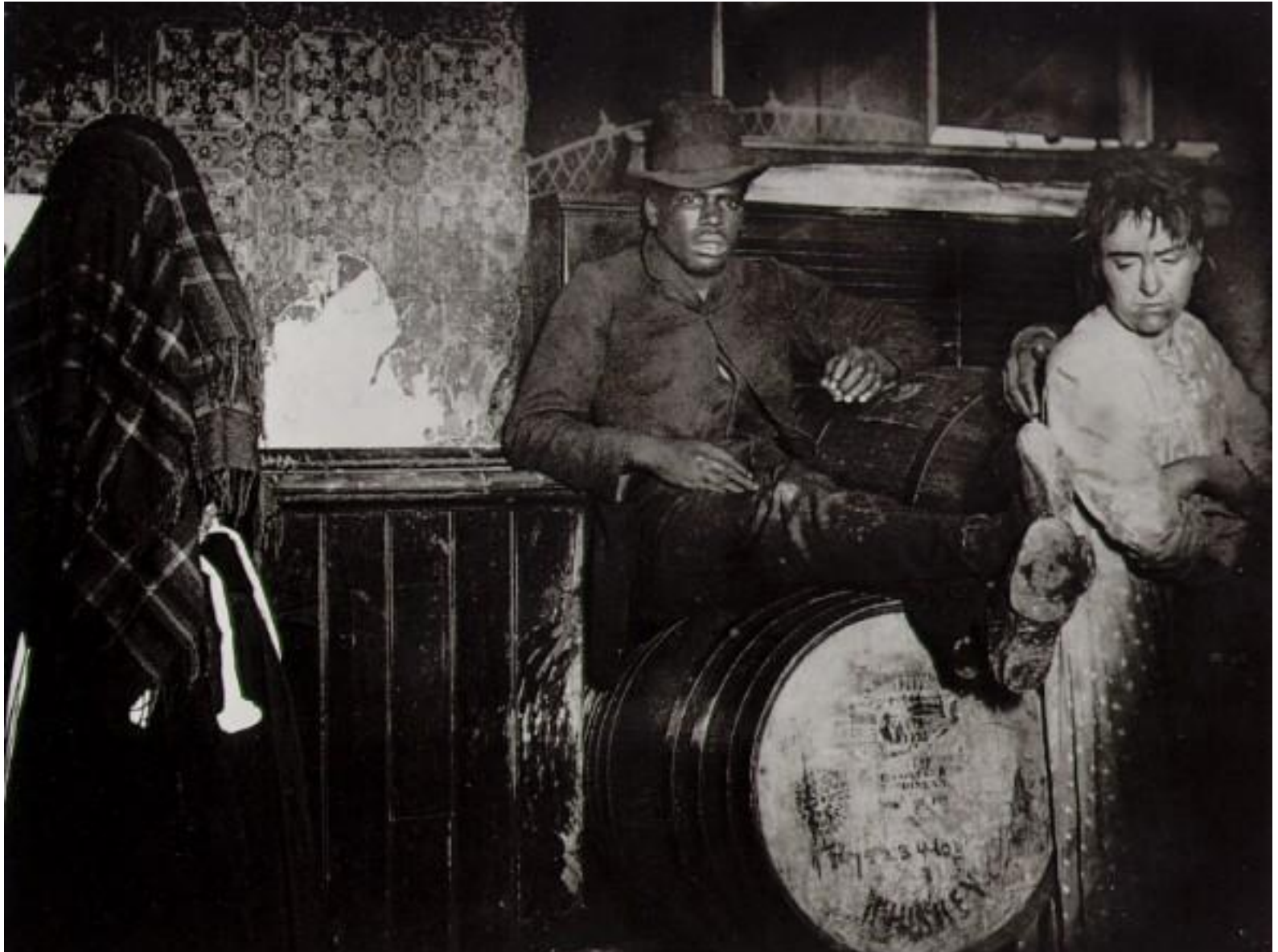
A Black-and-Tan Dive in Africa