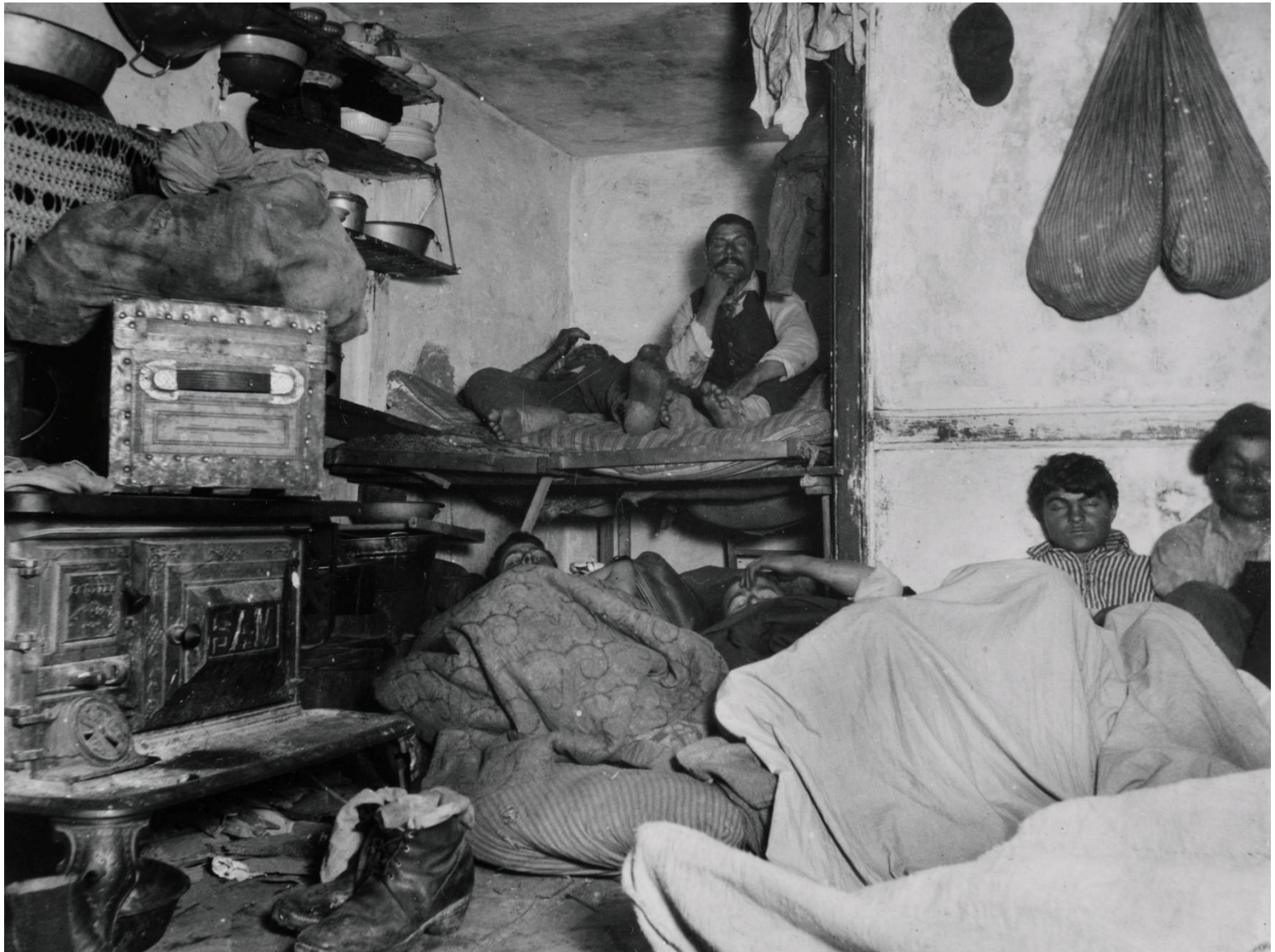
Five Cents Lodging, Bayard Street.