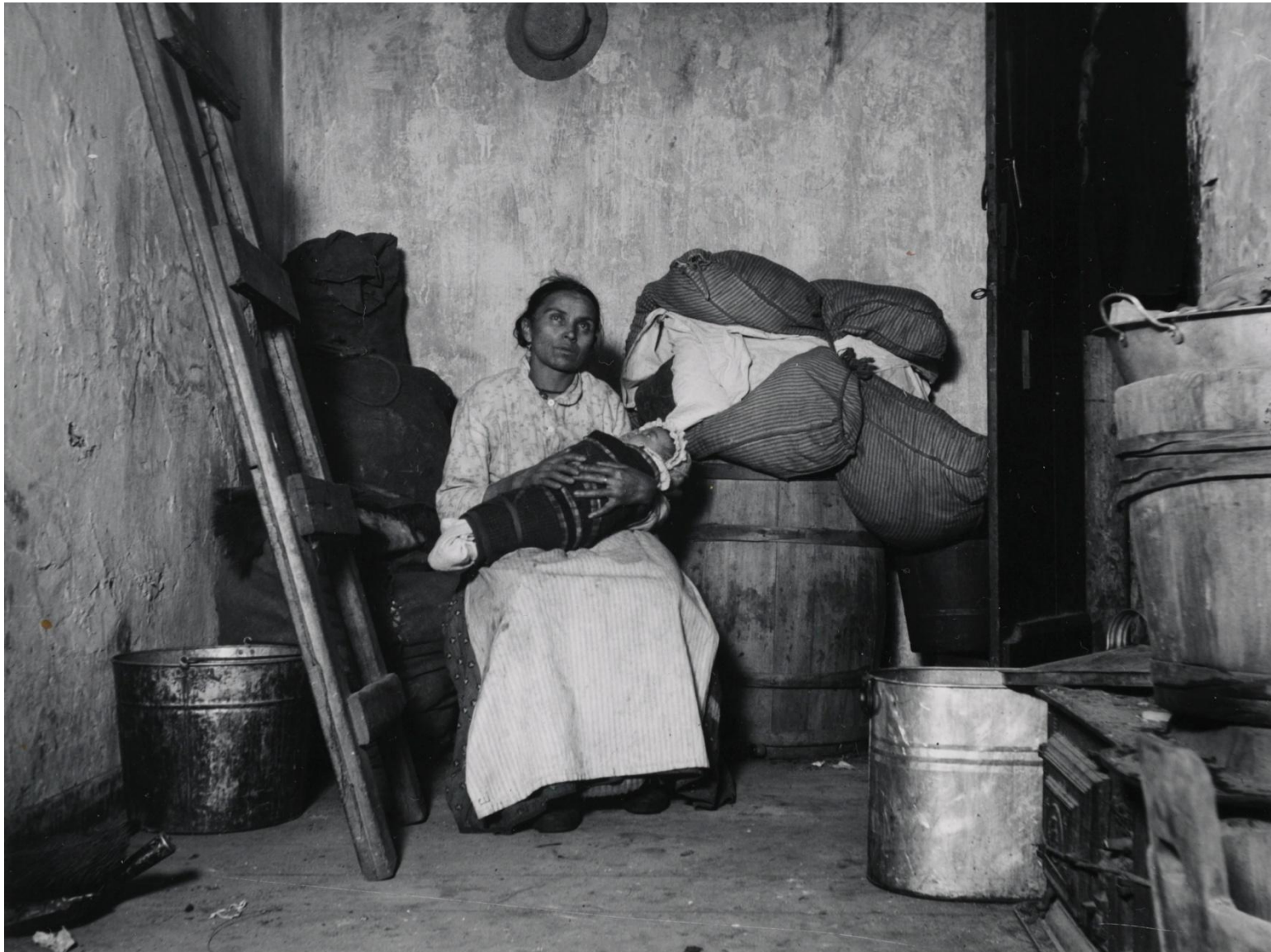
Home of an Italian Ragpicker.