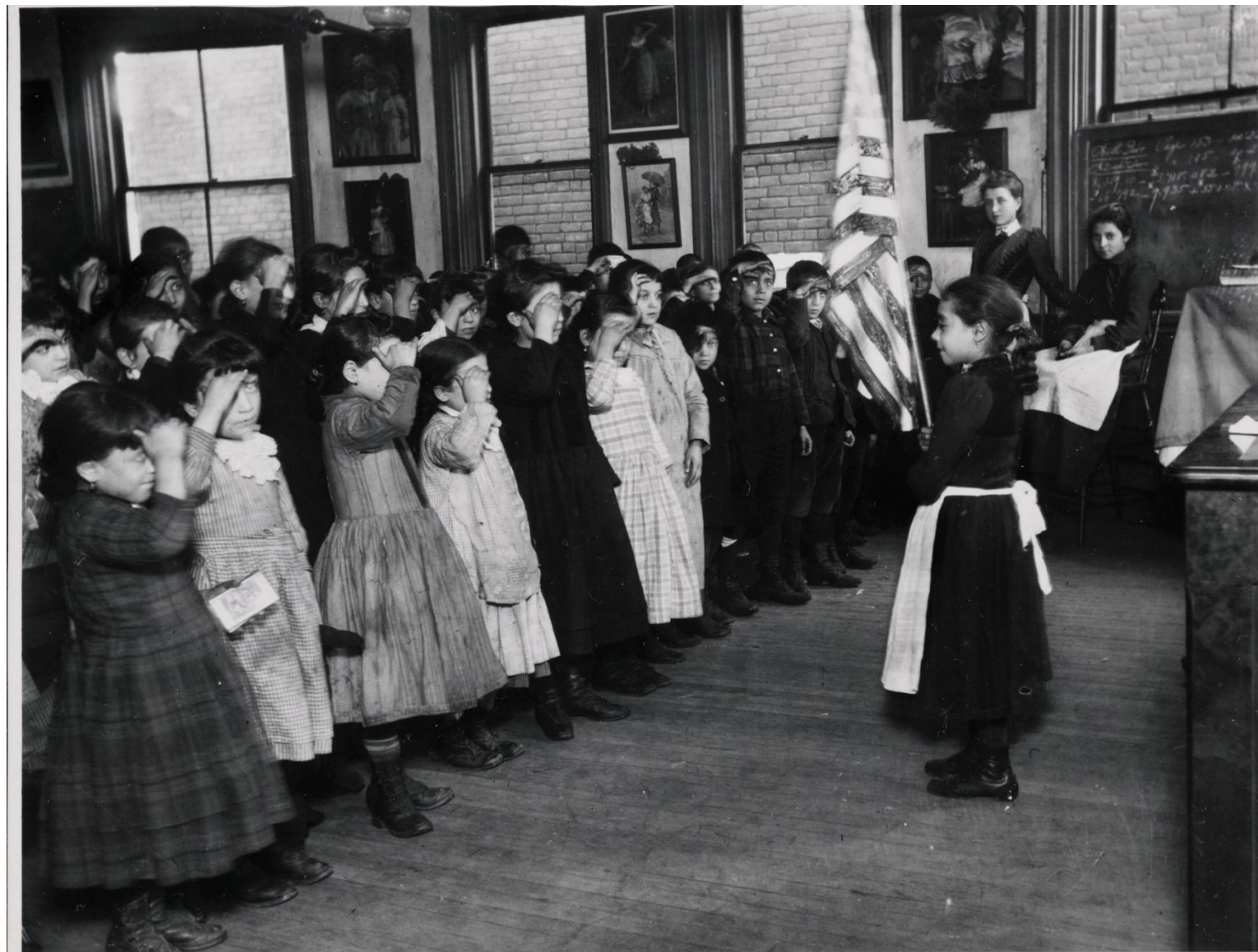
Sautig the flag in the Mott Street Industrial School