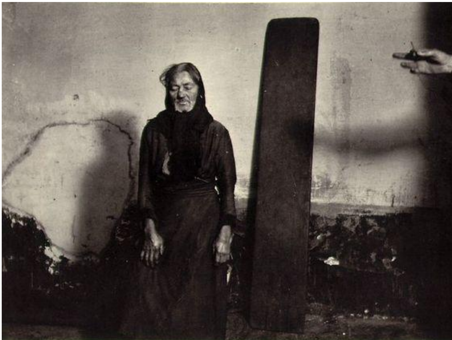
Police Station Lodger, A Plank for a Bed.