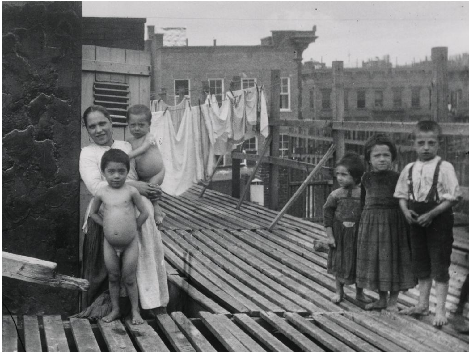
Scene on the Roof on the Mott Street Barracks