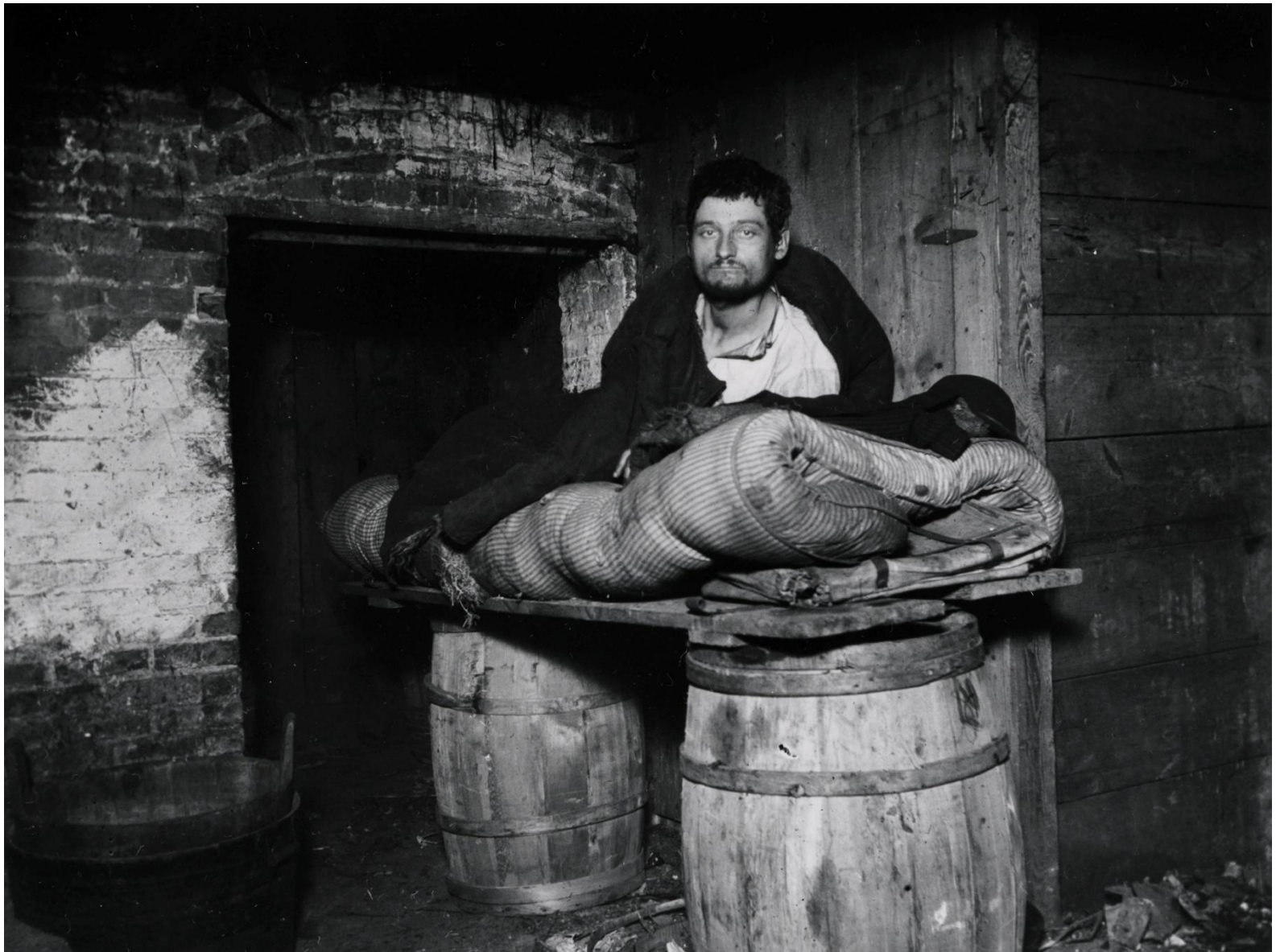
One of four Pedlars Who Slept in the Cellar of 11 Ludlow Street Rear.