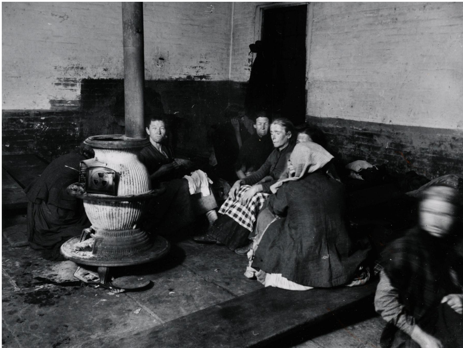
Elizabeth Street Police Station-Womans Lodgers