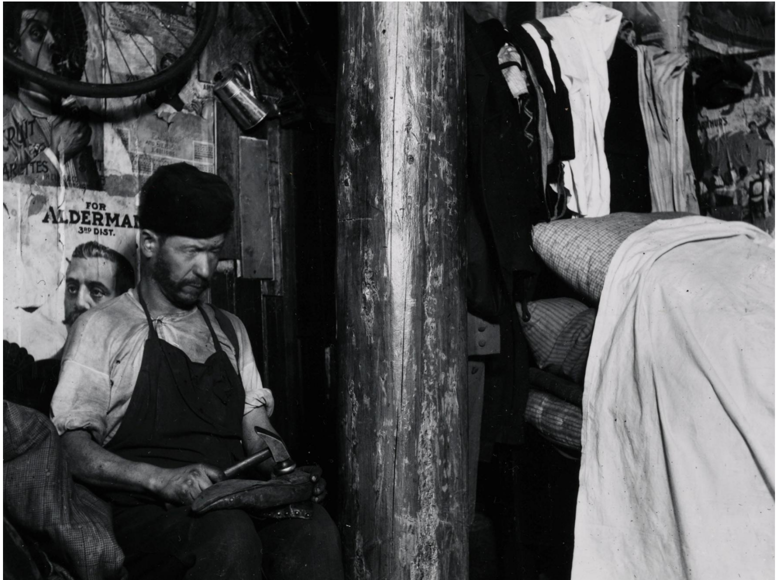
Shoemaker Working in a house in the Yard of 219 Broome Street, Which the Landlord Built When the Sanitary Police Put him out of the Basement. Clatterpol Sticks Up Through his House. Rent $ 12 a Month.