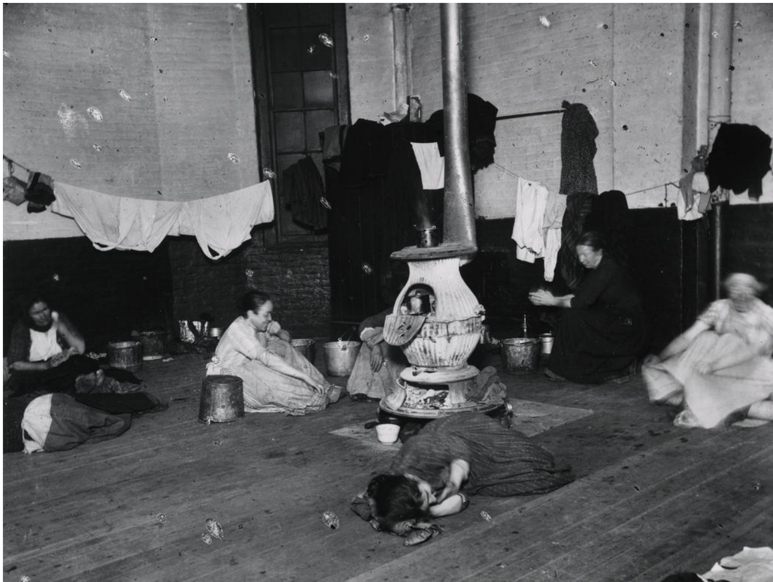
Women's Lodging Room in the West 47th Street Station.