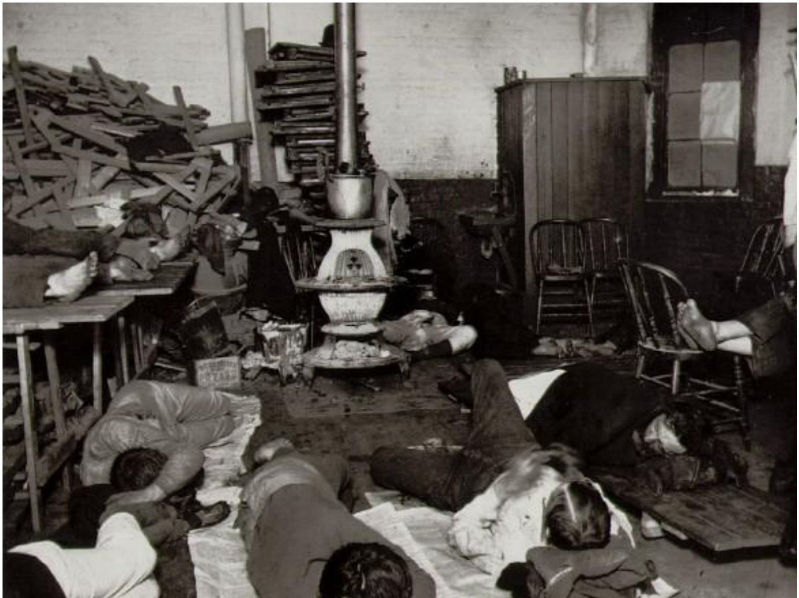
Men's Lodging Room in the West 47th Street Station.