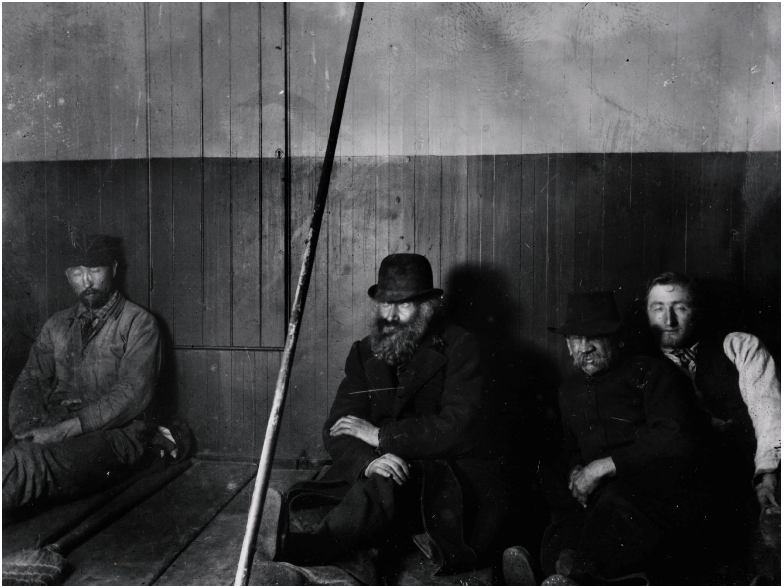
Group of Men. New York