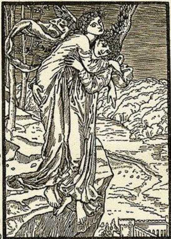
PSYCHE BORNE OFF BY ZE- PHYRUS, DRAWN BY EDWARD BURNE-JONES & ENGRAVED BY WILLIAM MORRIS