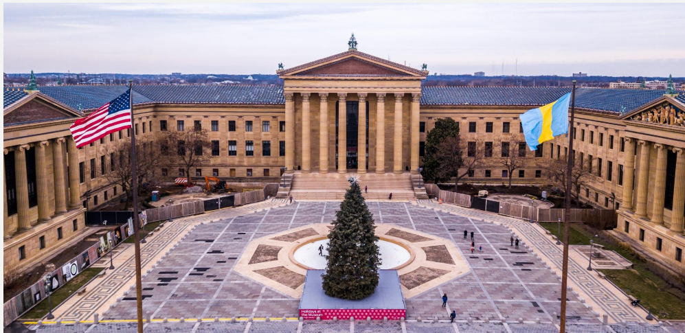
the Philadelphia Museum of Art