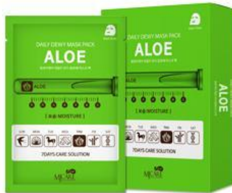
MJ CARE DAILY DEWY ALOE MASK PACK