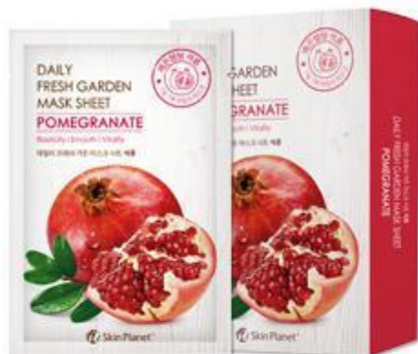
SKINPLANET DAILY FRESH GARDEN MASK SHEET POMEGRANATE