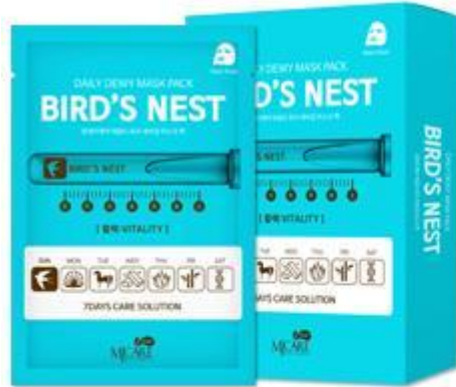
MJ CARE DAILY DEWY BIRD'S NEST MASK PACK