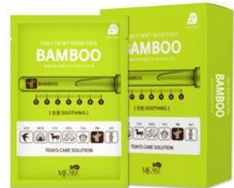
MJ CARE DAILY DEWY BAMBOO MASK PACK