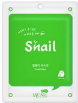
MJ CARE ON Snail Mask