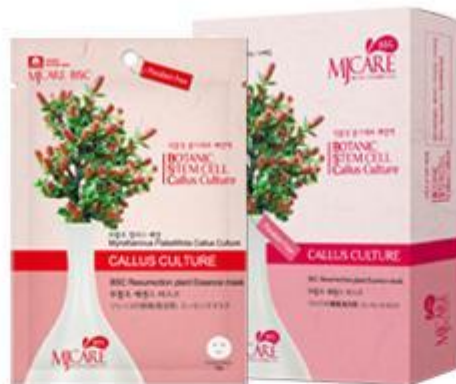
MJ CARE BSC Resurrection Plant Essence Mask