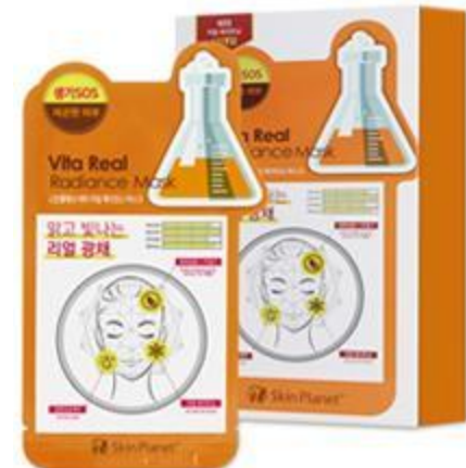
SKIN PLANET VITA REAL RADIANCE MASK