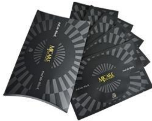
MJ CARE Premium Charcoal Black Mask