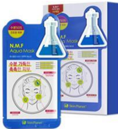
SKIN PLANET N.M.F AQUA MASK