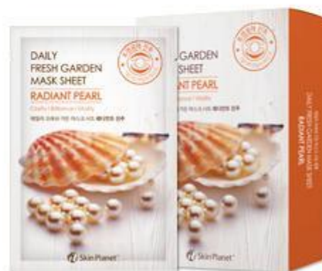
SKINPLANET DAILY FRESH GARDEN MASK SHEET RADIANT PEARL