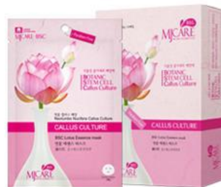
MJ CARE BSC Lotus Essence Mask