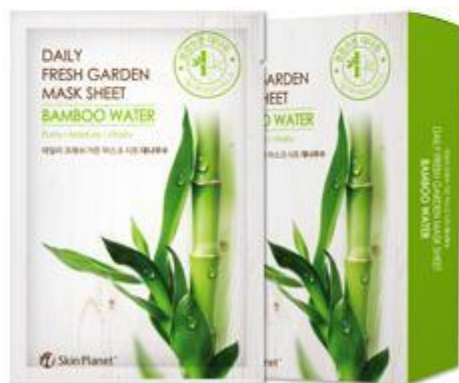
SKINPLANET DAILY FRESH GARDEN MASK SHEET BAMBOO WATER