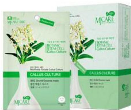
MJ CARE BSC Orchid Essence Mask