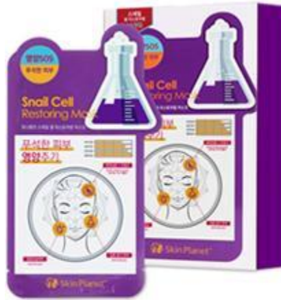
SKIN PLANET SNAIL CELL RESTORING MASK