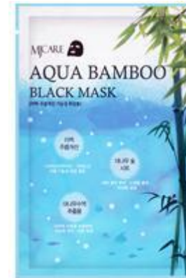
MJ CARE Aqua Bamboo Black Mask