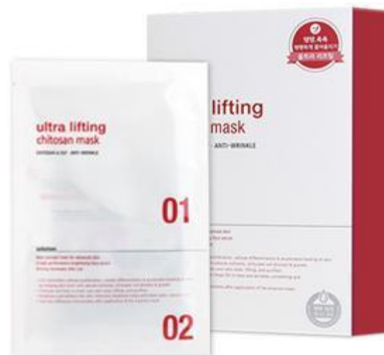
SKIN PLANET ULTRA LIFTING CHITOSAN MASK