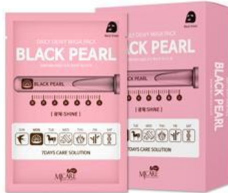
MJ CARE DAILY DEWY BLACK PEARL MASK PACK