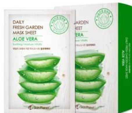
SKINPLANET DAILY FRESH GARDEN MASK SHEET ALOE VERA