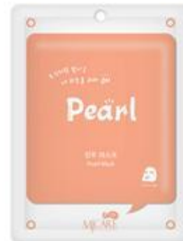
MJ CARE ON Pearl Mask