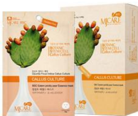
MJ CARE BSC Estem Prickly Pear Essence Mask