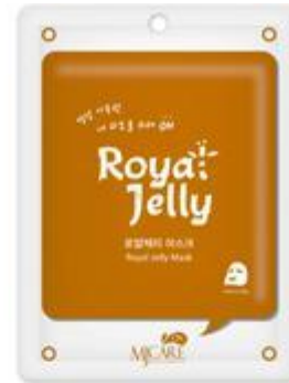
MJ CARE ON Royal Jelly Mask