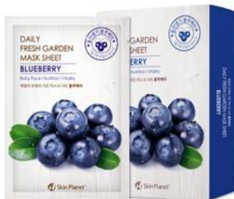
SKINPLANET DAILY FRESH GARDEN MASK SHEET BLUEBERRY