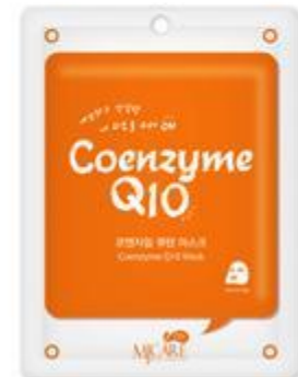
MJ CARE ON Coenzyme Q10 Mask