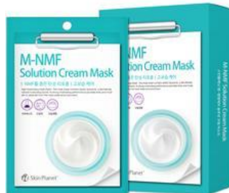
SKIN PLANET M-NMF SOLUTION CREAM MASK