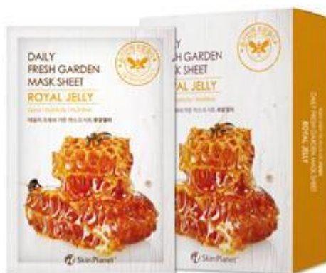
SKINPLANET DAILY FRESH GARDEN MASK SHEET ROYAL JELLY