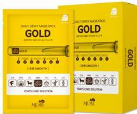
MJ CARE DAILY DEWY GOLD MASK PACK