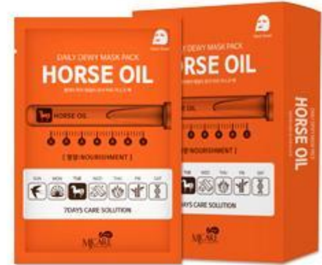
MJ CARE DAILY DEWY HORSE OIL MASK PACK