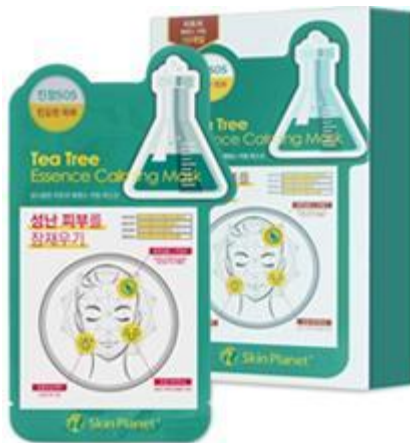
SKIN PLANET TEA TREE ESSENCE CALMING MASK