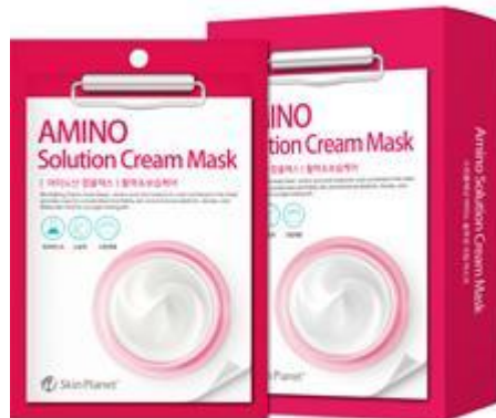
SKIN PLANET AMINO SOLUTION CREAM MASK