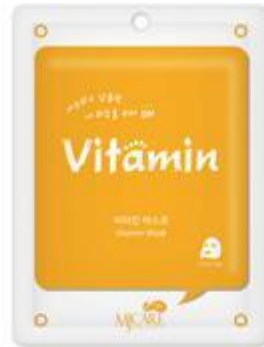
MJ CARE ON Vitamin Mask