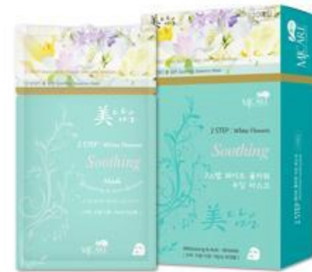
MJ CARE MIDAMEUN(2STEP) White Flower Soothing Mask