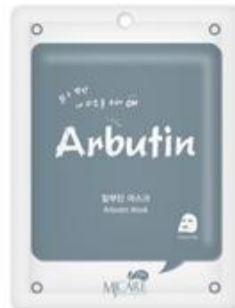
MJ CARE ON Arbutin Mask