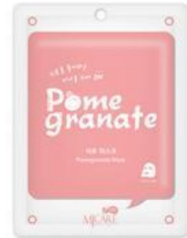
MJ CARE ON Pomegranate Mask