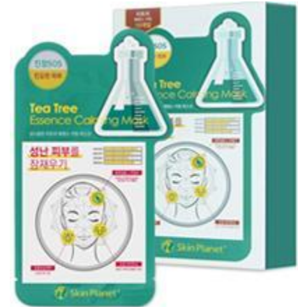
SKIN PLANET TEA TREE ESSENCE CALMING MASK