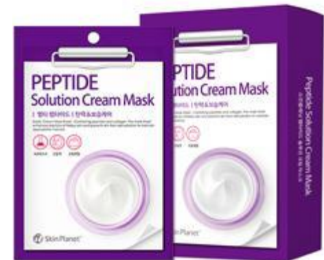
SKIN PLANET PEPTIDE SOLUTION CREAM MASK