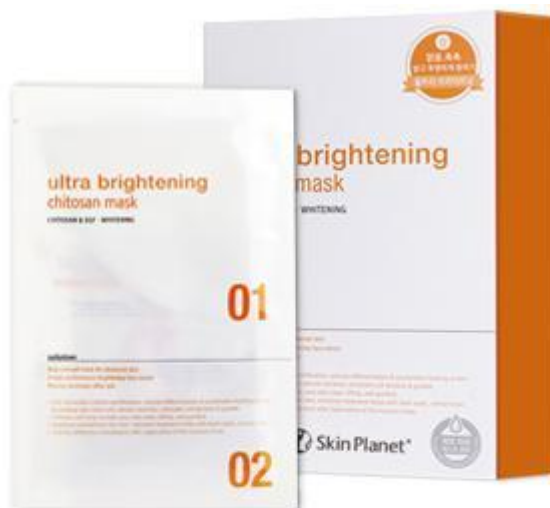
SKIN PLANET ULTRA BRIGHTENING CHITOSAN MASK

SKIN PLANET:@USD3.53/box(one box has 5pcs)