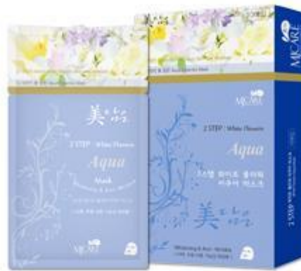
MJ CARE MIDAMEUN(2STEP) White Flower Aqua Mask