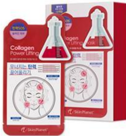
SKIN PLANET COLLAGEN POWER LIFTING MASK