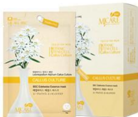
MJ CARE BSC Edelweiss Essence Mask