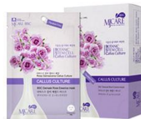
MJ CARE BSC Damask Rose Essence Mask