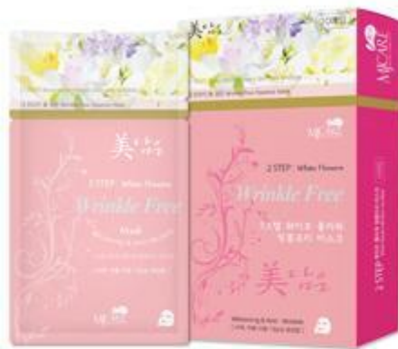
MJ CARE MIDAMEUN(2STEP) White Flower Wrinkle Free Mask