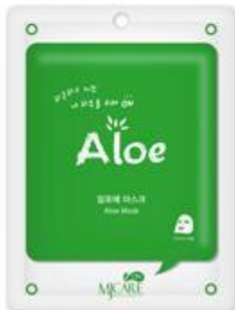
MJ CARE ON Aloe Mask