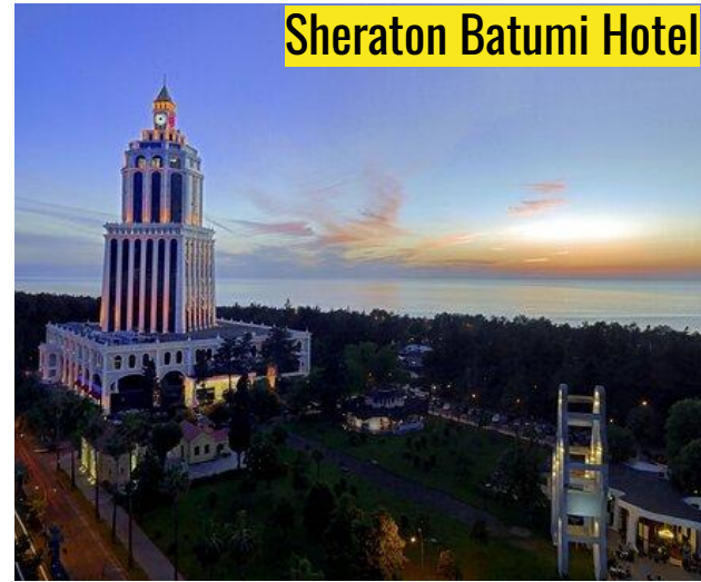
Sheraton Batumi Hotel