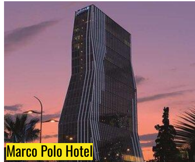
Marco Polo Hotel