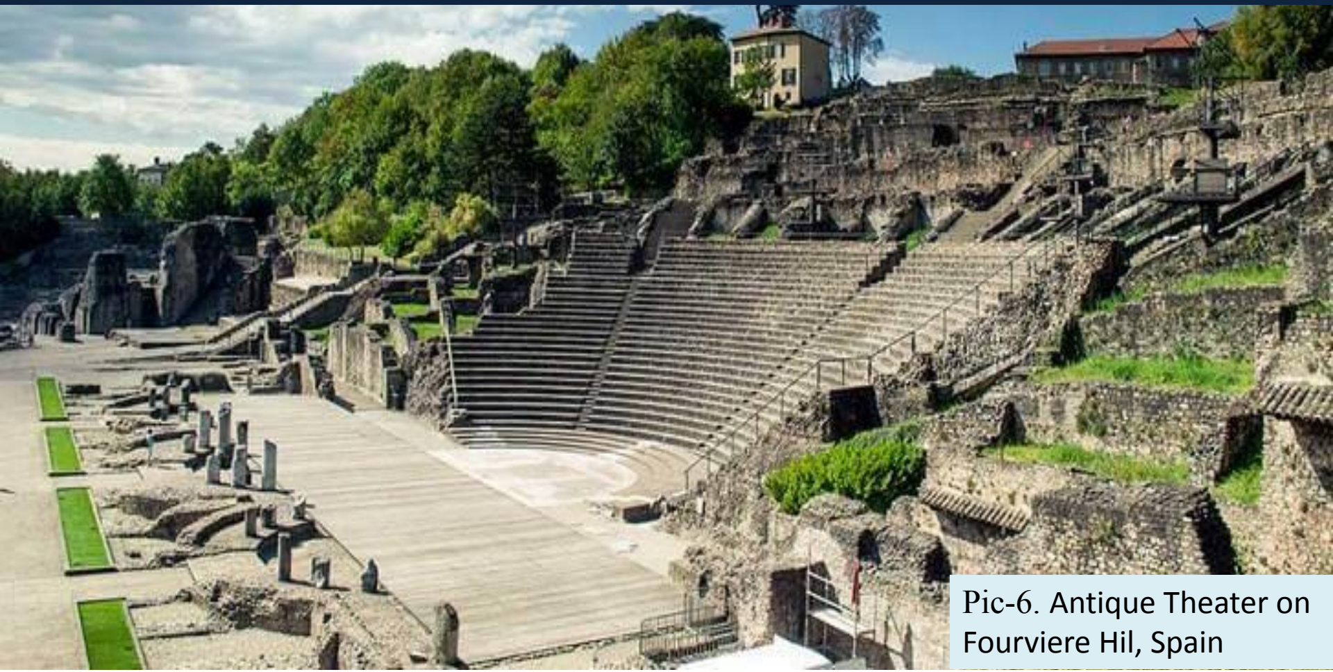
Pic-6. Antique Theater on Fourviere Hil, Spain

Put up with, bring about, run into, turn out, catch up on, pick up, go through, wear out