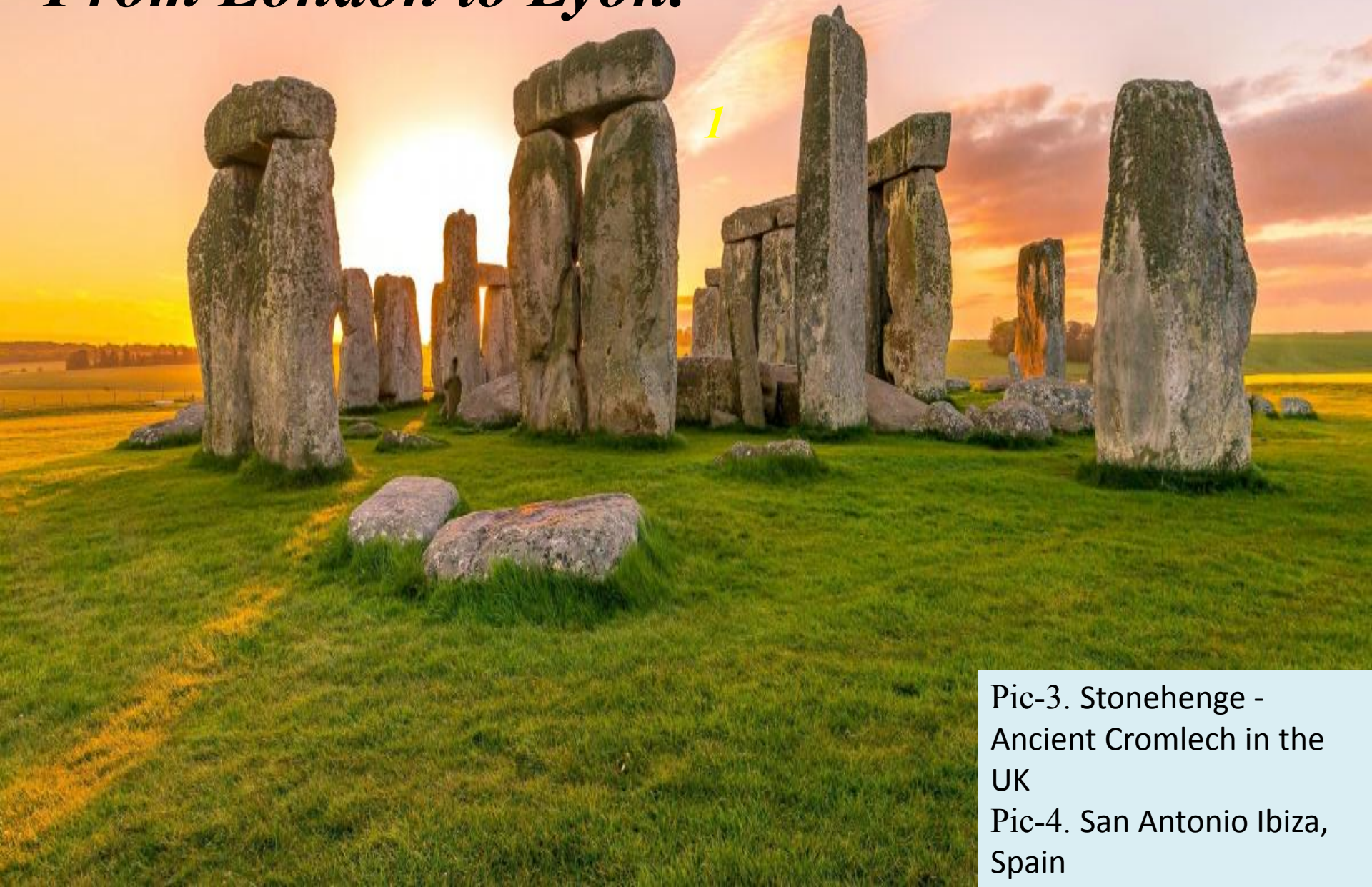
Pic-3. Stonehenge - Ancient Cromlech in the UK Pic-4. San Antonio Ibiza, Spain