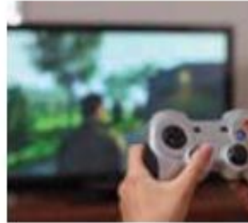
1 games console

backpack games console laptop computer mobile phone mountain bike skateboard