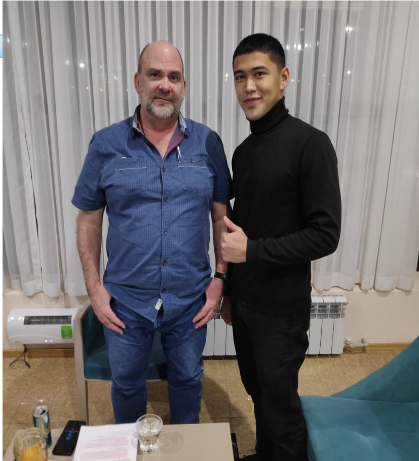
Sunkar Hotel (December 4 th ,2019)