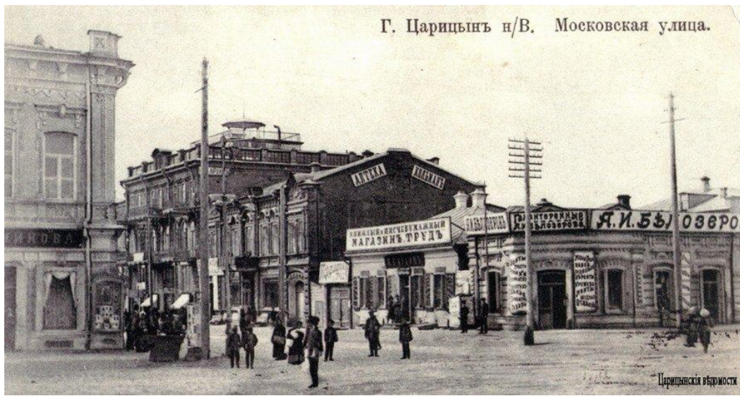
Г. Царицынъ н/В. Московская улица.

From 1589 to 1925 he was called Tsaritsyn , from 1925 to 1961 - Stalingrad .