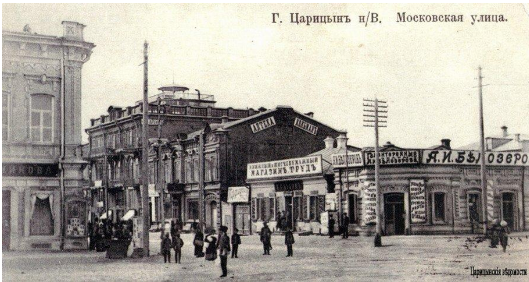
Г. Царицынъ н/В. Московская улица.

From 1589 to 1925 he was called Tsaritsyn , from 1925 to 1961 - Stalingrad .