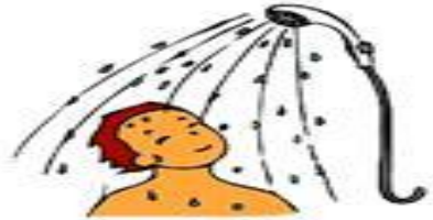
have a shower