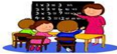
learn at school