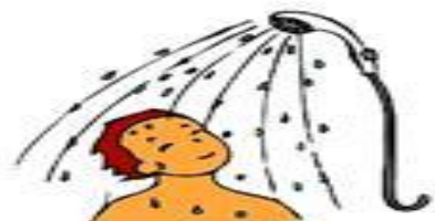
have a shower