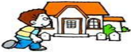
get back home