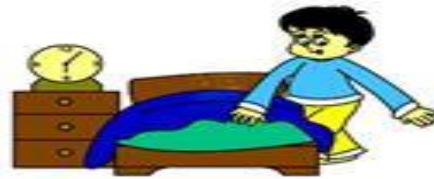
go to bed