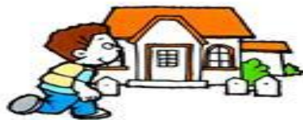
get back home