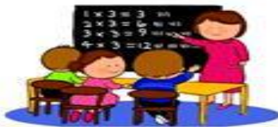
learn at school