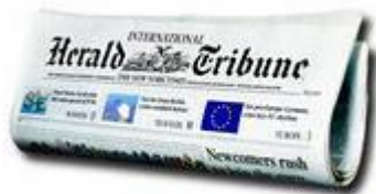
THE WORLD'S DAILY NEWSPAPER