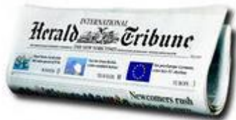
THE WORLD'S DAILY NEWSPAPER