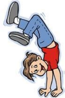
do a handstand