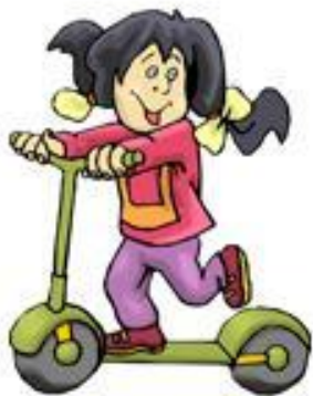
ride a scooter