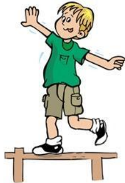
balance on one foot