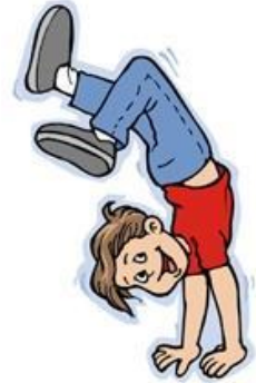
do a handstand