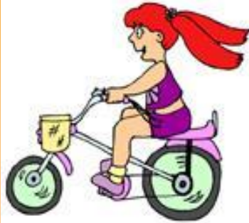
ride a bike