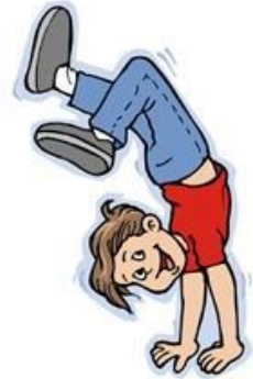
do a handstand