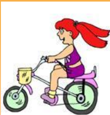
ride a bike