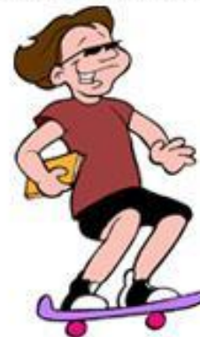
ride a skateboard