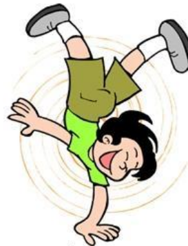
do a cartwheel