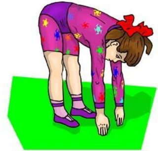
touch your toes