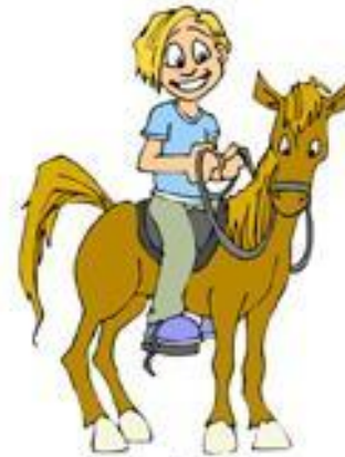
ride a horse