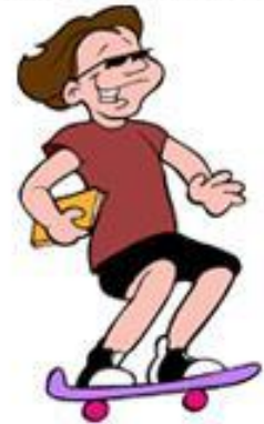
ride a skateboard