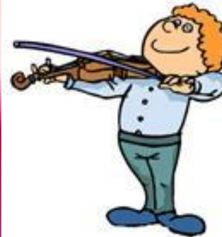
play the violin