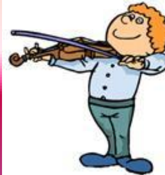
play the violin