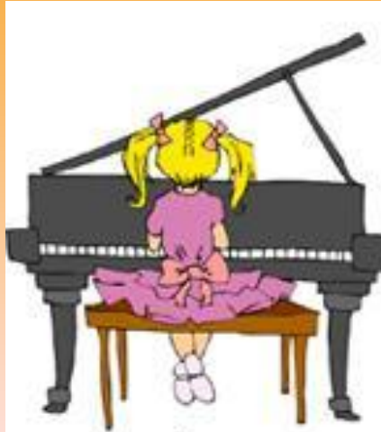
play the piano