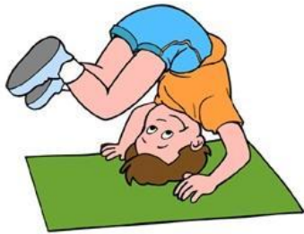
do a somersault