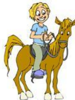
ride a horse