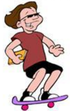
ride a skateboard